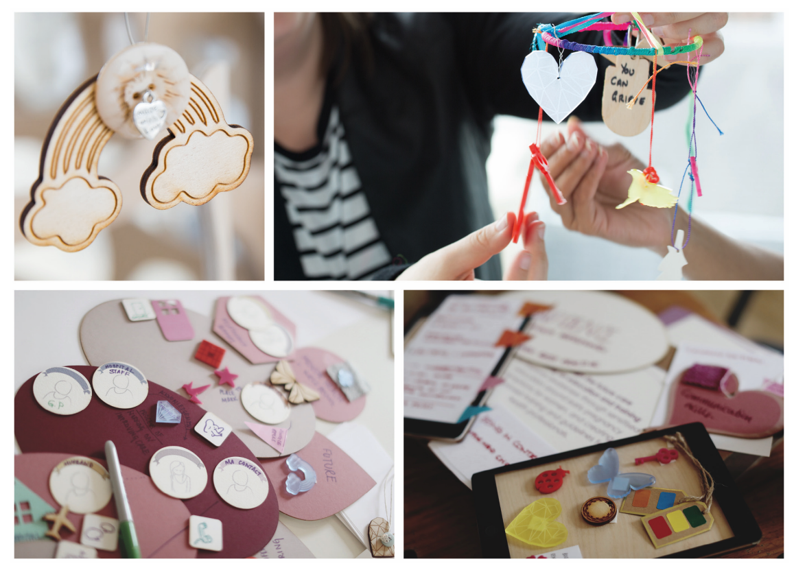
Figure 1. Individual and collective meaning making, expression of lived experience and co-design of future care.