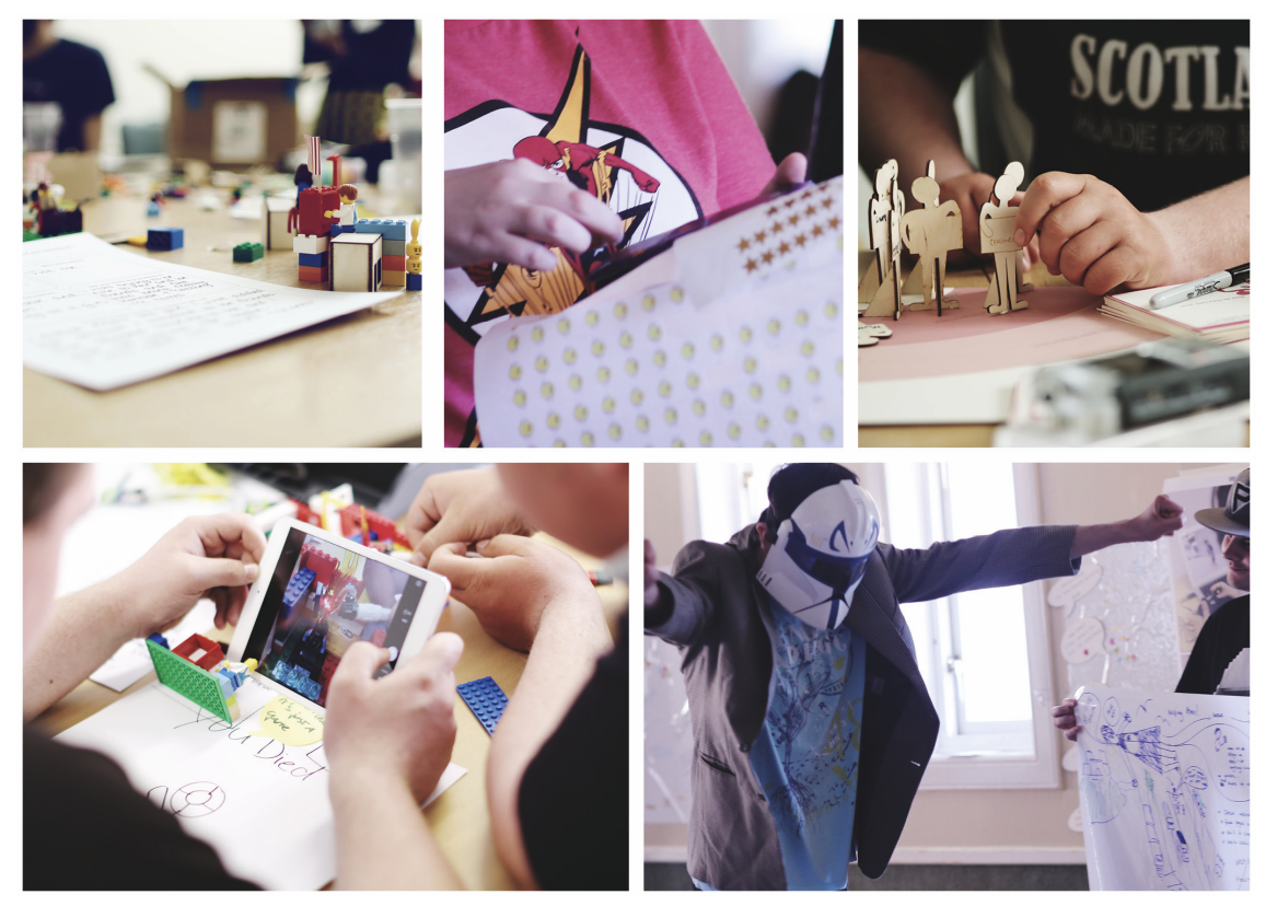
Figure 2. Use of multi-method approaches for expression of individual experiences while supporting collaboration.