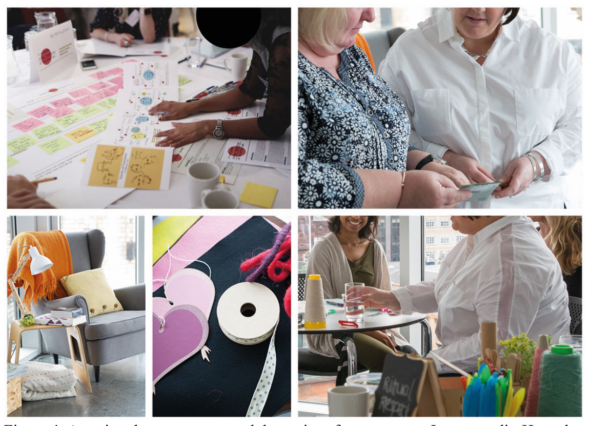
Figure 4. Attuning the space, tone and dynamics of engagement.

'interviewer and interviewee' imposed when sitting across from each other. In the latter example, the venue was a private room within a public building and each element added to the room was carefully chosen, including small round tables for dialogue and collaboration. Alongside this, a comfortable corner with relaxed seating and materials such as books and soft furnishing created a more reflective and private nook if participants wished to take a break during the engagements. Refreshments available throughout the process created a comfortable personal and social experience, helping to set a relaxed pace and tone. The aesthetics of care also translated into the choice of materials and colour palette of tools and artefacts designed for the engagements.