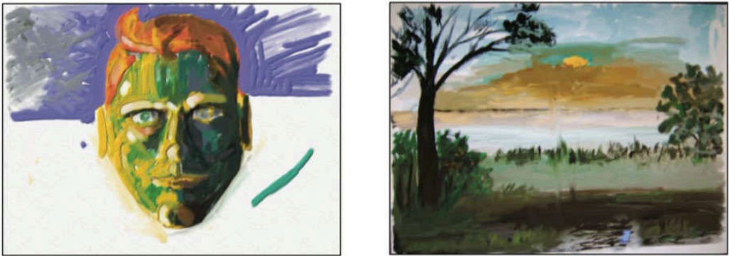
Figure 3: Selected artworks by the participants made with IntuPaint

All of the above systems' target users were professional artists or users with a satisfactory understanding of digital sketching applications (e.g., Adobe Photoshop). Users' artwork from research conducted by Vandoren and colleagues (2008) reveals their skill in employing the brush and its direct impact on their experience (see Figure 3). The author wondered whether supporting amateurs without the skills to experience a drawing is a potential direction for design, specifically in terms of enhancing users' operation of digital tools. Current digital tools do not help users to engage with elaborate paintings, which have more complex colour assortments and compositions.