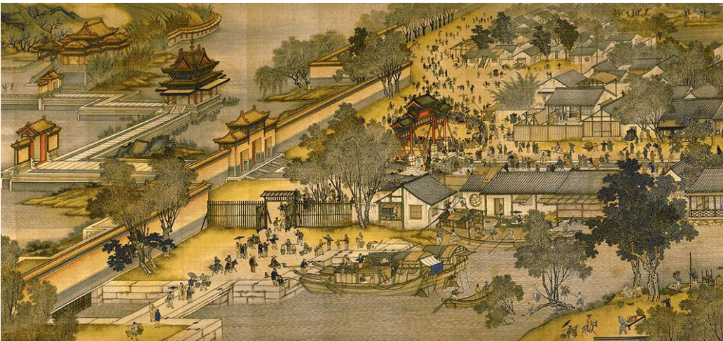
Figure 1: The portion of Along the River during the Qingming Festival , twelfth century, Song Dynasty

In the abovementioned case studies, interactive technology used for an immersive experience only focused on digitised replicas. Viewers' visual and acoustic enjoyment was improved to a certain extent, giving them more opportunities to appreciate the authentic details and content of ancient Chinese paintings. However, their background knowledge and the aesthetic meaning of the ancient Chinese paintings were disregarded (Foni, Papagiannakis, and Magnenat-Thalman 2010). Moreover, the paintings examined in these case studies were all elaborate ones, rather than freehand brushwork. Elaborate paintings, which display specific characters, buildings, or environments differ from freehand brushwork, which carries much symbolic significance, cultural meaning, and emotions. Thus, ways of revealing cultural and aesthetic knowledge in an immersive experience remain undeveloped, limiting viewers to simply browsing. In other words, the implied significance of Chinese paintings supports viewers' understanding; hence, it is necessary to emphasise aesthetic meaning.