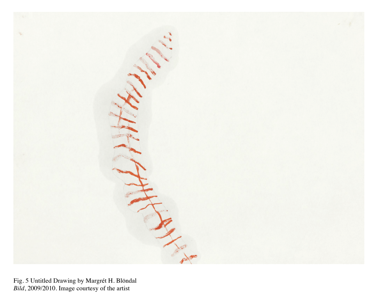
Fig. 5 Untitled Drawing by Margrét H. Blöndal Bild , 2009/2010.