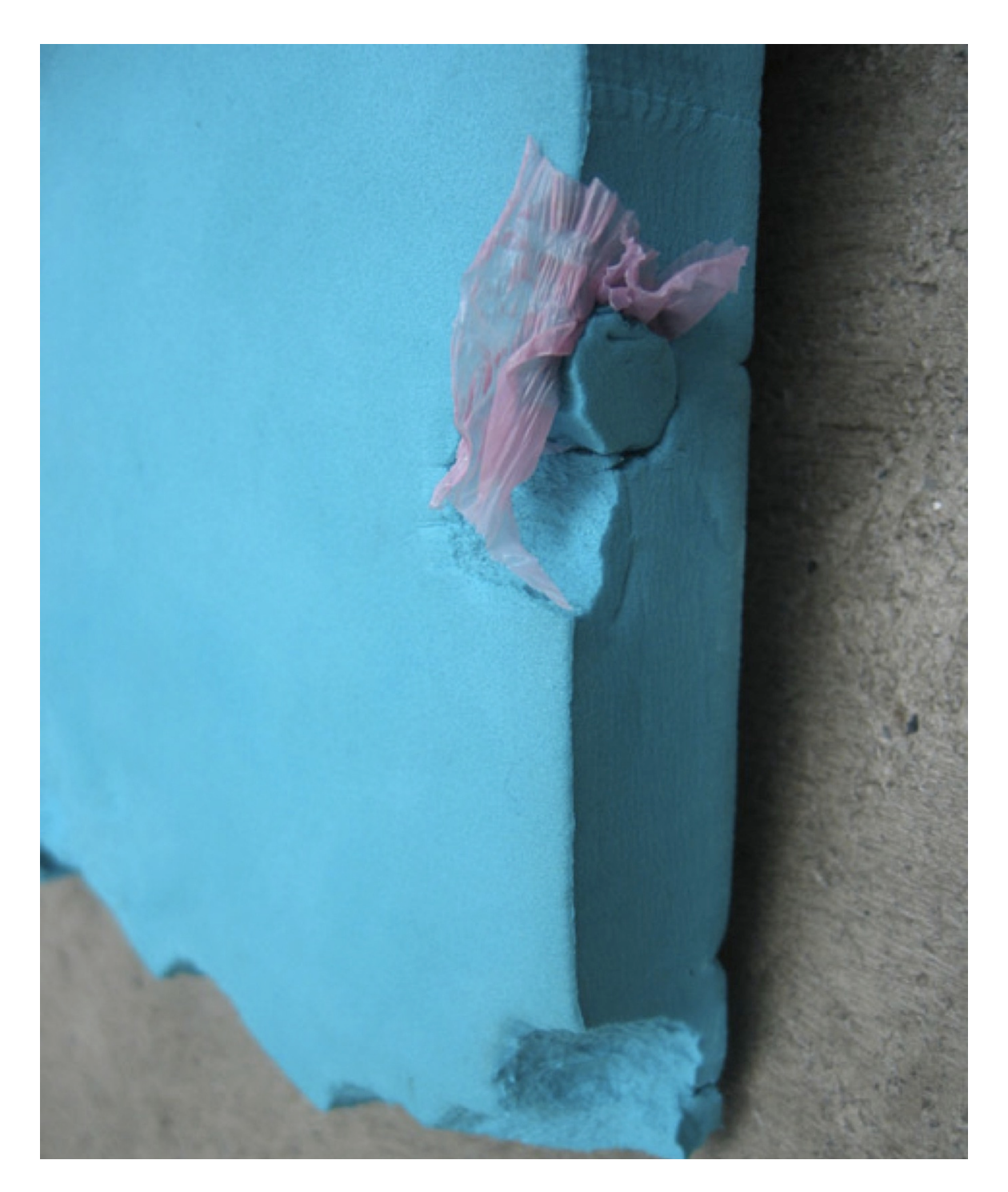
Fig. 1 Detail, Sieves exhibition by Margrét H. Blöndal Mothers' Tankstation, Ireland, 2007.