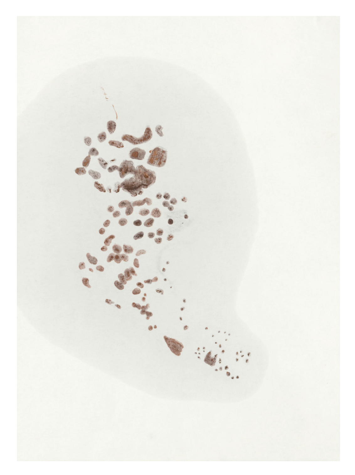
Fig. 4 Untitled Drawing by Margrét H. Blöndal Bild , 2009/2010.