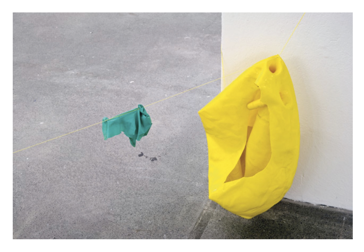
Fig. 8 Detail Touching the membrane/Threifad á himnunni exhibition by Margrét H.Blöndal Reykjavík Art Museum, Iceland, 2007.

draws, and whilst the 'real' is not severed from her work it is hinged on a reimagination of what she perceived and encountered. Which in so doing allows movement to take centre stage. Regarding observation as more than just direct immediate perception, the issue of what is represented also becomes more nuanced and allows the artist to present a multi-faceted perspective that problematizes a singular moment of imitative representation. The notion of a prism is useful here. Prisms diffuse light into its constituent parts, individualising colours which are not apparent to the naked eye. A refracted essence is revealed through altering what is normally seen. Abstraction is similarly able to offer an essence through the re-representing of what is perceived but without being tied to the moment of perception.