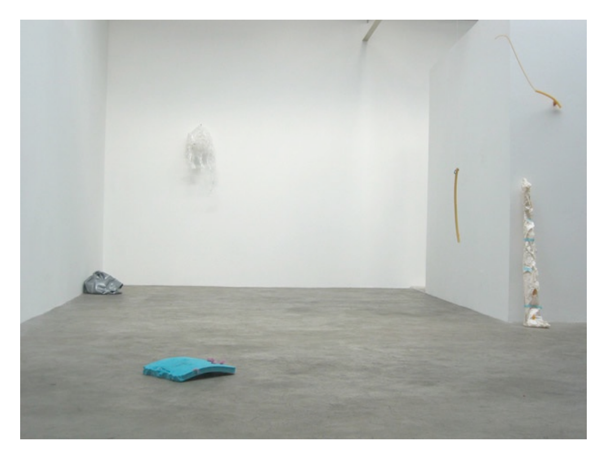
Fig. 2 Detail, Sieves exhibition by Margrét H. Blöndal Mothers' Tankstation, Ireland, 2007.

artist's choice of medium also reflecting this context. As with other contemporary Western art traditions the status of drawings in Iceland today is ambiguous and confused: they occupy a profile that flits between denying their legitimacy and dismissing them as purely preliminary or championing their sensitivity and worth. Moreover, their properties tie them in to broader transnational discourses on drawing that lie beyond Iceland's borders. Gunnar J. Árnason tells us in his essay for the exhibition Icelandic and Norwegian Drawings, held at Reykjavík Art Museum in 2001, that Icelanders imagine drawing to be the foundation of the creative process itself. In support of this claim he cites the high regard that Jóhannes S. Kjarval and Gunnlaugur Scheving, two of the country's earliest exponents of the medium, enjoy today. Both artists primarily used drawing as preparation for their painting (Kvaran 1998), and not as an independent art form, thus reinforcing the association of drawing with preparatory sketches. Nevertheless as Árnason goes on to note, artists' apprehension of the medium has undergone a marked transformation since the mid-twentieth century. He considers the move in the 1960s that questioned 'the idea that dexterity and genius were the pillars of artistic creation' (2001:33), to have been decisive in this regard. In this debate, draughtmanship – as an index of artistic vision – was subordinated to the concept as the