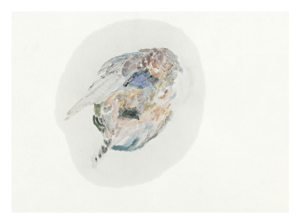
Fig. 3 Untitled Drawing by Margrét H. Blöndal Bild , 2009/2010. Image courtesy of the artist