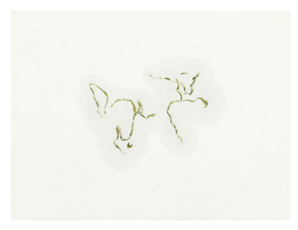
Fig. 6 Untitled Drawing by Margrét H. Blöndal Bild , 2009/2010.