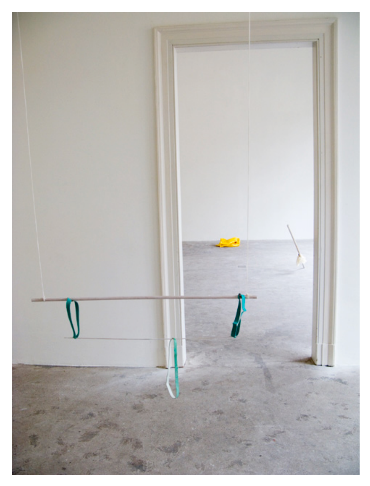
Fig. 9 Detail STROMRISS exhibition by Margrét H.Blöndal Nicolas Krupp Gallerie, Basel, 2008.