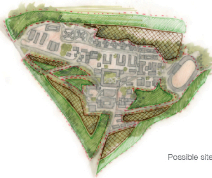
Possible sites for development