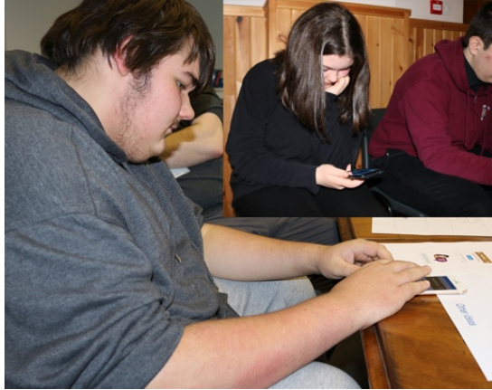
Figure 3: throughout the research, feedback from participants was consistently positive.

be beneficial, although only one participant had experience of using audio to access information from a website. Several participants commented that the topics read well because the information was clear and concise, which they said was important. Participants also gave useful feedback on concepts for the visual design of HasAnswers, including preferring a flat-ish design over 3D effects and an aesthetic that is not 'too light-hearted or childlike' .