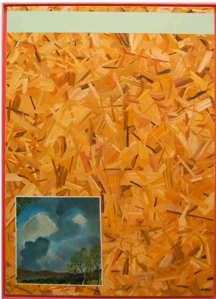
Storm Coming 2016

Gonczarow has taken out the main characters of Gainsborough's work, and replaced them, as it were, with wooden flakes – brushmarks of equally minor importance, which add up to a major presence. Minor-ness pulls at protagonists' privilege.