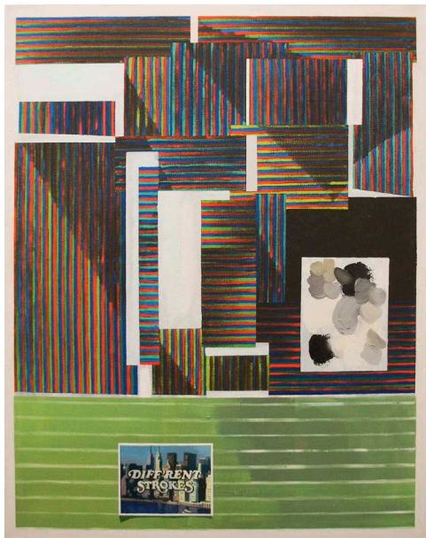
In the mid 1980's Between 4-5pm on ITV 2016