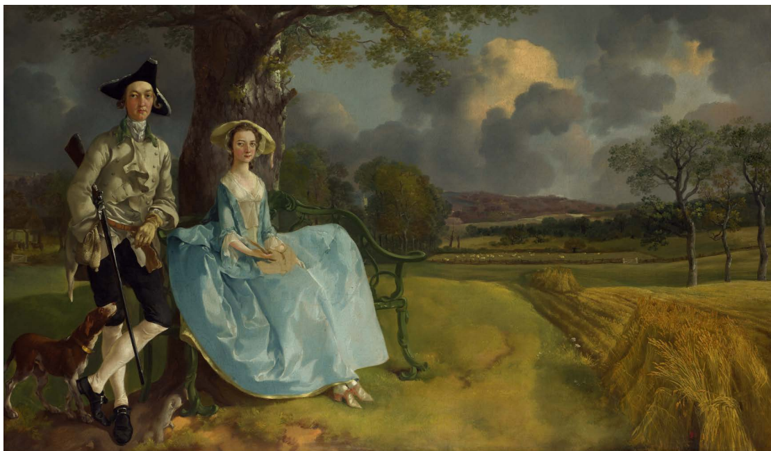
Mr. and Mrs. Andrews 1750 Thomas Gainsborough