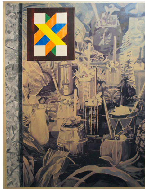
Stars Wars Figures 2016

Writing on nineteenth century literature, Alex Woloch argued that minor characters are the proletariat of the novel. 4 Nineteenth century novels – so thoroughly preoccupied with class – always privileged some characters over others, spent much more time with their protagonists than with their incidental actors. Yet still, these novels proffered the possibility that any of their minor characters could have been the protagonist. Even as the narrative form singled out privileged players, it also held open the promise that such privileging could be superseded with a different – or even more egalitarian – distribution of narrative attention. Minor characters thus reflexively draw attention to the limits of the text's egalitarianism. In the visual grammar of oriented strand board – and of Gonczarow's painting of it – no component piece is given precedence over any other. The OSB is a flecked surface of equally insignificant flakes, of equally minor characters – reconceived, here, as a lavish weave of paint and brushwork, an ironically upgraded cheap surface.