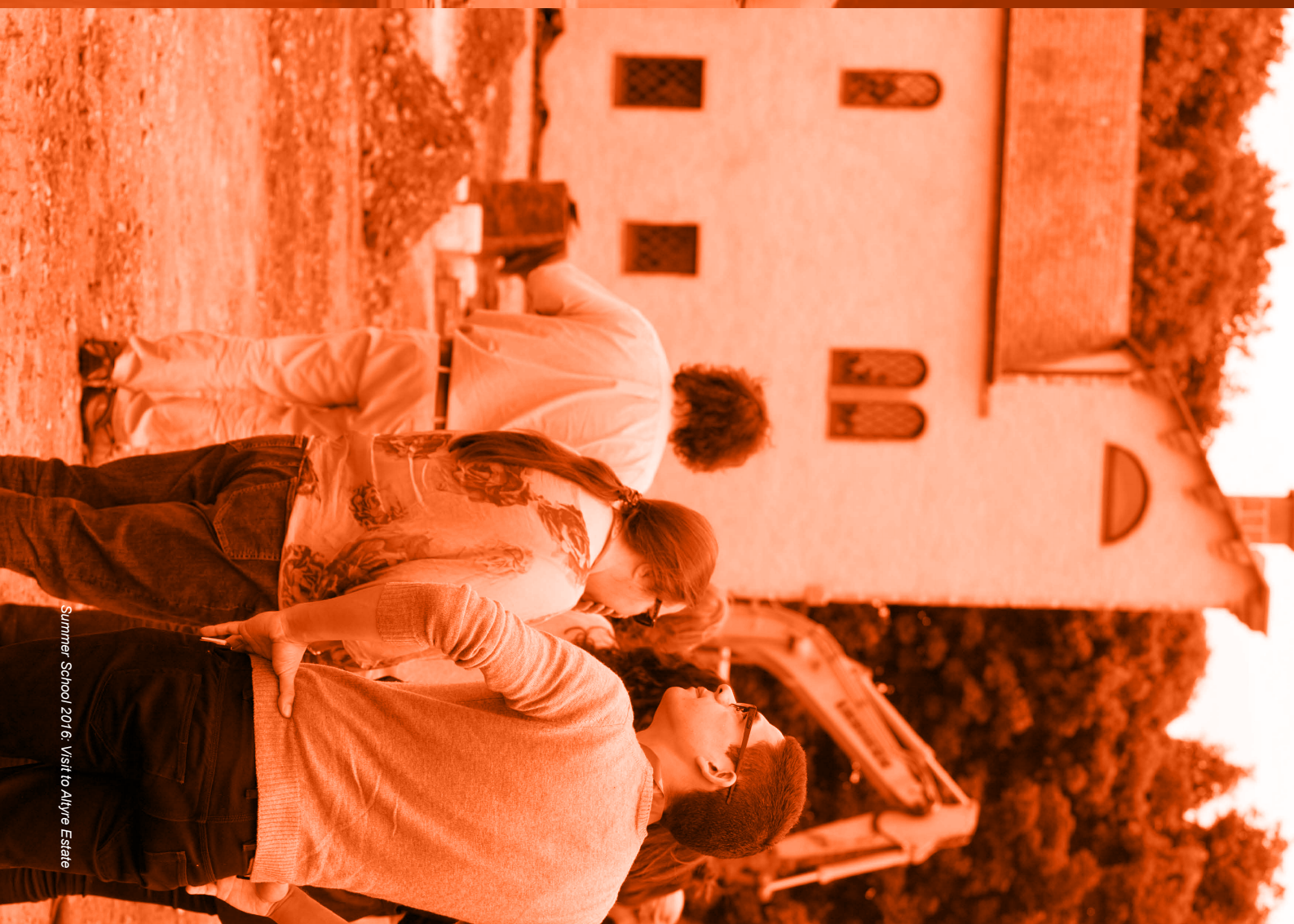
Summer School 2016: Visit to Altyre Estate