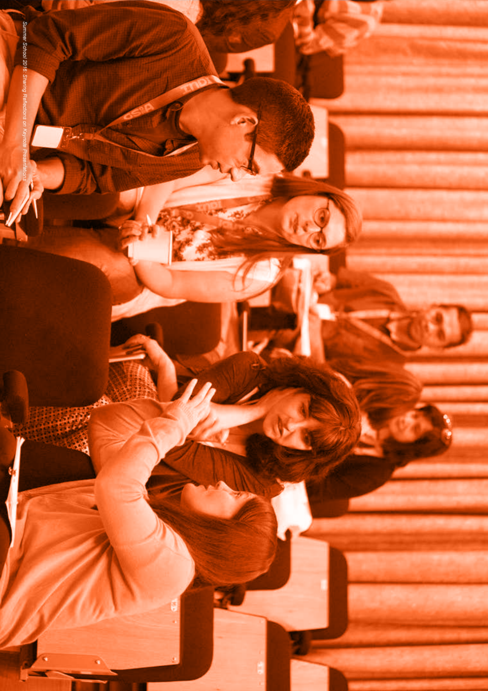
Summer School 2016: Sharing Reflections on Keynote Presentations