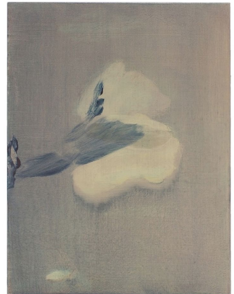
Ascent, Blå Huset – Karen Roulstone 2015 Oil on wooden panel 30 x 40 cm

Just as Helen Frankenthaler's 'soak stain' technique transformed the way in which the materiality and properties of paint might be understood, I think Nicholls' distinctive engagement with watercolour draws us into its liquidity in the dilution and dispersal of pigment which rides on the play between chance, control, and containment on a monumental scale. There is something lyrical about the transformative nature of the process of solid pigment dissolving into liquid and the evaporation back to dry sediment again – the transition of states of matter, particles, and their movements. The lusciousness of the pigments captivates and transports the viewer. What I am left with is a residing sense that, in this moment of animation, translation, and resolution, her paintings come to me as the ethereal colour of liquid thought.