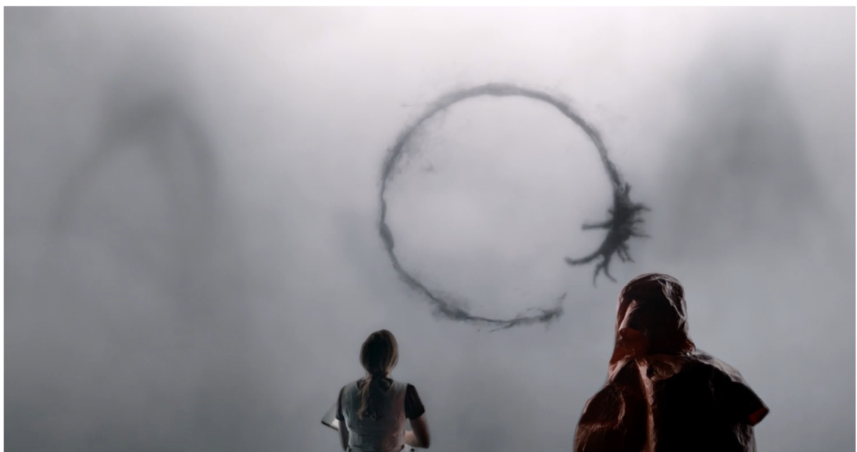
Figure 4 - Denis Villeneuve, Arrival (2016)

and future into some type of continuity or simultaneity with the present, the present is allowed to expand to occupy everywhere and everything. To distinguish between the two might seem a minor or pedantic turn of phrase, but it is essential to note that while the first state continues to maintain the values of 'past' and 'future', for the second temporality ceases to be a contingent value. Under this paradigm the hierarchical function structured by linearisation is dissolved, emancipating any experienced present from the weight of history. In this, the present is not determined by the past, nor does it reproduce the past, and the very conception of history and its ideological influence ceases to be reductive of the present moment.