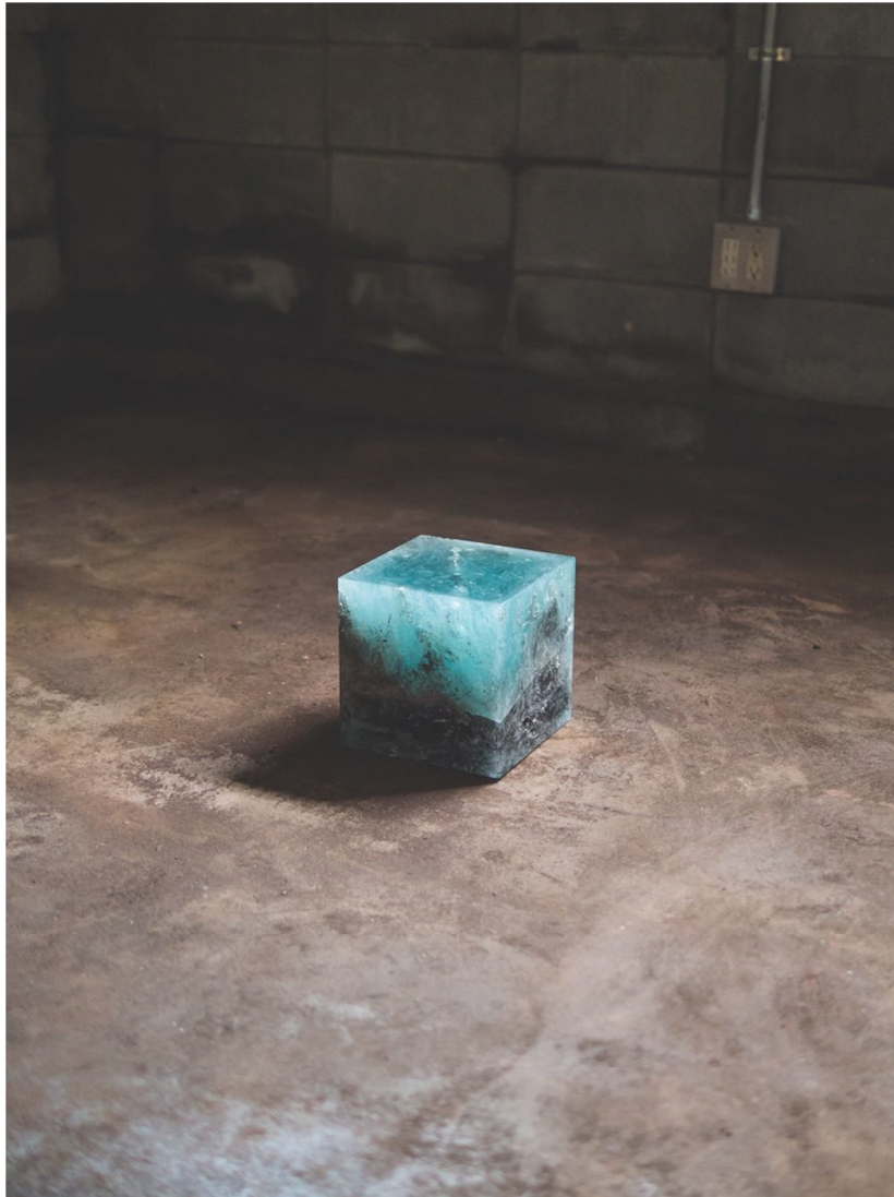
Figure 5 – Trevor Paglen, Trinity Cube (2015)

outside the lived human present. There is no public for this artwork, only the public of the future, the human to come. Through its irradiated materialism, this monument has instrumentalised the debris and fallout of nuclear development and nuclear catastrophe, reconfiguring a history of beginnings and endings to manifest a temporality referenced only as outside the immediate present.