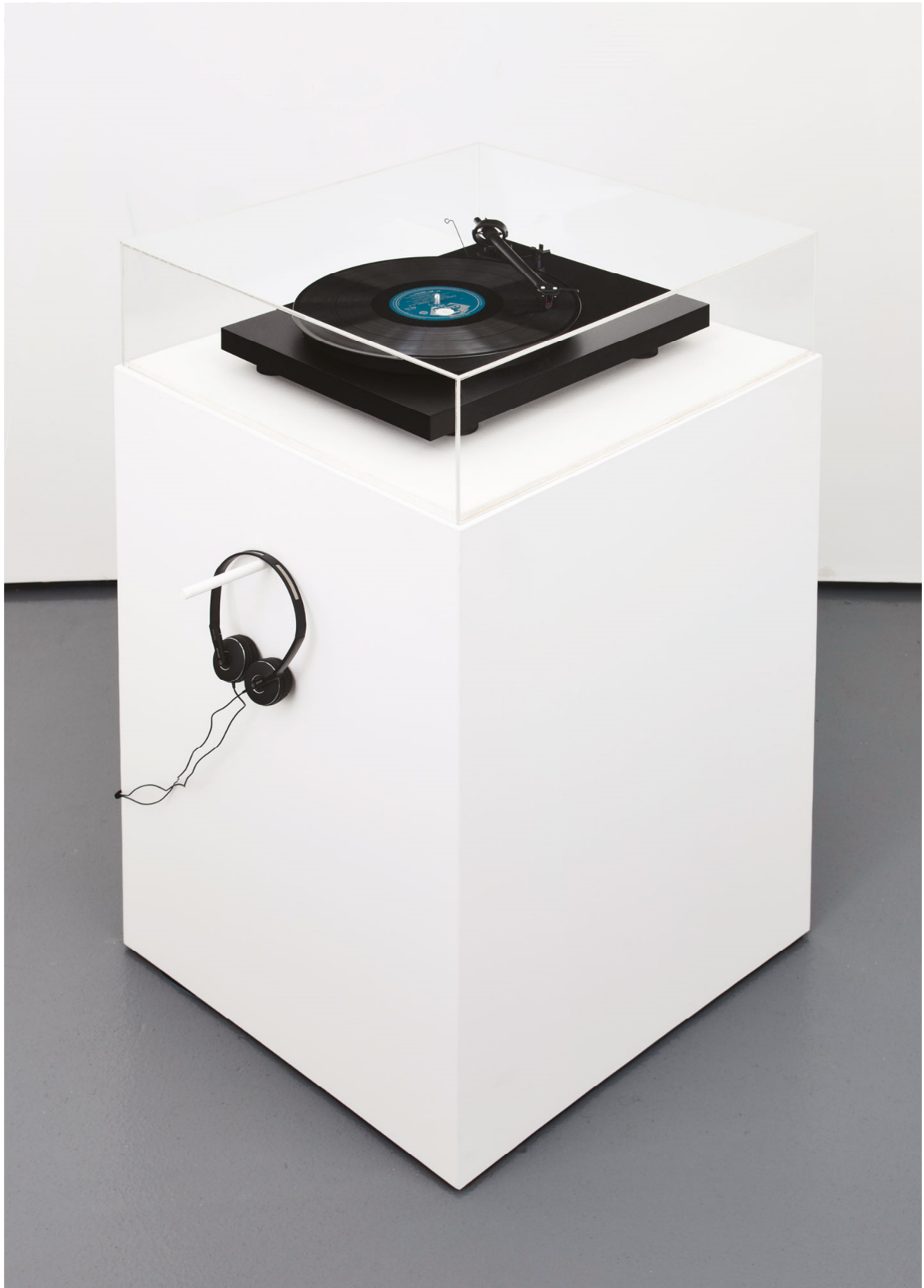
Figure 7 - Katie Paterson, As The World Turns (2010)