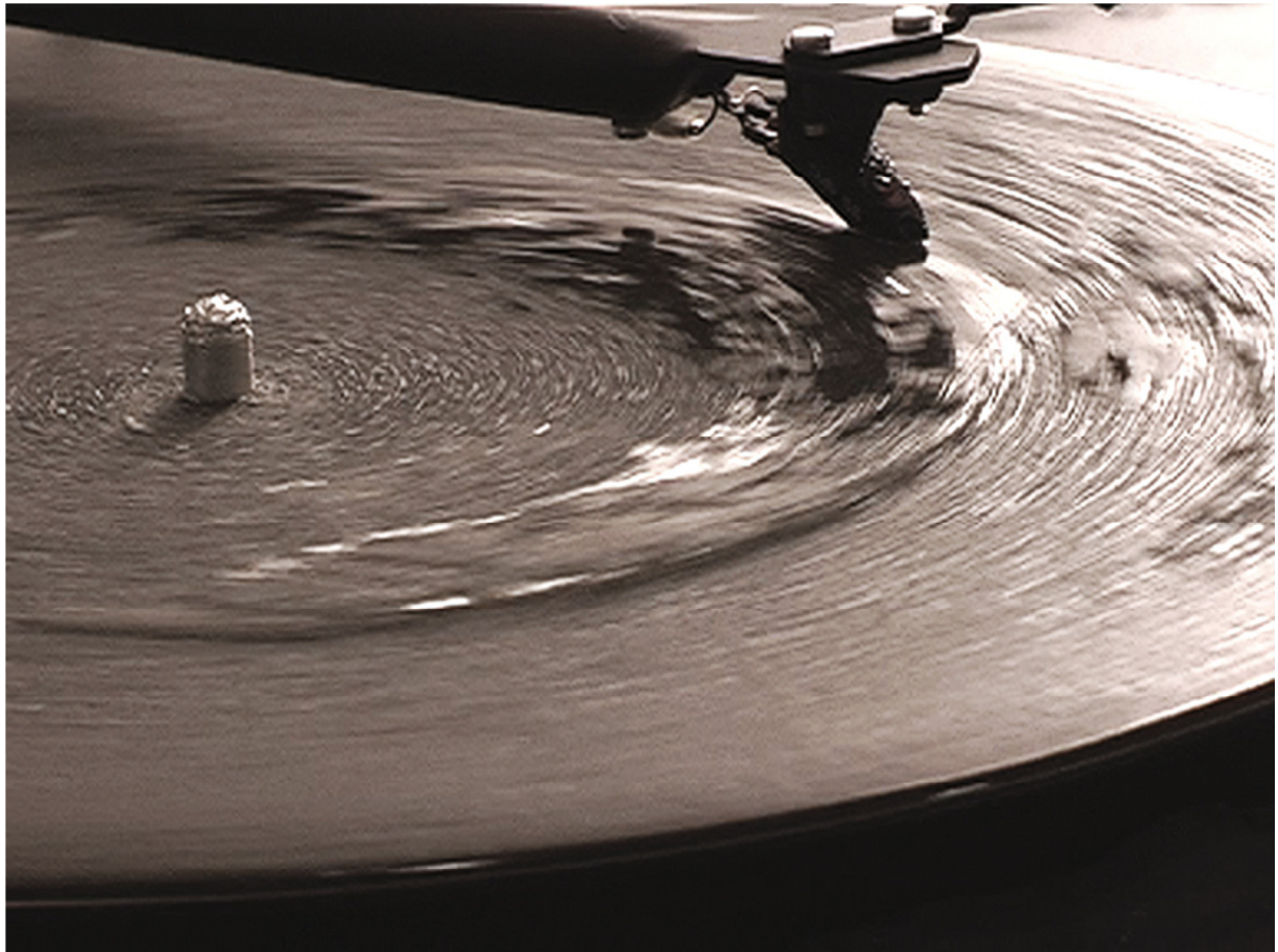
Figure 6 - Katie Paterson, Langjökull, Snæfellsjökull, Solheimajökull (2007)

completely melted away. The artwork is documentation of melting entropy in process which has instrumentalised its own decay to invoke a temporality forever lost. The materiality of the Anthropocene has again been reconfigured to become accessible to the viewer, albeit in a fragmented and precarious immediacy.