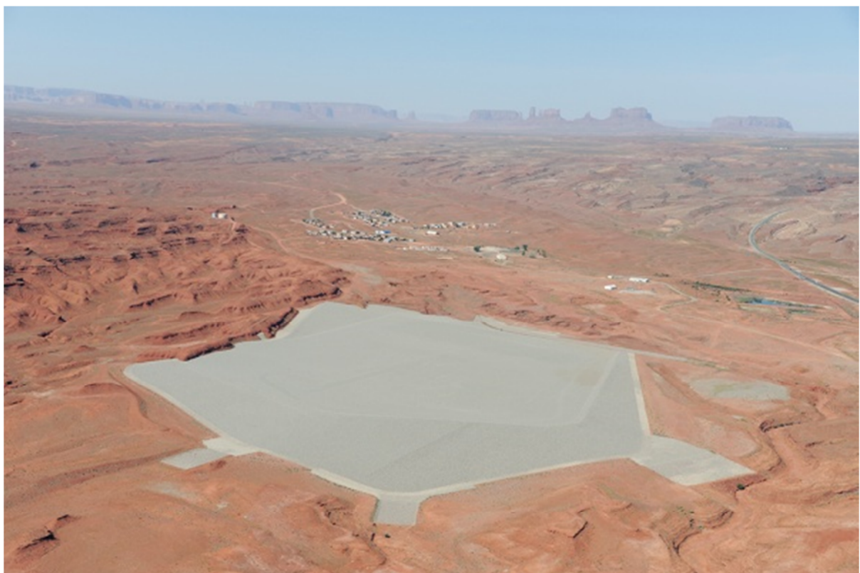
Figure 2 – CLUI Perpetual Architecture Archive (2012) Mexican Hat Disposal Cell, Utah

short), a purpose built underground facility in New Mexico for the storage of spent nuclear fuel and waste from the U.S. nuclear weapons industry. The first and only permanent deep geological waste dump, this facility is designed to house radioactive matter securely, forever. However, while some of the material stored here will remain at lethal levels in excess of 200,000 years, it is only the first 10,000 years that is of direct concern to the architects of the project. It is in this timeframe, modest in geological terms, where the builders must account for the possibility of human intrusion into this lethal environment. This requires some type of warning that must be put in place, a warning that must last for 10,000 years.