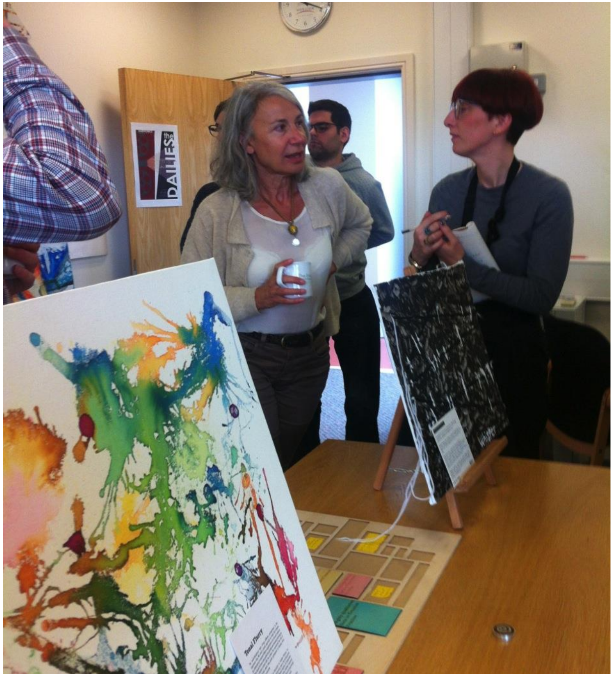
Figure 3. Discussion amongst work 'in the making', Moray, March 2016

The second set of Dailies were held in July and included representation from the PGT and PGR student cohort. As well as members of the research cohort of PhD and MRES candidates, MDES students gave presentations about their group projects, which began in January 2015. A representative from the programme discussed her team's project, Bike Hub, sparking wide interest from the audience. Bike Hub proposes the creation of a series of shelters throughout Barra. Young people would be encouraged to take ownership of the Bike Hubs and decide what they are used for. Inspired by interviews with young people and Barra Youth Café, the suggestion from the MDES students is that they could become maker spaces or meeting places. The team of three was given the theme of environmental design and the topic of health and wellbeing during Winter School. During their research the group decided to focus on Barra and became interested in how wellbeing was linked to creativity and having a good relationship with place and landscape. Field research