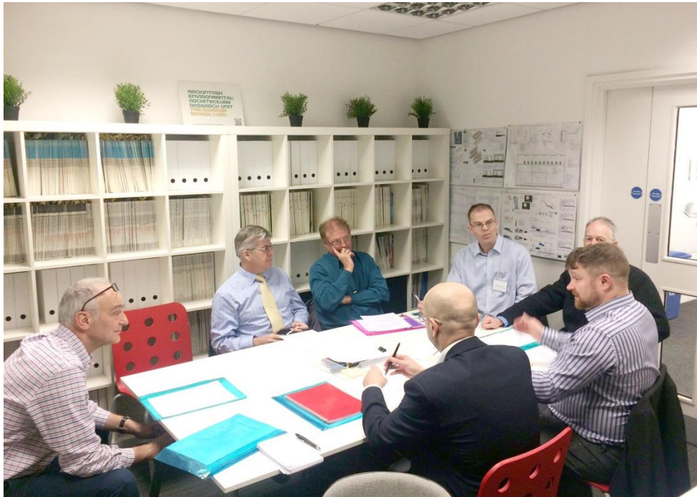
Session participants: Guidance for design and construction professionals