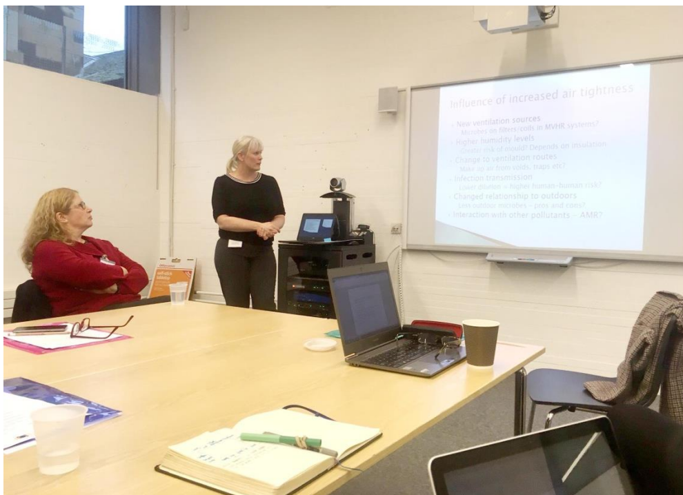
Session chair presentation: Microorganisms in homes