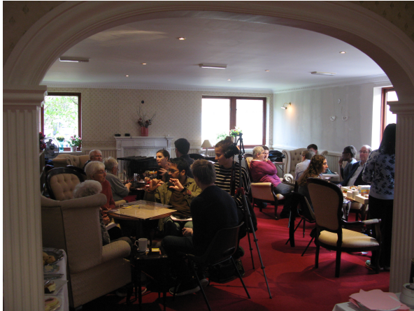
Figure 3. Dioramas interaction in sheltered housing lounge.