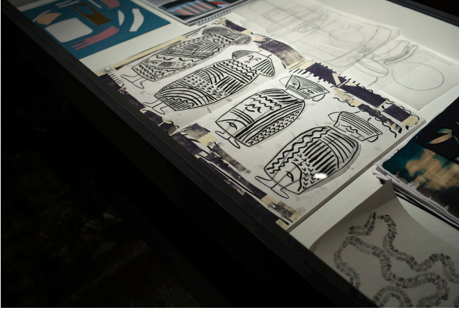
Figure 6. Sketchbook and drawings by Alice Dansey-Wright.