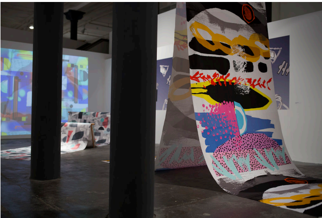
Figure 5. Projection, wallpapers and fabrics by (from left to right) Vanessa Hindshaw, Chloe Highmore and Lorna Brown.

Another part of the exhibition provided insight into the textile design process. This included a stop-frame animation, projected onto a large wall space, to take the viewer through some of the stages of design creation. Working drawings and open sketchbooks were displayed in a case showing the supporting work behind some of the designs created for the exhibition. Graphic illustrations and object layouts by Alice Dansey-Wright (figure 6) highlighted the importance of drawing to design creation, in this instance for the production of wallpaper, running horizontally, combining tribal markings and expressive silhouettes. Also on display was a selection of smaller samples as a retrospective to Collect Scotland's portfolio of commercial designs, previously presented at Première Vision Designs , Paris. With a diverse client list including Nike , Whistles , IKEA , Converse and Paperchase , the wall of samples communicated the visual diversity of the collectives' work (figure 7). In conjunction with the exhibition a series of workshops and talks engaged participants of all ages in design creation, trend prediction and digital printing.