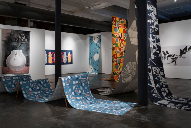
Figure 1. SAMPLE by Collect Scotland Exhibition, The Lighthouse, Glasgow.