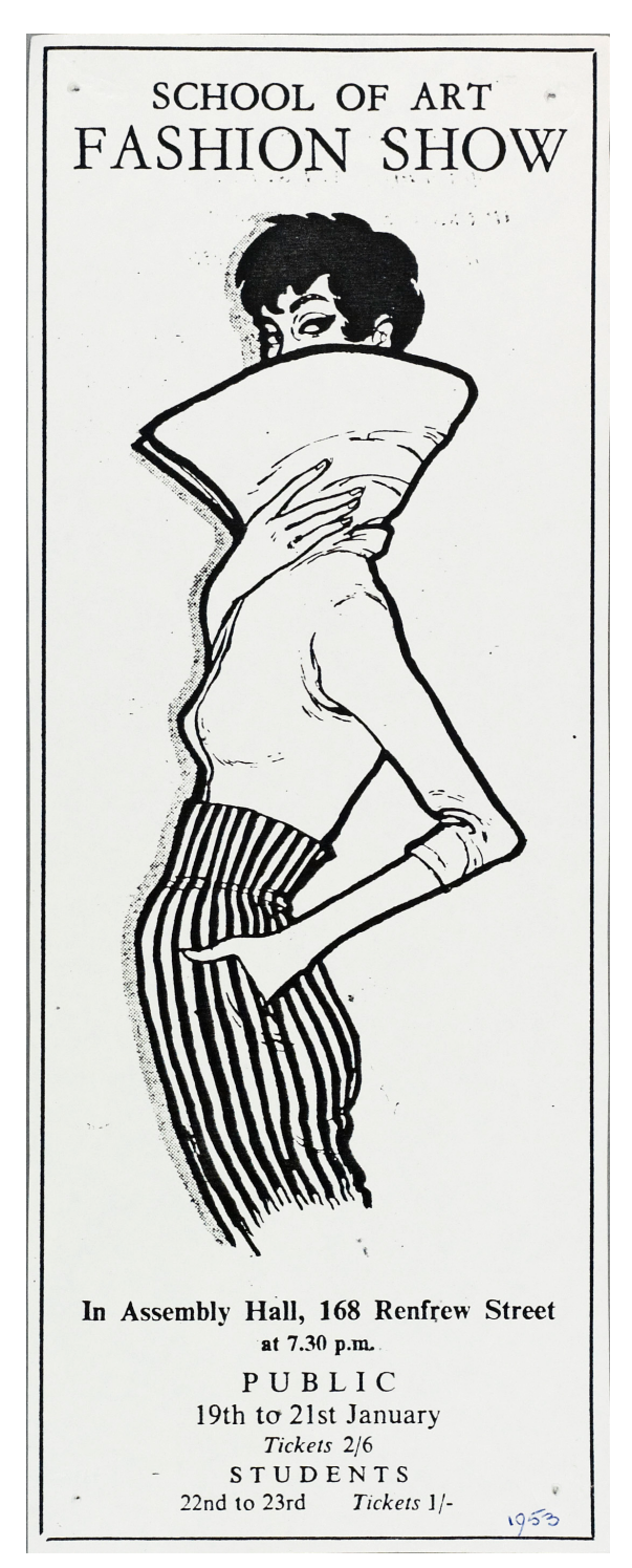
Image: GSA Fashion Show Flyer, 1953

Special thanks go to those who responded to the GSA fashion show call for items and information. Particulalry to those who have lent and donated material. If you have any information or items please contact archives@gsa.ac.uk