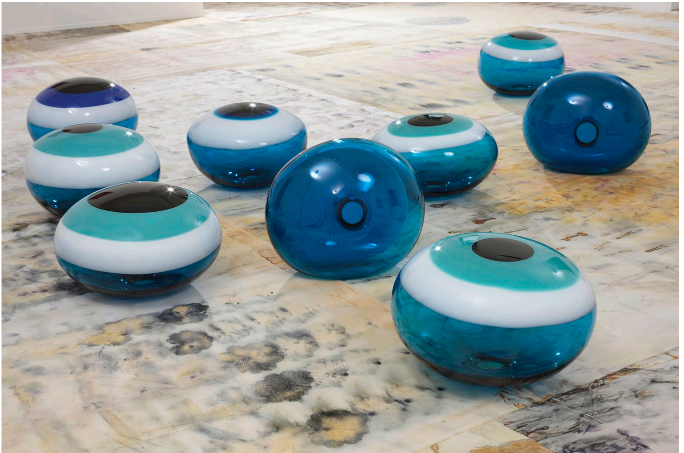
Laura Aldridge Signals and get wet , 2016 glass K_A_ALDR_034