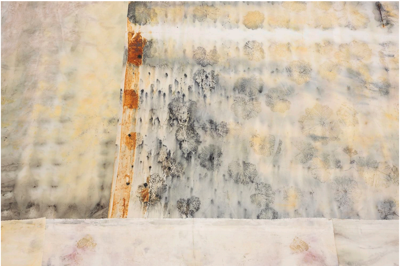
Laura Aldridge Display Scape #5: Drop. Cloth (Remove your shoes and collapse your metonymic impulse, replace it with a refreshed sense of how we relate to the things around us), 2016 plants, nails, fabric, copper, steel, hairpins and Meabh's keys dimensions variable K_A_ALDR_040