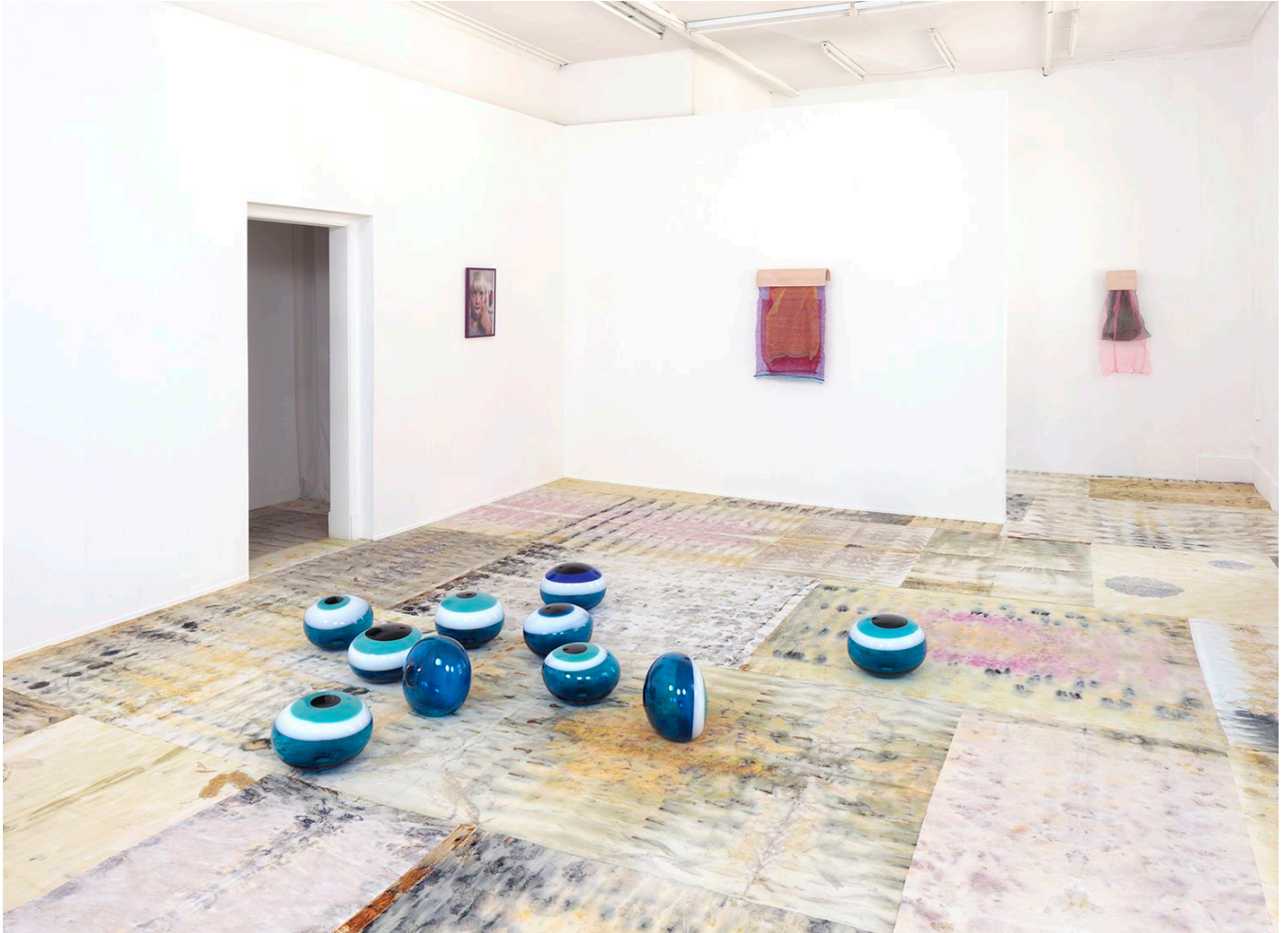
Installation View Inside all my activities, 2016 Koppe Astner, Glasgow