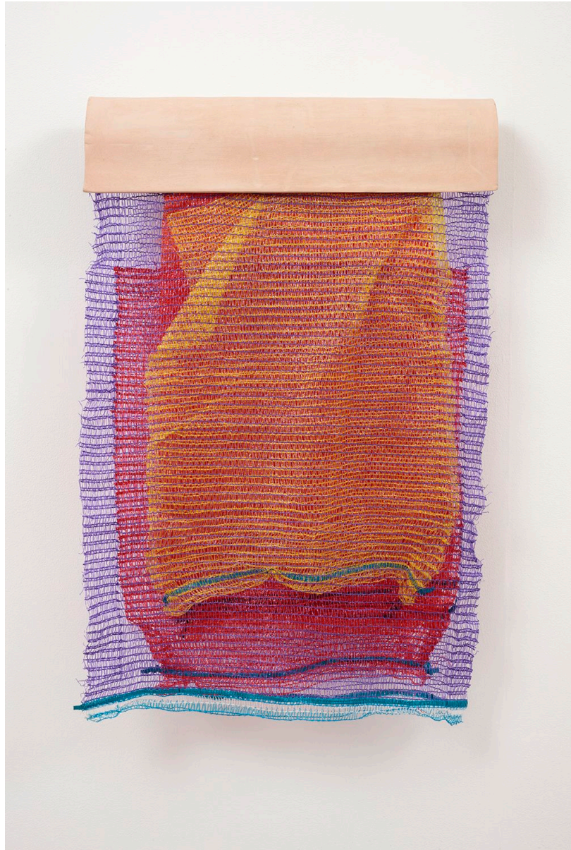
Laura Aldridge Things that soak you (vii) , 2016 ceramic, net, fabric 84.5 x 55.5 x 12.5 cm K_A_ALDR_037