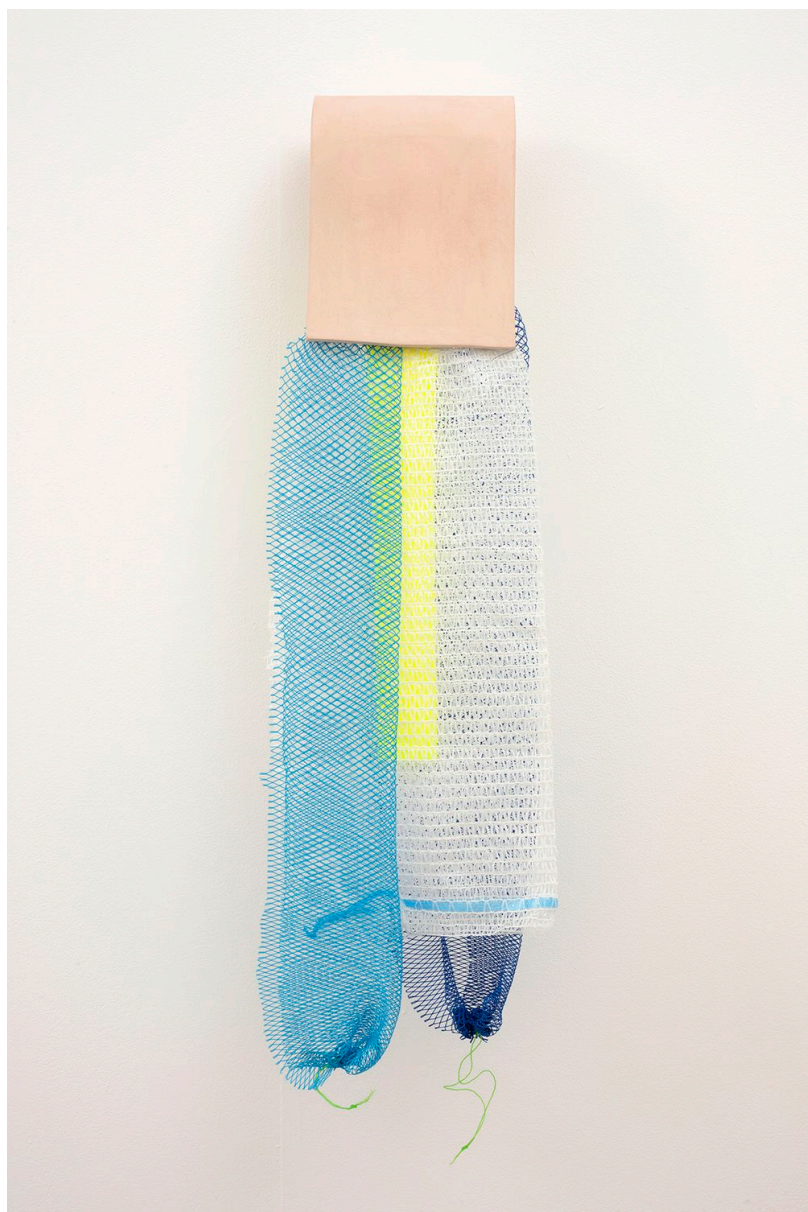
Laura Aldridge Things that soak you (ix) , 2016 ceramic, net, fabric 89 x 18 x 15 cm K_A_ALDR_039