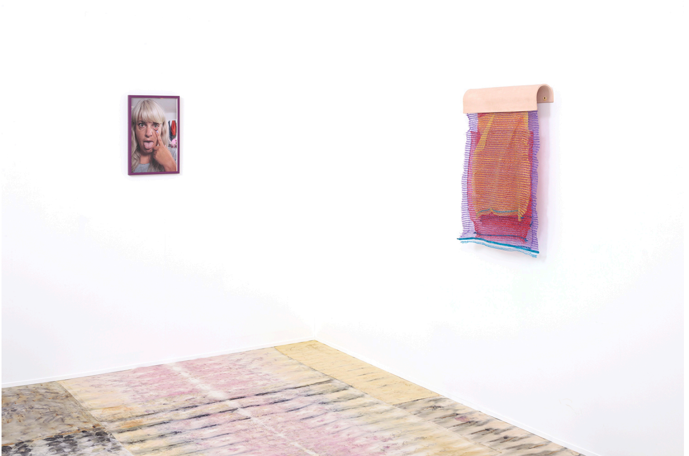
Installation View Inside all my activities, 2016 Koppe Astner, Glasgow