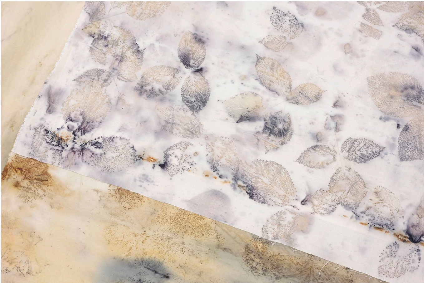
Laura Aldridge Display Scape #5: Drop. Cloth (Remove your shoes and collapse your metonymic impulse, replace it with a refreshed sense of how we relate to the things around us), 2016 plants, nails, fabric, copper, steel, hairpins and Meabh's keys dimensions variable K_A_ALDR_040