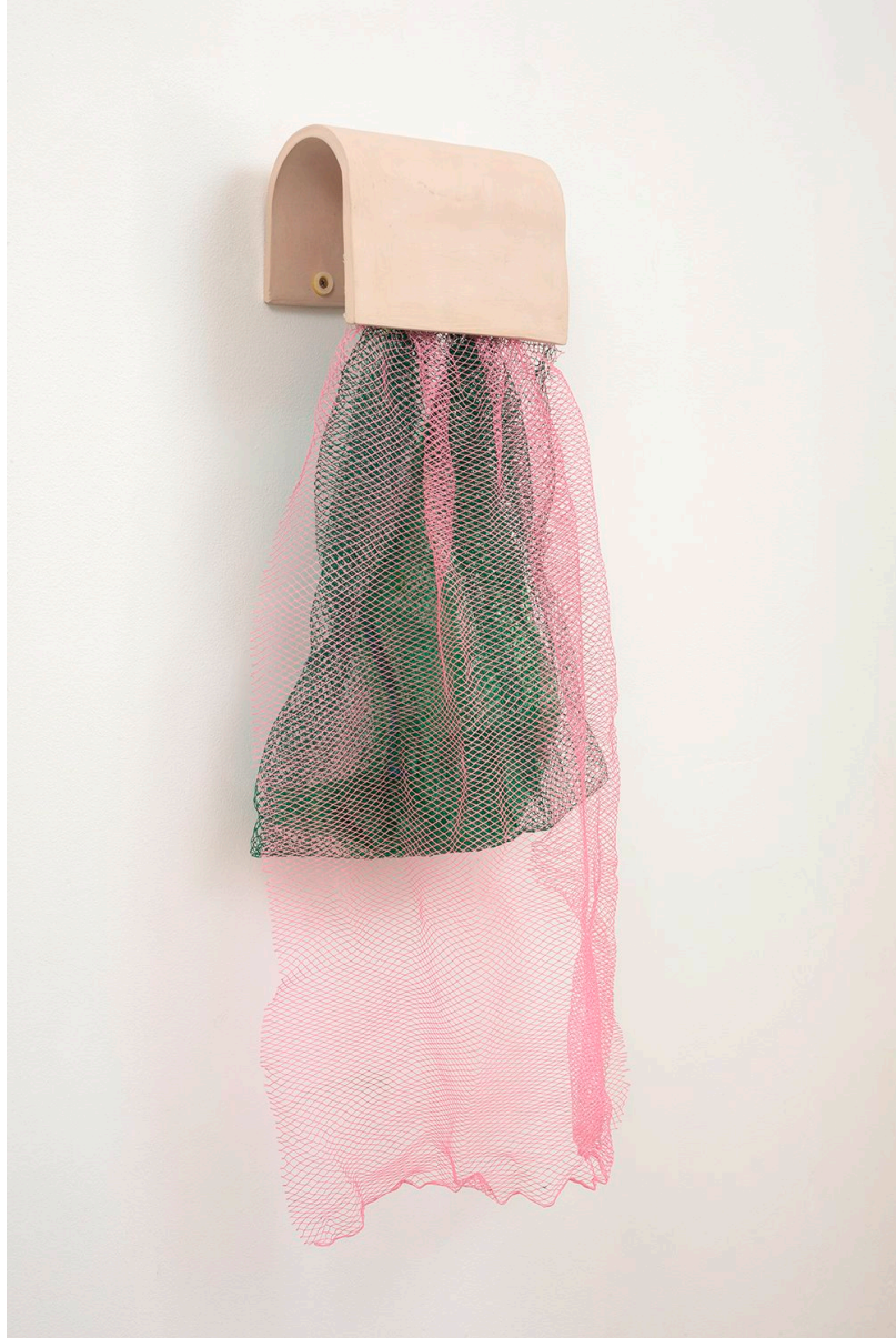
Laura Aldridge Things that soak you (viii) , 2016 ceramic, net, fabric 92 x 24 x 13 cm K_A_ALDR_038