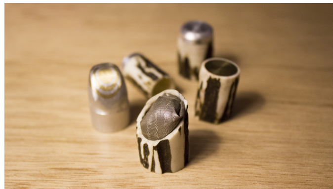
Figure 1. Sketch (a) above showing the design of the thimble consisting of two essential parts, a rigid cylindrical base, and a thin conductive fabric for the finger tip. Photo (b) below showing a number of thimbles resulting from exploring suitable materials, with the front thimble showing a rigid base made from antler combined with a grey conductive fabric tip.

as well as functional, design. For example, considering the potential for personalised touchscreen thimbles , not just for accurate sizing, but also for custom styling. An innovation through tradition design approach, which enables connecting new technology with familiar traditions (e.g. textiles) could be helpful in determining desirable aesthetics for the adoption of touchscreen thimbles .