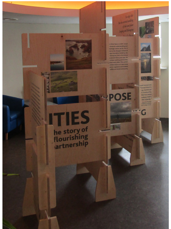
Final Exhibition: Enabling Capabilities panels