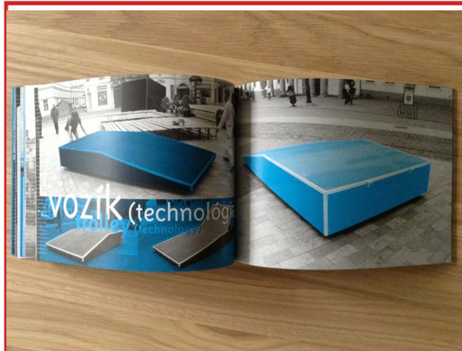
Images of Platform included in book alongside text describing the project