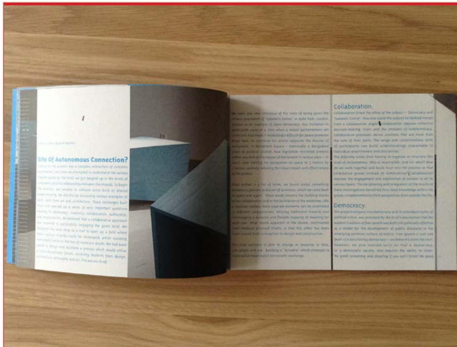
Key pages from the book reflecting on the project outcomes and method.

Vital Questions in relation to the prospect of a ‘Speakers Corner’ for Kosice: Is there a need? A problem? What is the need? How can it be addressed (audience/participation) Who is it for? Platform, monument, memorial? How can we avoid making a memorial? Space for action or space for reflection/thinking? Promoting social networks not expression most effective form democracy? Why Speakers Corner? Why not listeners Corner? Action Corner etc... And Why Corner? Why not Centre? Can it solve the problem? How do we spatialise social interaction?