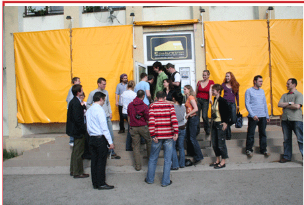
Image of project participants outside IC Culture Train, Kosice.

http://www.kosice2013.sk/en/platform-will-bring-art-and-inhabitants-of-kosice-closer