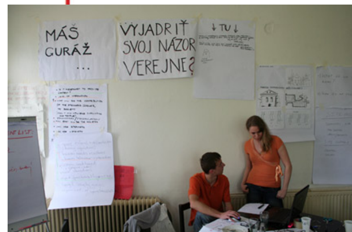
Image of the workshop space and two participants in discussion