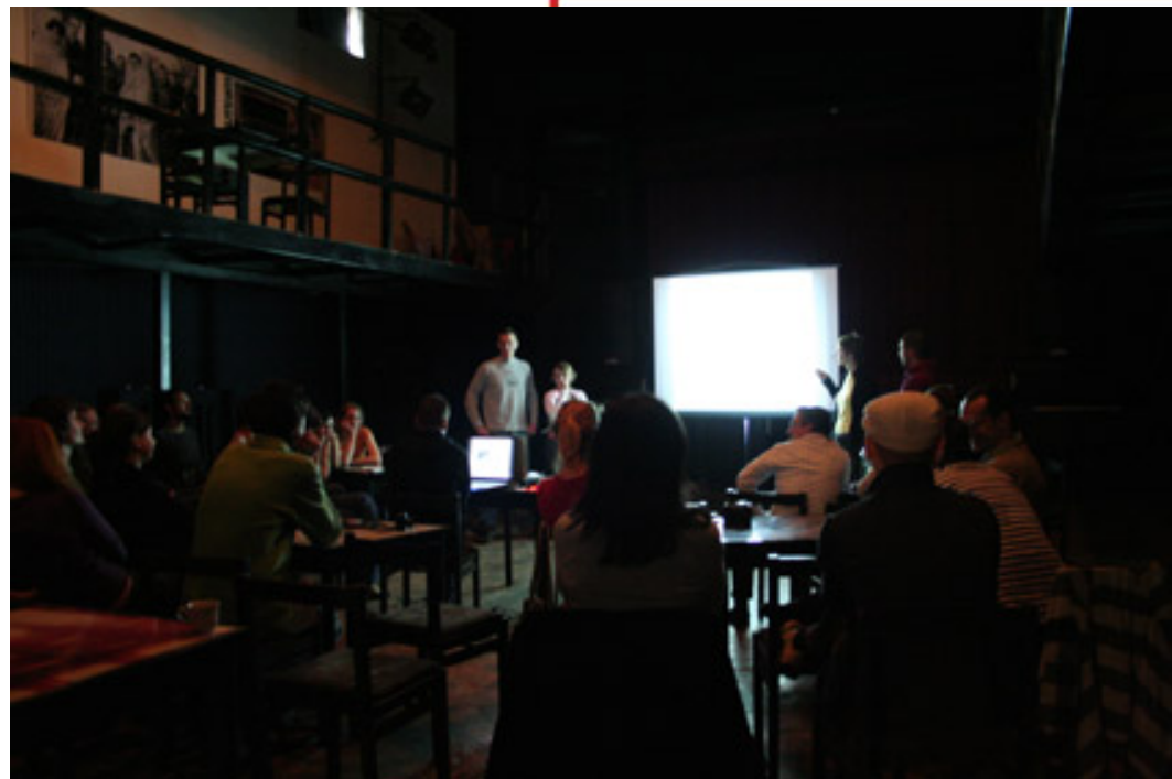
Image of presentations being shared at IC Culture Train, Kosice, Slovakia.

The book contains a partial programme of events (up until May 2008) developed by IC Culture Train, using the Platform structure in one way or other to engage the public. (pp.66-73) This programme of use is ongoing.