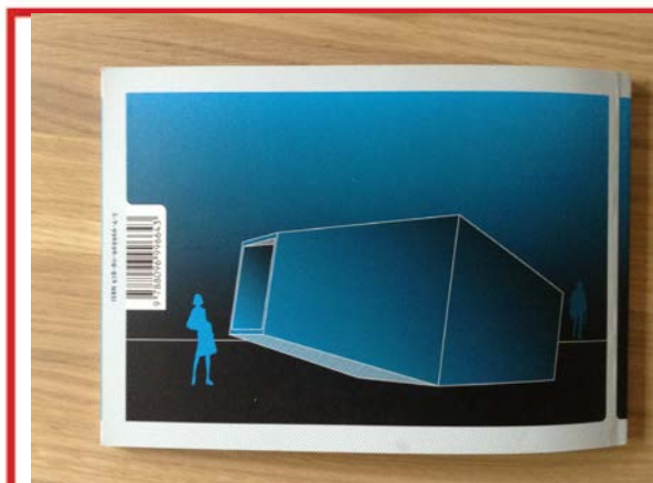
Image of back cover of book including rendering of Platform using CAD