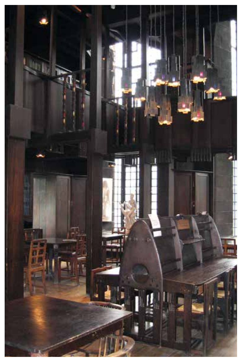
Interior of the library before the devastation.

• Follow the GSA Library and Archives at @GSALibrary