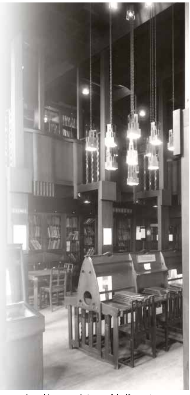
From the archives: an early image of the library

The School's librarians have now completed the sobering task of identifying the volumes that were lost in the fire, and of updating the online catalogue and some external union catalogues such as ESTC. The data in other catalogues such as Suncat and Salser may take slightly longer to update, but this too is being worked on. The Main Library, which holds the majority of lending collections, is unaffected and operates as normal. The School's archives and collections are also, for the most part, safe, though they have suffered some water and smoke damage and