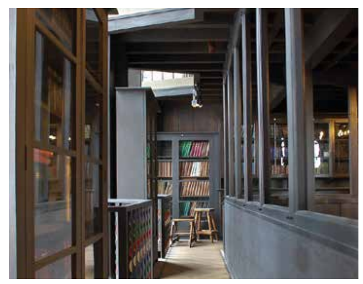
The lobby area holding further collections.