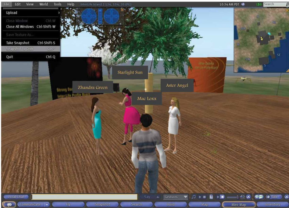
Figure 1. Screenshot of young people's avatars participating in an 'in-world' (i.e. in Inter-Life) discussion about a film that had been shown in one of the early Inter-Life workshops. Avatar names are pseudonyms (Minocha et al., 2010).

This peer mentoring and support between the young people was also observed in the workshops when new members joined the group and enabled young people to demonstrate what they had learned.