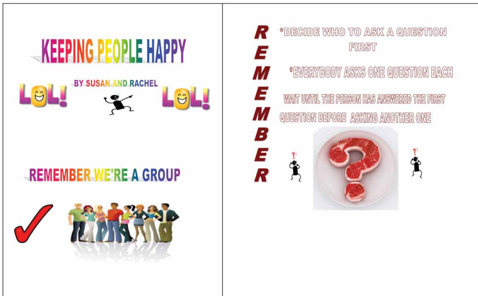
Figure 3. Inter-Life rules and regulations composed by the young people through collaboration to illustrate part of an active problem-solving activity (Names on slide are pseudonyms).

Furthermore, this young person recognised changes in peer learning over time, which also relates to the formation of a learning community or Community of Practice (Wenger, 1998). Other evidence from the questionnaire returns indicated that the young people had learned how to work together, support others and make friends as a result of participating in Inter-Life.