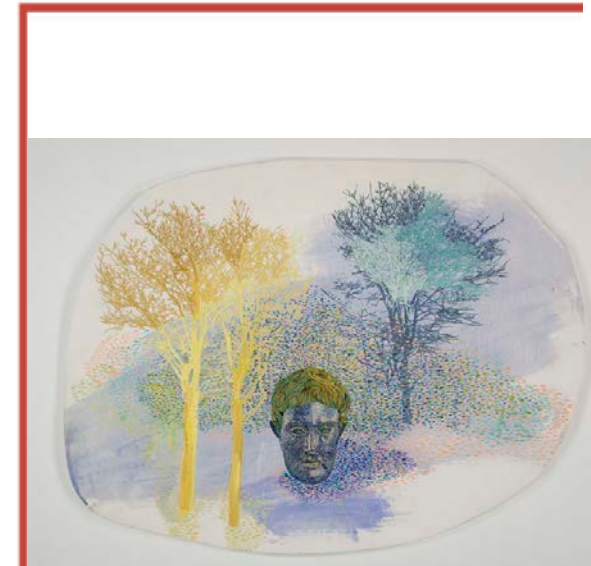
«Bronze Head (Simon)» H.Visnes 2012

The title «The Pointillist Sculpture Park» is a physically impossible proposition, which aims to both conjure certain mental images as well as underpin the paintings that physically contain this proposition.