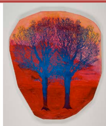
«The Sun Is Closing Its Eye» H.Visnes 12