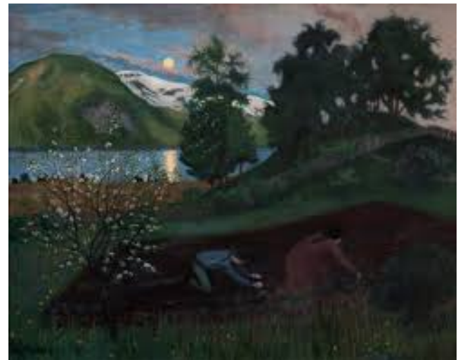
Left: Nikolai Astrup, «St Hans bål» («Summer Solstice Bonfire»), date unknown. Right: Nikolai Astrup, «Vårnatt i haven» («Spring night in the garden», 1909