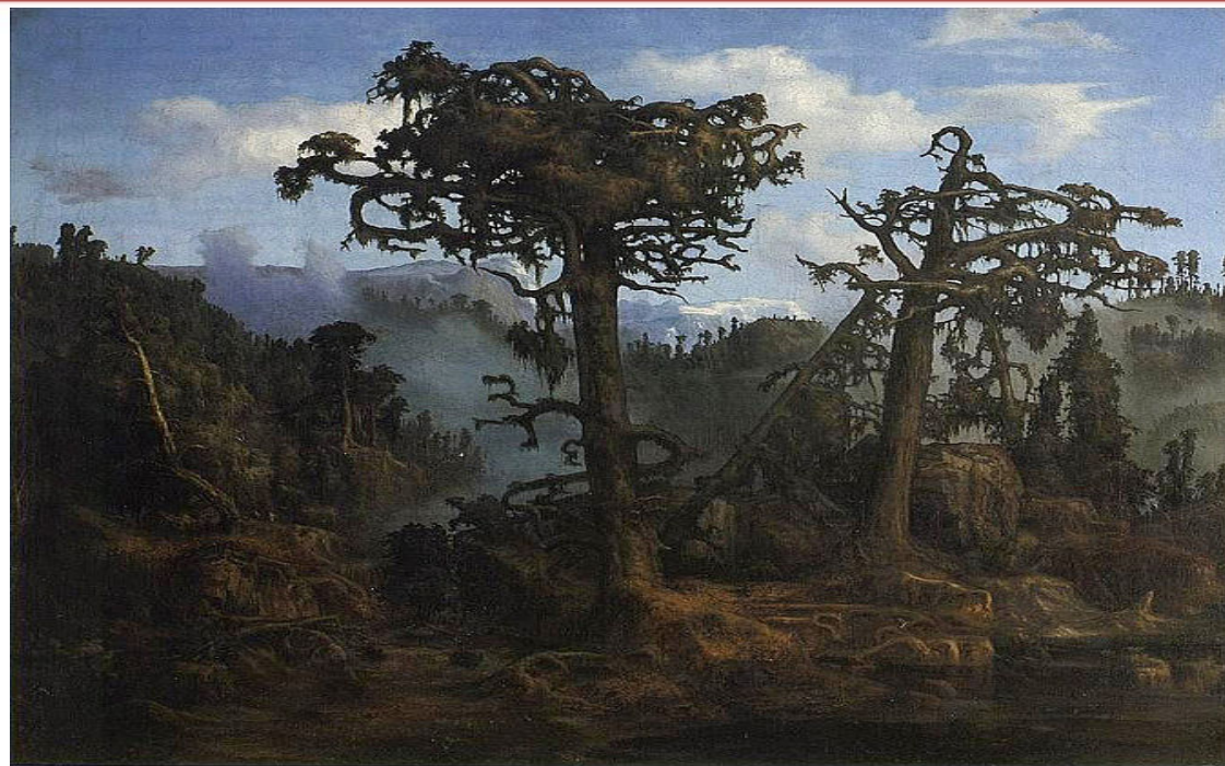
Lars Hertervig, «Gammel Furu» («Old Pine»), 1865