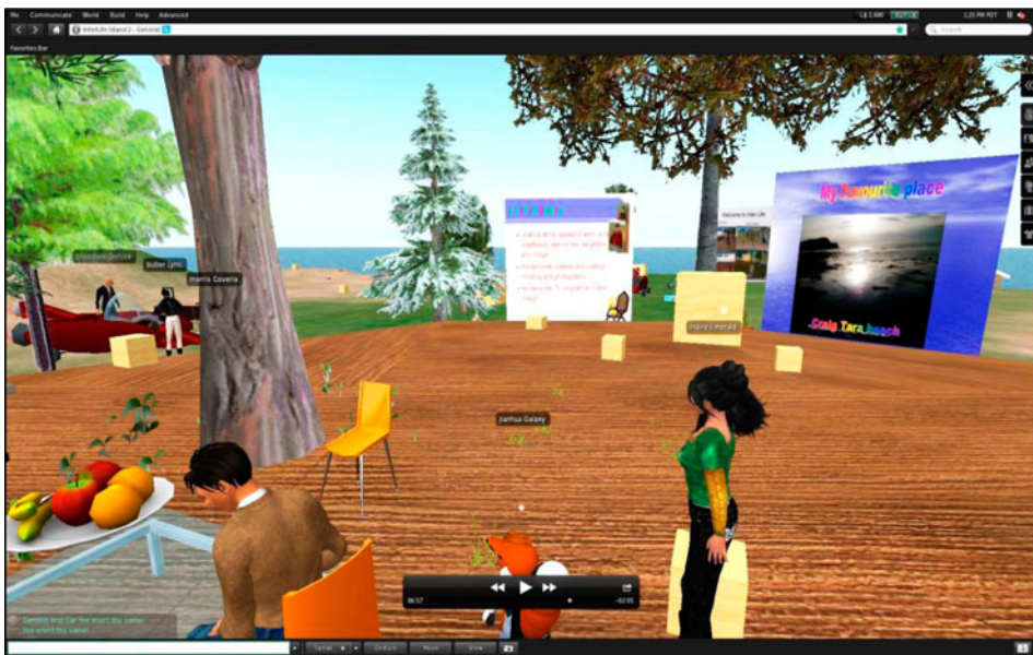
Figure 1. The central deck/stage area on IL12, with tables, chairs, interactive boards, trees and a car. The coastline can be seen in the distance.