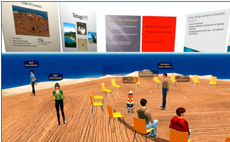
Figure 2. The meeting space on the beach in ILI2, with interactive boards.

have implications for education (Freitas and Liarokapis 2011) because they allow powerful social and educative experiences for participants. Game-based approaches to virtual worlds may require much more technical support and development, and are less flexible for educators, than the more opened-ended virtual world that was used by Inter-Life. To summarise, open-ended virtual worlds (of the type featured in this paper) are ‘persistent social spaces that provide players or participants with the ability to engage in long term, coordinated conjoined action’ (Thomas and Brown 2009, 37). Inter-Life created a highly visual and engaging online game environment where the participants make up the rules, design the game and customise the gaming environment.