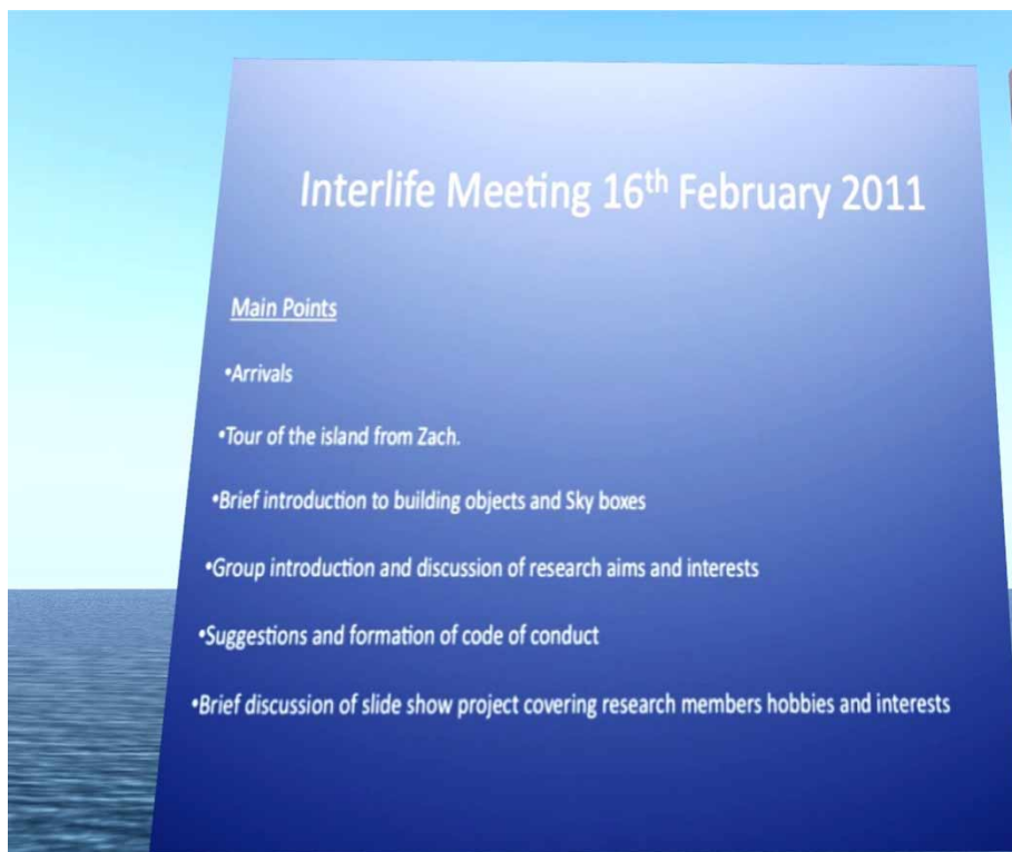
Figure 1. The agenda for an early planning meeting on an interactive board in the 'Beach' gathering arena, prior to the commencement of the workshops.

Vectoscope and Ralph Navarita. In this first 'formal' meeting of the group, three of the major themes that would come to dominate the space surfaced very quickly. The early part of the conversation was mainly concerned with introductions, making arrangements for the workshop series and deciding exactly what to do. The tutor team had agreed some initial 'ground rules' in a previous planning meeting, and these were used to stimulate a discussion about 'a code of conduct' for the group (see Figure 1 on one of the interactive boards situated in the gathering arena, with a list of main points from this meeting, including 'suggestions and formulation of code of conduct').