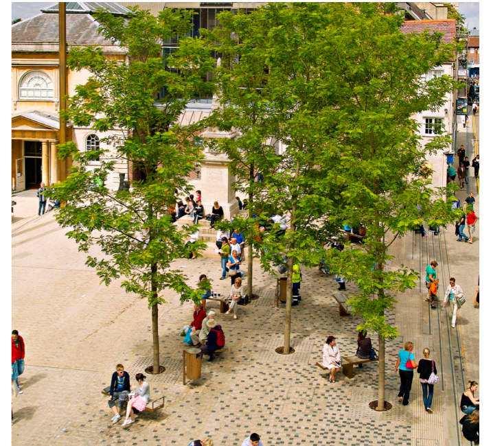
Before and after