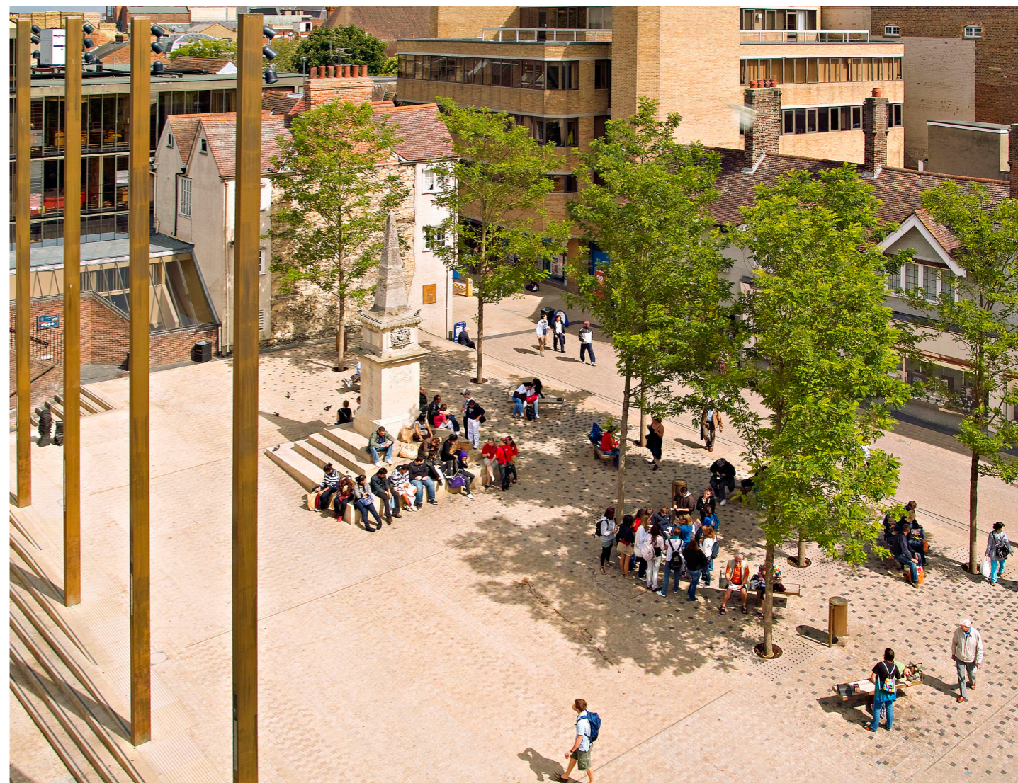
Grade II listed Tirah Memorial is retained in the centre of the Square.