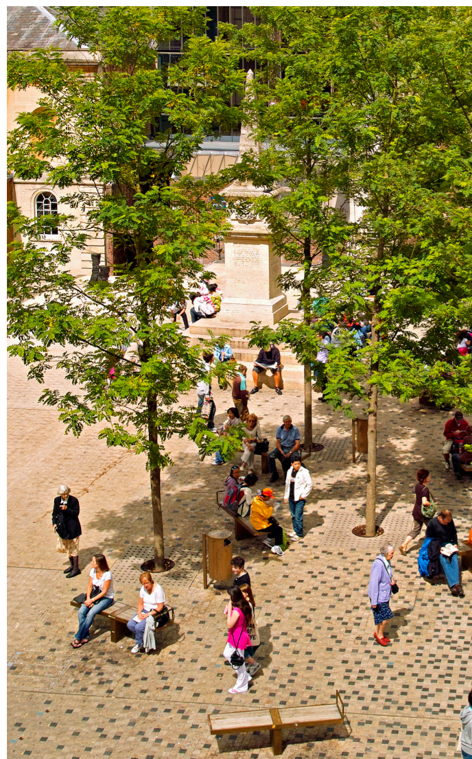
Phosphur bronze street furniture is loosely dispersed beneath a grove of trees.