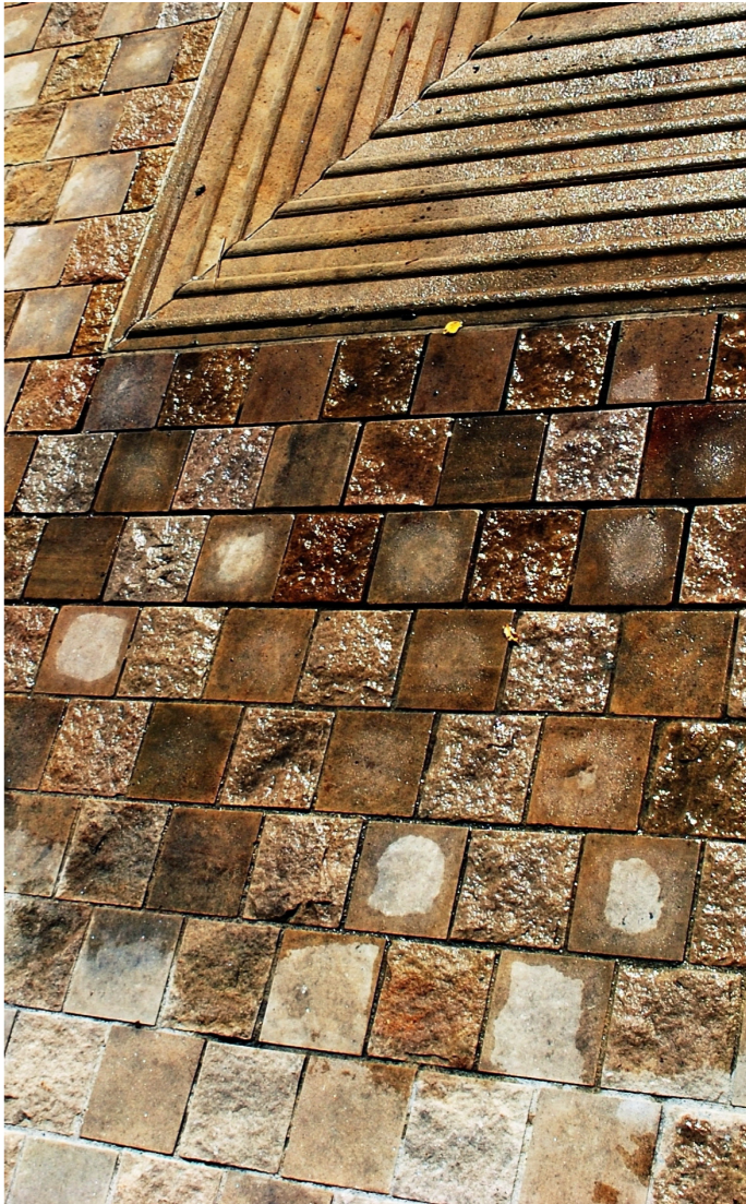
Sandstone is manipulated to fully accommodate all requirements of the surface, including safety markings for the visually impaired.