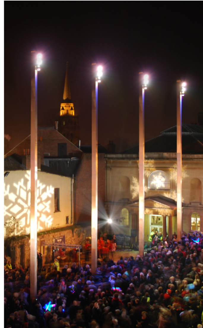
Oxford Festival of Light