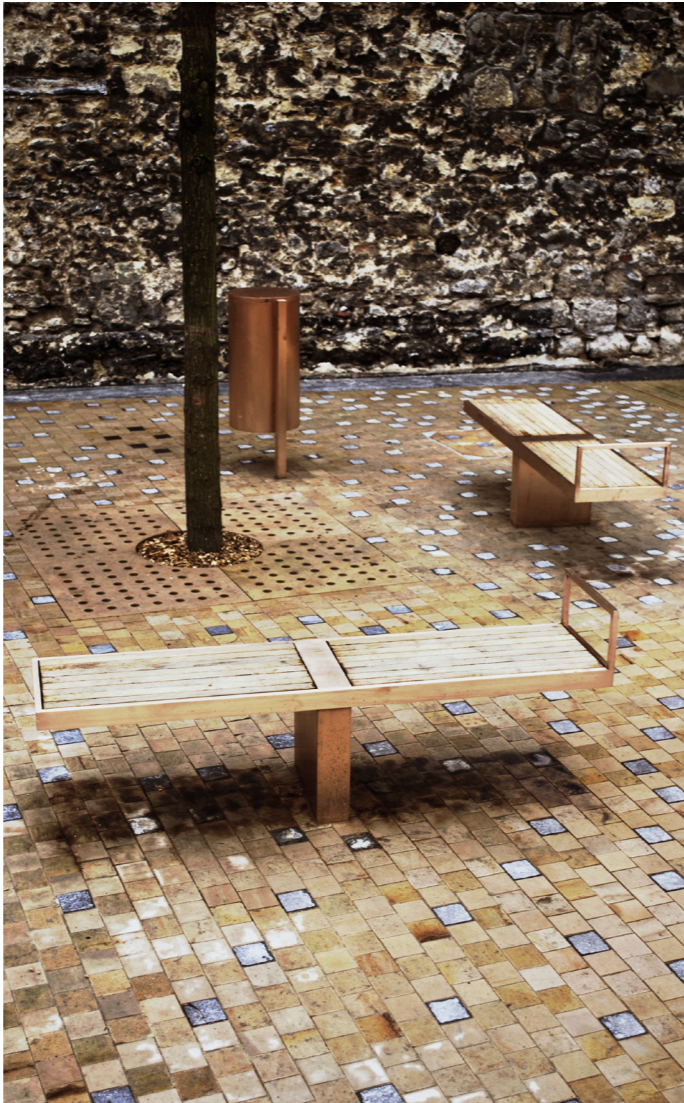
The phosphur bronze street furniture will patinate and stain the sandstone surface, demonstrating the passing of time.