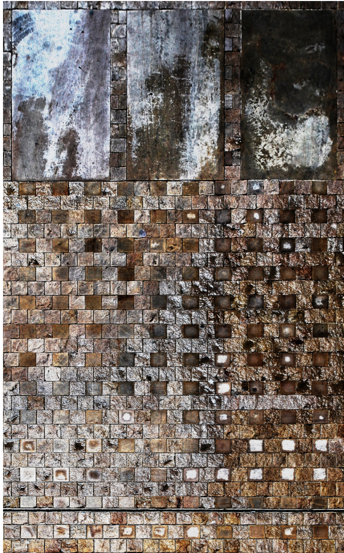
The sandstone surface glistens in the rain, heightening the effect of the surface variation.