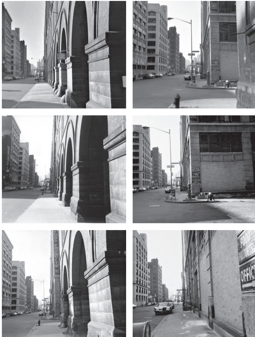
Vito Acconci, Blinks, Nov 23, 1969, afternoon. Photo-Piece, Greenwich Street, NYC. Kodak Instamatic 124, black & white film. Courtesy Vito Acconci ©