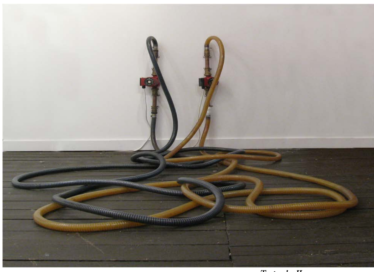
Tentacular II Neither/Nor, Liverpool Biennial 2010

The installation 'Tentacular II' follows a series of works that have dealt with the interconnectivity between painting practice and architectural space. The ideas embedded (or explored) within the work construct fluidity within the system, working in contrast to the perceived stasis of formal painting practices. The installation (at least this variant) consists of 30 meters of transparent tubing, Grunfos circulation pumps x2, water, food colourant and plumbing connections. 'Tentacular II' is the fifth variation of this form of installation .