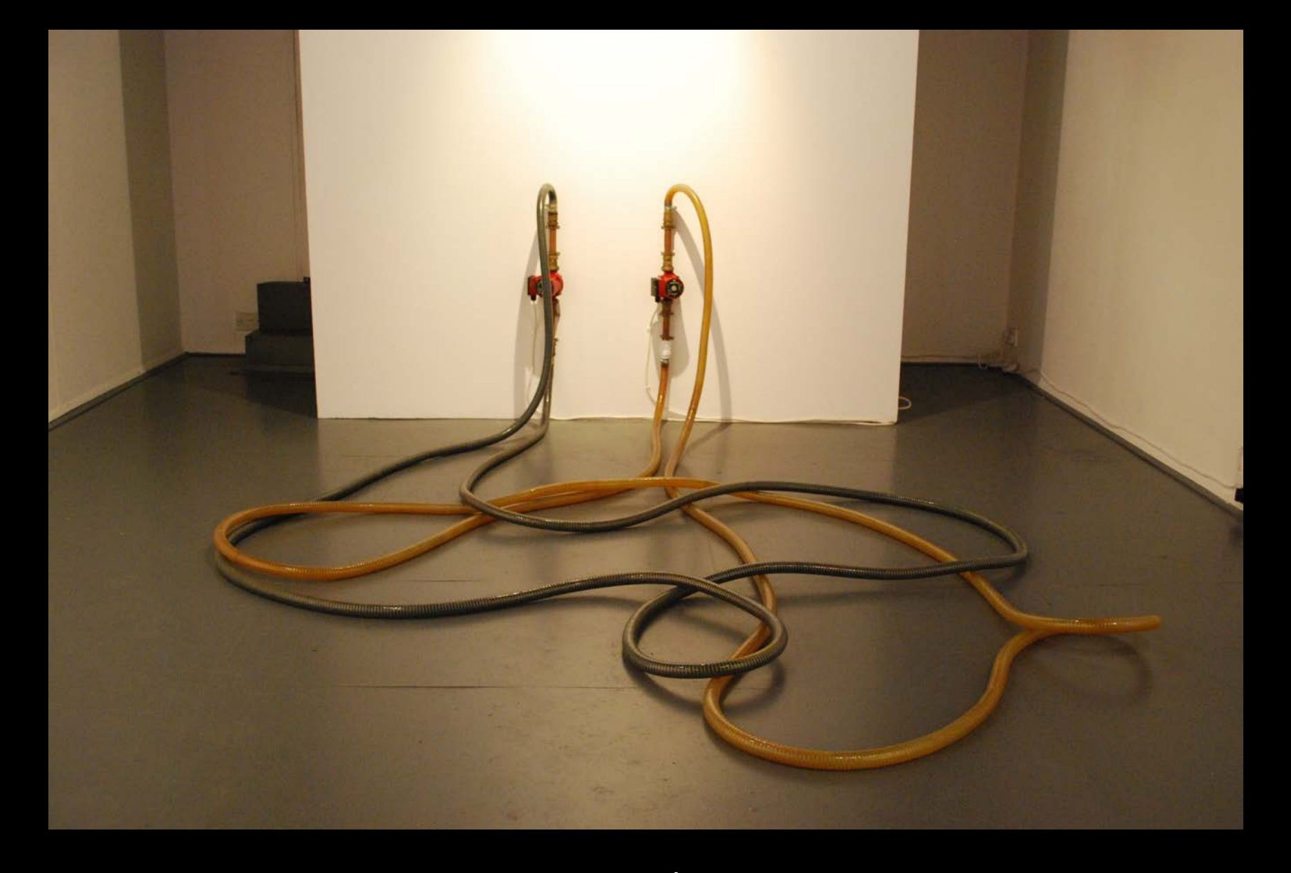
Tentacular EagleWorks Gallery, solo exhibition. 2010