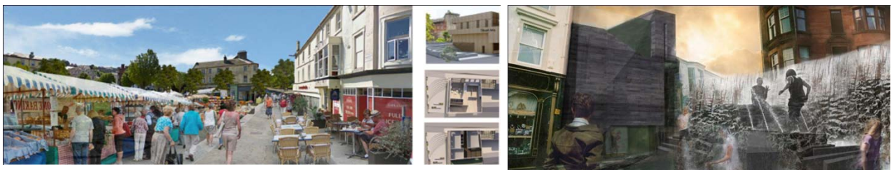
Figs. 15&16 New Public Space; O Kennelly & C Liggat 2010

The project demanded students to design a strategy for new growth and required to design a 'supra-market' and new external public space, and reflect on the town's past, its present and the possible future. The proposed facility transcends the notion of a farmers market - becoming a permanent venue for the current and nomadic monthly market, a public foothold for the Cook House and various other social facilities. It was also required to have a true sustainable agenda in terms of the local community, building again on the concepts of the Slow Food movement. The establishment of such a proposal would have the ambition to act as a catalyst to revive the town's centre and reverse the current trend of deterioration. Again, students used a variety of methods to explore and design proposals including initial desk top studies, video recording, sound studies and interviews with local people, physical models, 3d CAD models and visualisations. All modes of investigation individually revealed one aspect of the proposal yet collectively a holistic vision for the town and its people was communicated (figure 15&16).