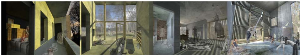
Fig. 1 Exploring atmosphere; N Mclachlan 2011

How can this ‘fast life style’ where everything appears to be instantly available; embrace the less tangible but crucial qualities that make architecture. Can one’s emotional response to proposed designed space; smell, touch and acoustics; be explored and developed alongside the visual? It would be foolish to imagine that removal of digital and electronic tools would either be possible or sensible; more appropriately, how can they help to facilitate explorations that will produce architectural proposals that have truly considered the experiential qualities, embracing these ‘fast’ mediums alongside a more craft driven approach (figure 1). Can architectural education utilize the possibilities of current technology and at the same time embrace the skills and patience that are essential in the production of an architecture that is not only visually explored but also sensually realised?