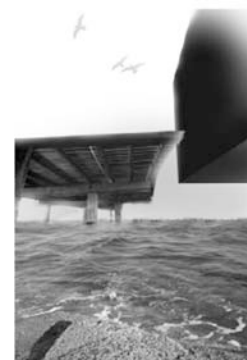
Figs. 2 & 3 Feeling the space; I Humphris & B Williams 2010