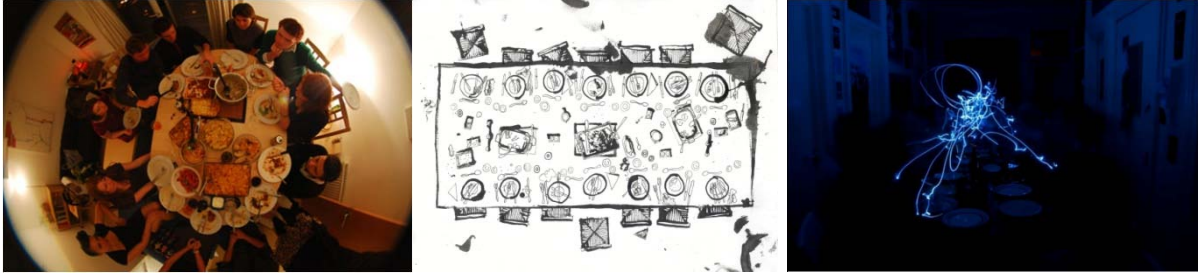
Fig. 12,13 & 14 Dining, exploring and analysing the 'feast'