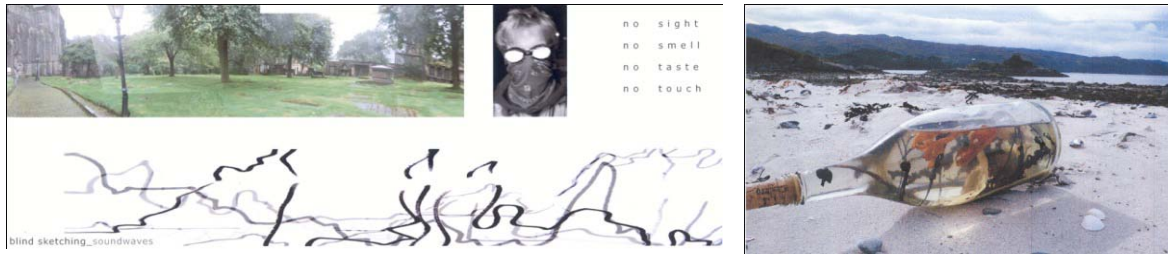
Fig 10 Blind drawing and a life aquatic J Barton 2009

together with a device to measure or register the selected sense. No cameras or other electronic equipment was permitted and the design of low tech devices was required. This first foray with the sensual produced a diverse range of experiments and results, from the daily range and depth of smells within a spice shop in Morocco, to the movement of air in a cow shed in Orkney and drawings of sounds within Glasgow's Kelvingrove museum (figure 10).