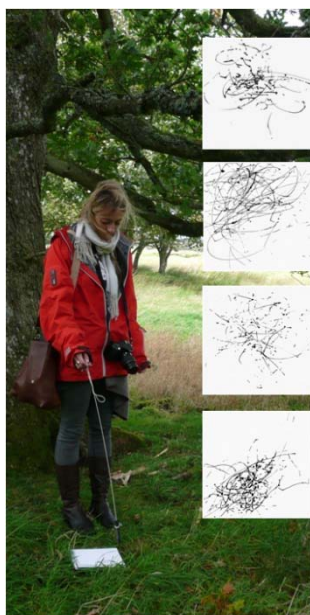
Fig 11 Exploring place

Careful selection of a site in order to support the ideas was important. Perth and Kinross was chosen, as it is Scotland's first, and currently only Cittaslow member. Perth has also adopted the Slow Food Charter. We sought a site with an historical resonance and real