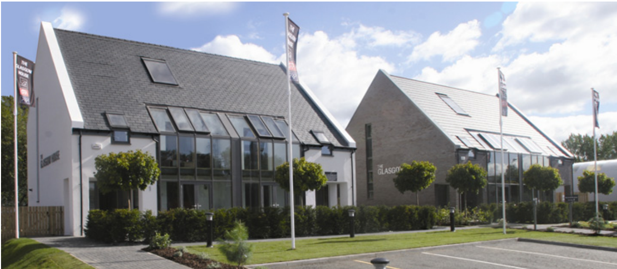
Fig. 1. The 'Glasgow House' Development with Sunspaces to Principal Elevation.

To achieve the project aims, PRP Architects utilised 2 varied construction methodologies with a rendered and insulated clay block structure used in Plot 1 (white building in Figure 1) and a more traditional insulated timber kit with brindle brick cladding in Plot 3 (grey/ blue building in Figure 1). These designs incorporated high thermal performance fabric (design U-value of 0.15\text{W/m}^2\text{K} ), high performance glazing ( 1.2\text{W/m}^2\text{K} ), good levels of airtightness ( 4\text{m}^3/\text{m}^2\text{h} ), mechanical ventilation with heat recovery (MVHR), high efficiency condensing gas boiler, solar water heating and integrated sunspaces. It should be noted that the orientation of these example buildings was set as a 'convenience' to existing site constraints and, therefore, not optimised for maximum gain for these sunspaces. This allowed testing of these spaces as a 'worst case' scenario orientation as could be experienced in future urban layouts.