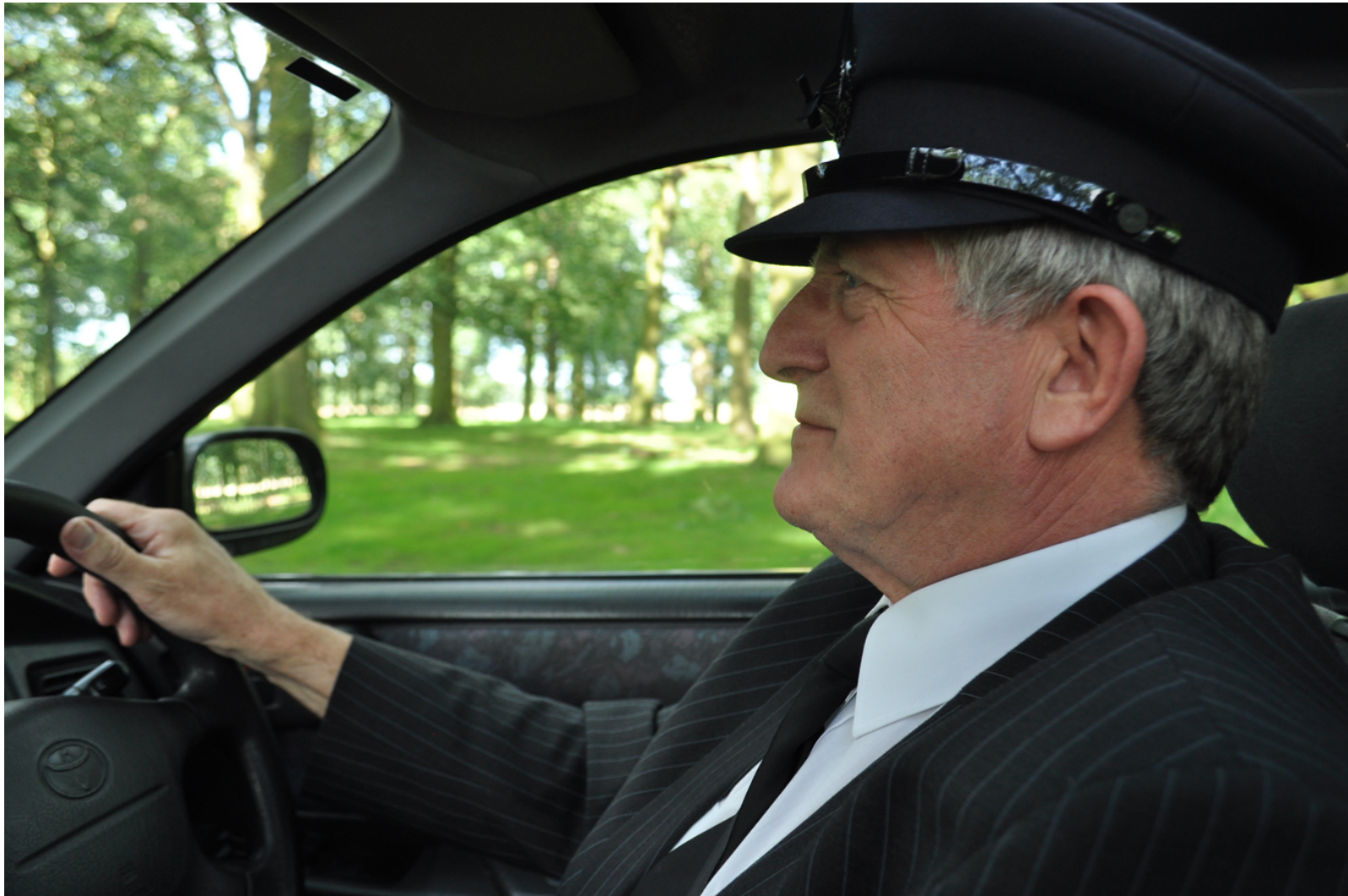
Image 4: Ghost , 2010. Detail of chauffeur. Intervention over the duration of the Tatton Park Biennial.