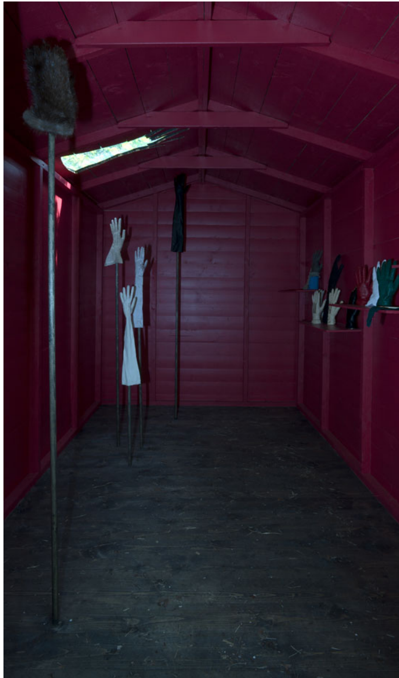
Image 6: Museum of Gloves , 2010. Found antique gloves, embroidered gloves with six fingers, scent, shed, cast rubber hand door handle.