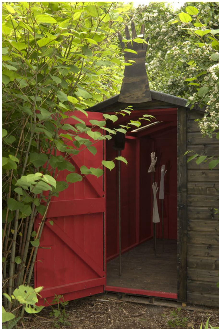
Image 5: Museum of Gloves , 2010. Found antique gloves, embroidered gloves with six fingers, scent, shed, cast rubber hand door handle.