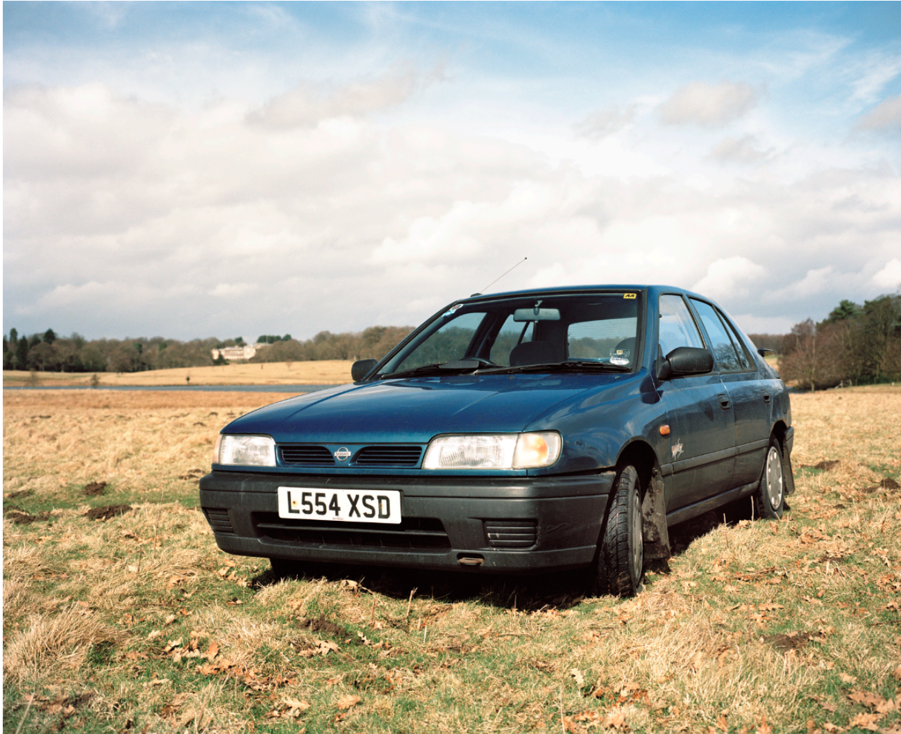
Image 3: Ghost , 2010. Intervention over the duration of the Tatton Park Biennial.

A re-branding of an old, unwanted mass produced car with the scent of a luxurious Rolls Royce offered as a chauffeur driven taxi service within Tatton Park Estate. The original car for the work was stolen 8 days prior to the opening. It was a 1994 Nissan Sunny, and was replaced with a Toyota Carina from the same period. The taxi service was offered via word of mouth, and also through scented business cards advertising Silver Cloud Taxis...the essence of Rolls Royce . Commissioned for Tatton Park Biennial May - Sept 2010