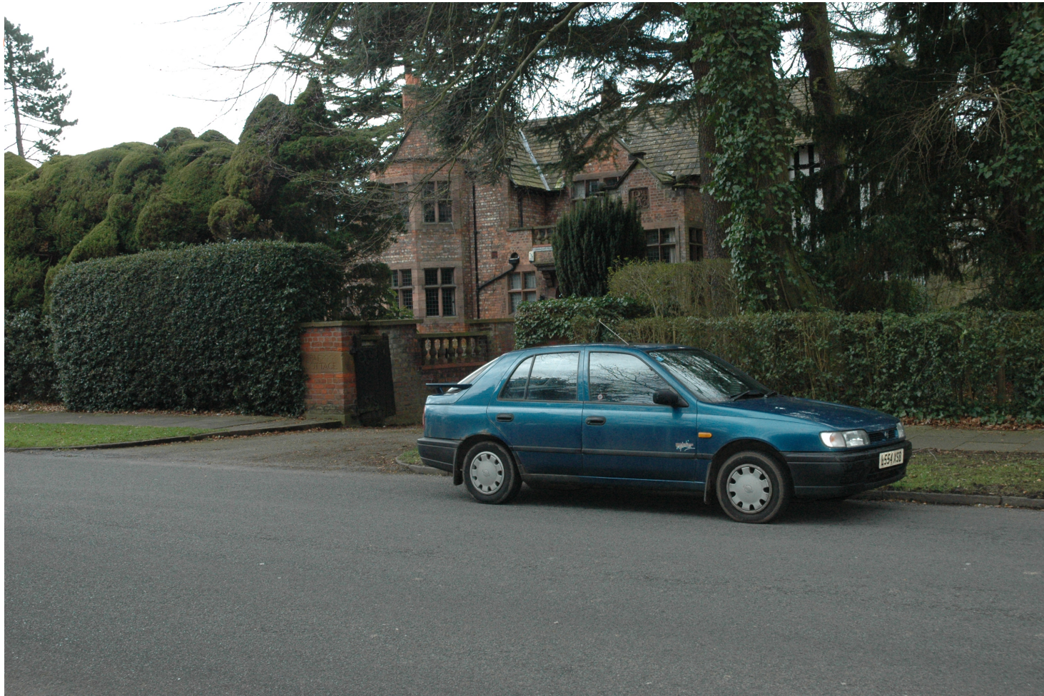
Image 17: Recce/research for the work: The Nissan parked outside the former home of the late Henry Royce, co-founder of Rolls Royce, Knutsford