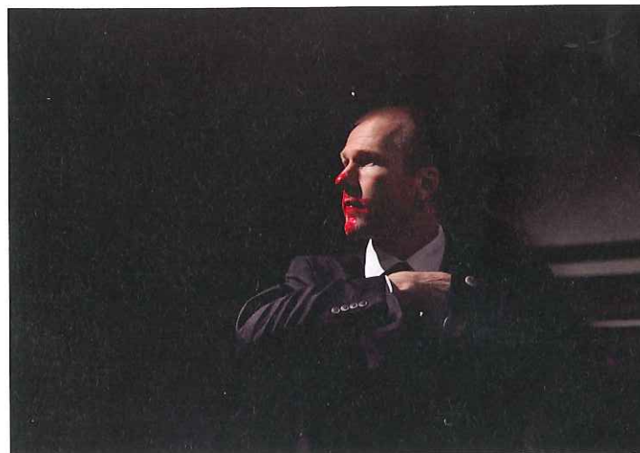
Paul Couillard, Beautiful Losers , 2009.