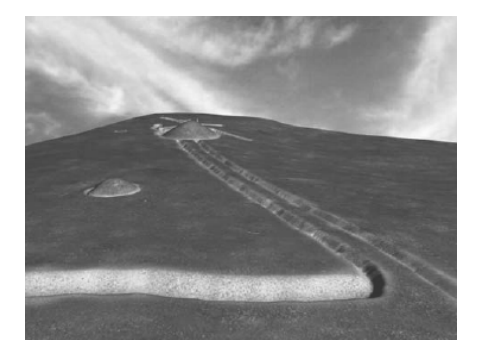
Figure 4. Detailed 3D model of site.

The Glauberg is one of the best researched places in German, geomagnetic surveys of more than 20 km2, field surveys, excavations and meta analysis (like archaeobotanics, astrophysics, GIS analyses, material analysis during restoration of finds etc.) revealed a great range of answers to many questions but also revealed new questions.