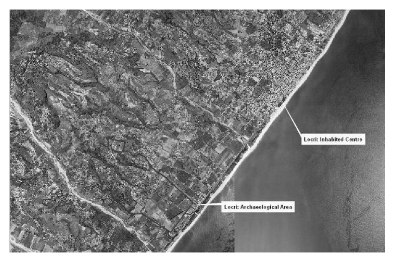
Figure 2. An aerial picture of the site of Locri.

The ease of access to the virtual journey will contribute to the spreading of the ancient culture of Magna Graecia at European level. In fact, among many Magna