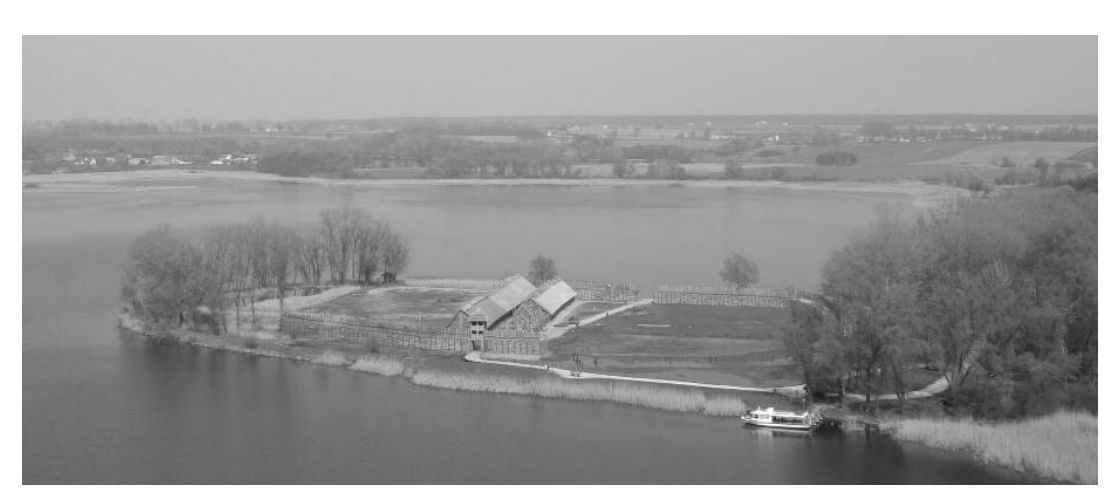
Figure 5. A view of the Biskupin site.

The Iron Age fortified settlement in Biskupin is the most famous settlement in Central Europe, belonged to the so-called Lusatian culture, which appeared on the huge territory of Europe in the Bronze Age and developed until the Early Iron Age. The settlement was placed on a peninsula of the Lake Biskupin, located in central part of Poland. The site is dated on the ground of dendrochronological analyses. Most of the wood constructions were built during one winter, in 738/737 BC and existed more than one hundred years. The settlement was surrounded with wood rampart with breakwaters. Inside, there were 13 rows of huts, together about 102–105 houses, which were situated along 11 streets. Biskupin had about 800–1,000 inhabitants. Biskupin was discovered in 1933 by Walenty Szwajcer, young teacher of local school, who saw, during an excursion with his pupils to the Lake, some stakes at the side of the lake.