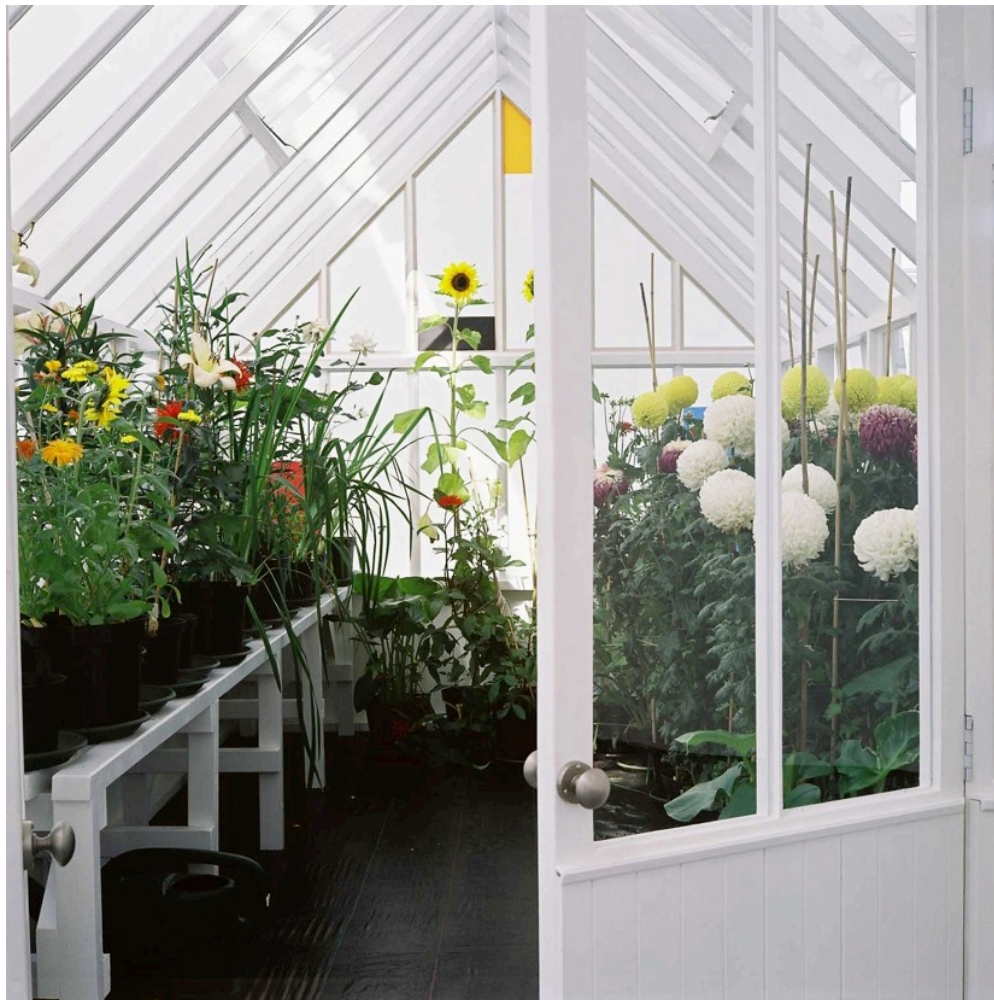
Exhibition view: 'Greenhouse'