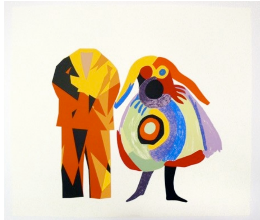
'Modern Lovers', 2009 Screenprint on Somerset White (300 gsm) paper, 49 x 56 cm, Edition of 20

Scottish Contemporary Editions at the London Original Print Fair 2011. Represented by Dundee Contemporary Arts.