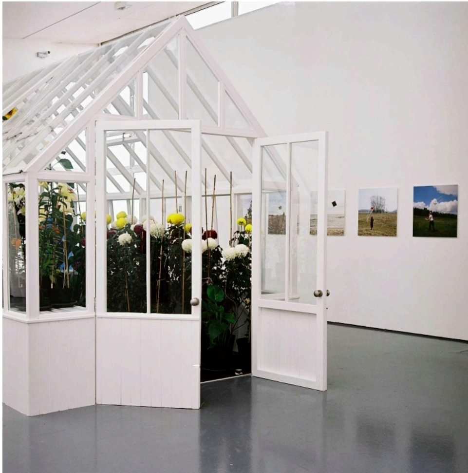
Exhibition view: 'Greenhouse' and Kite photographs