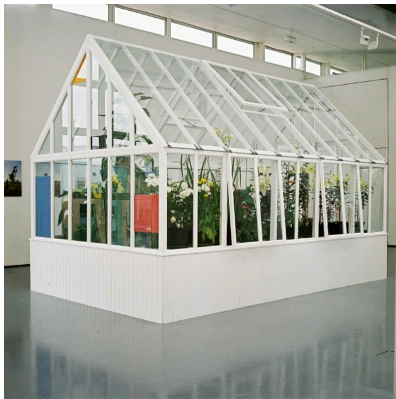
'Greenhouse', 2002, wood toughened glass, plants, tissue paper, 299.5 x 262.5 x 431 cm