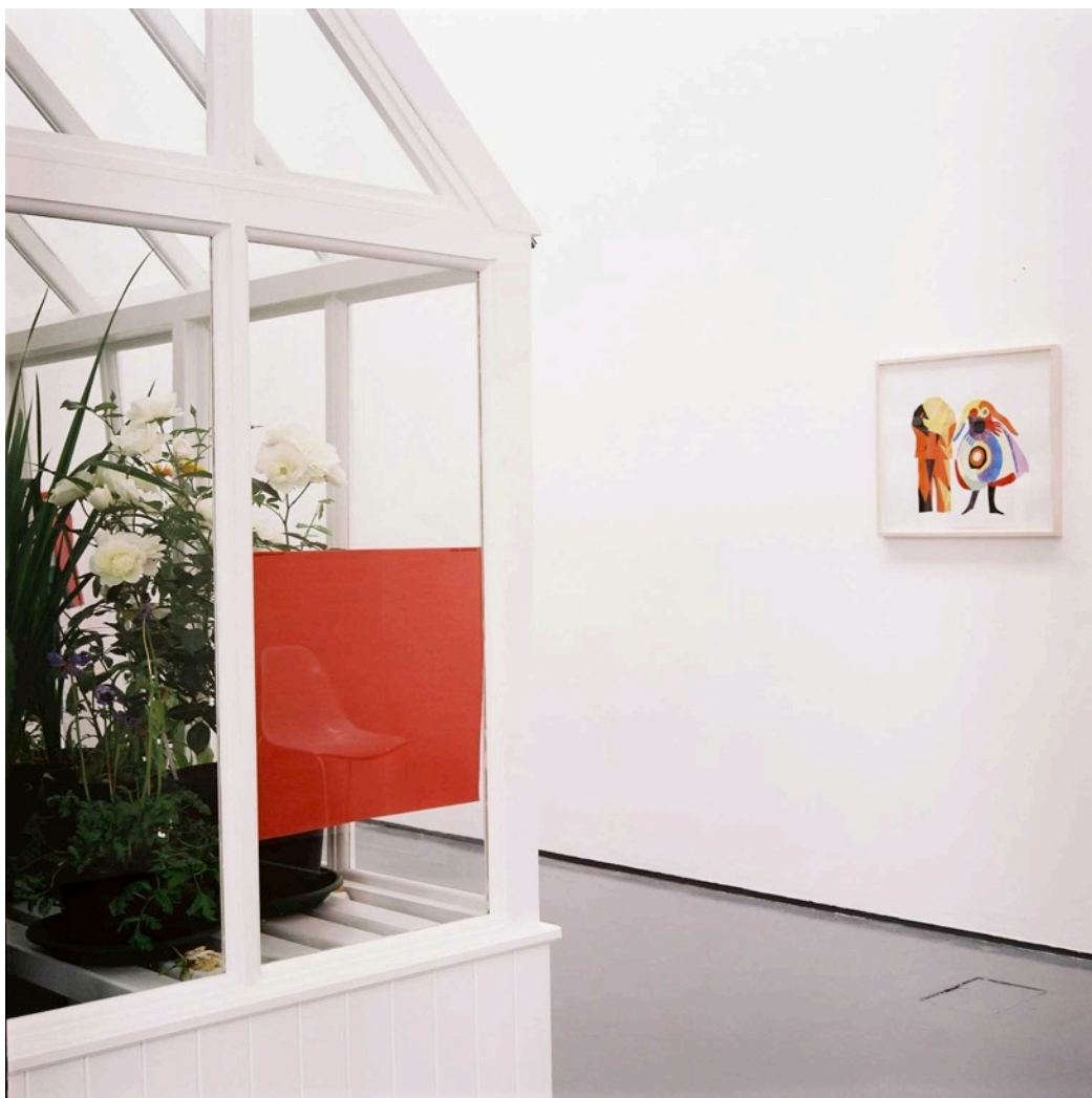
Exhibition view: 'Greenhouse' and Screenprint 'Modern Lovers'