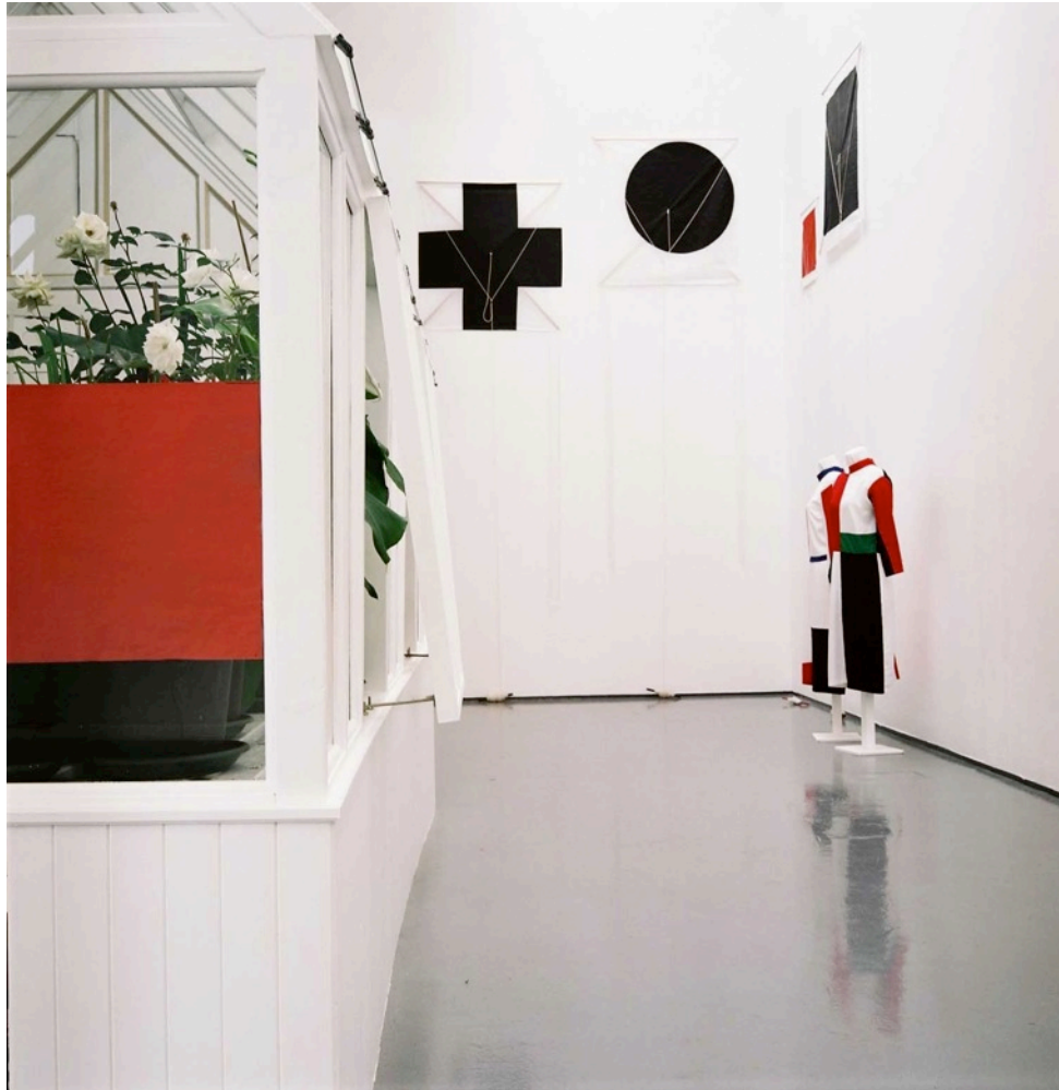
Exhibition view: 'Greenhouse', Kites and Suprematist Dresses after Malevich

For this exhibition Nielsen showed the kites themselves in the gallery. Their positioning in the gallery is also reminiscent of the irregular heights that Malevich often chose to install his paintings. In particular the first Suprematist exhibition in 1915 called '0-10'.