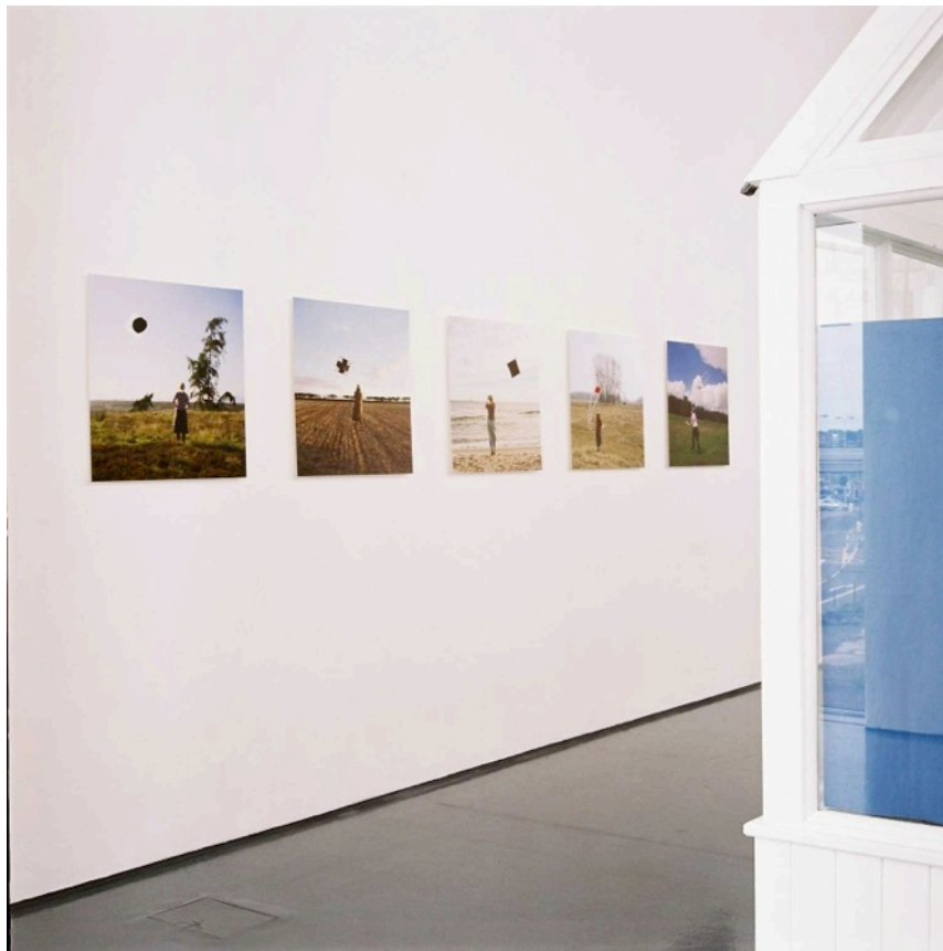
Exhibition view: 'Greenhouse', Kites Photographs