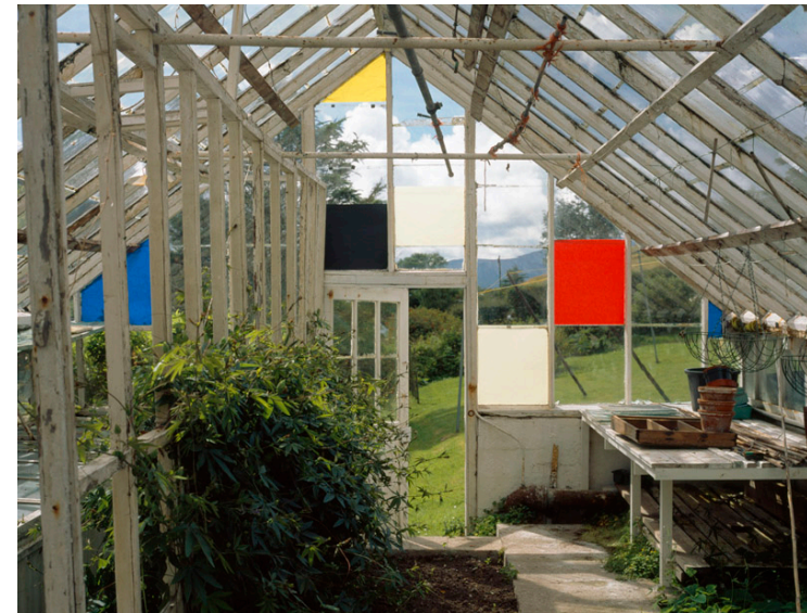
Mondrian's Greenhouse, photograph, 2002