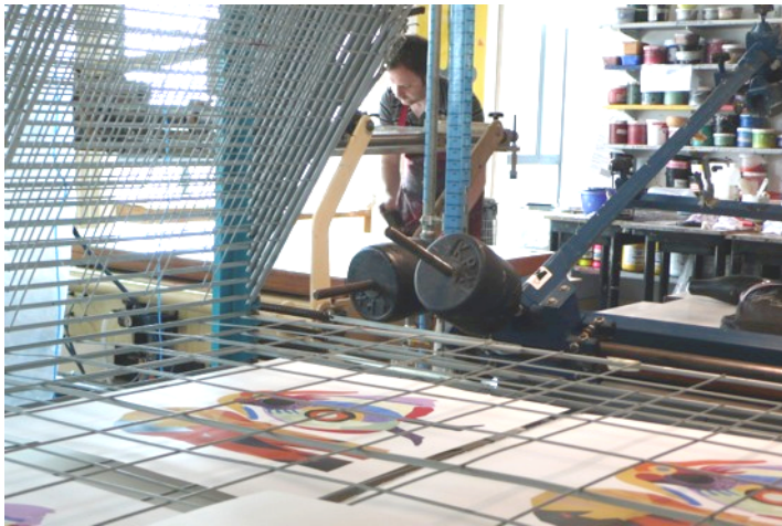
'Modern Lovers' in production at DCA Printstudio.