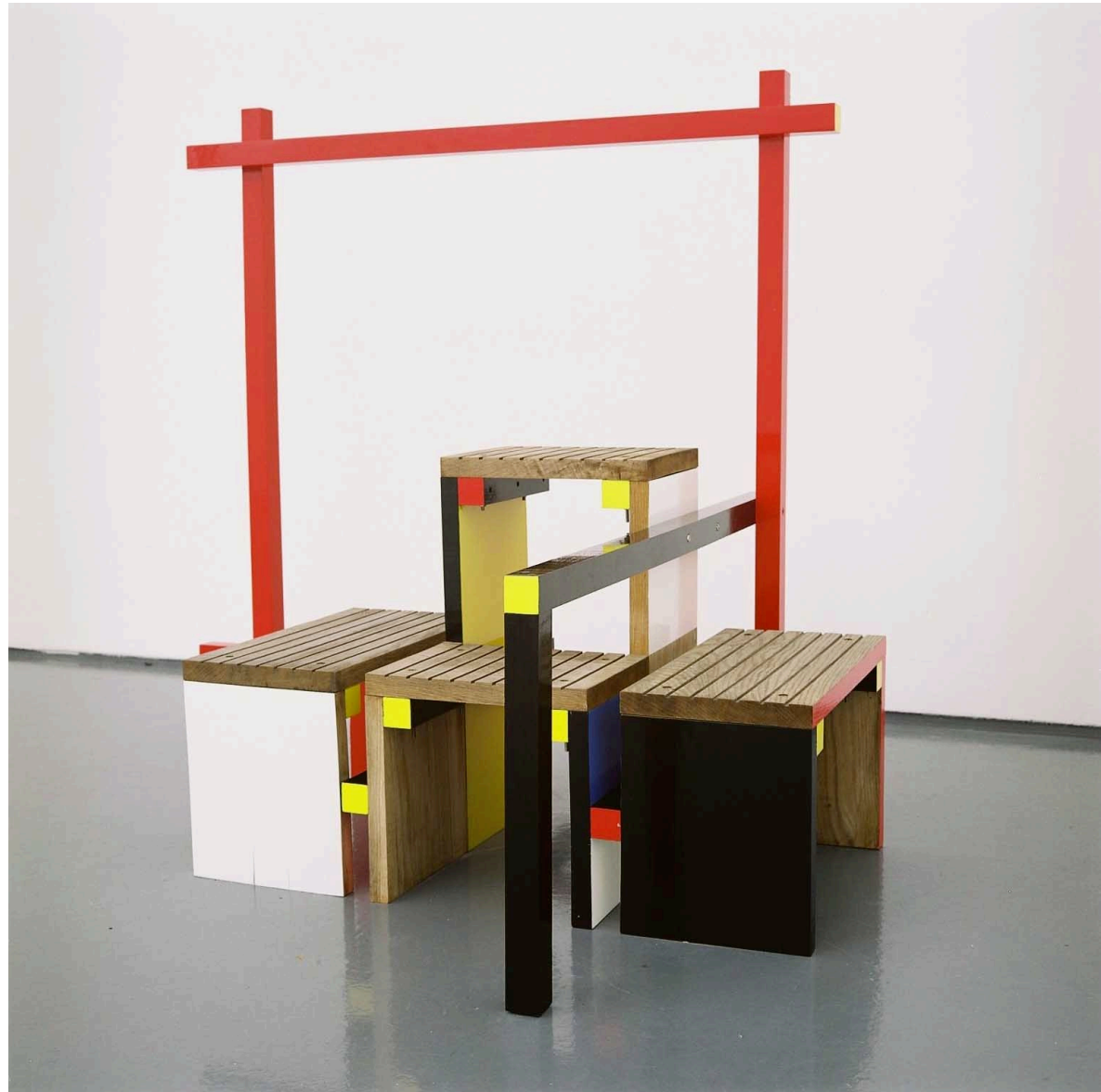
Exhibition view: 'Stile', 2002, gloss oil paint on oak, 130 x 120 x 142.5

The 'Stile' was commissioned by the Meadow Gallery at Burford House in Shropshire as a part of an exhibition "Picture This: Revisiting the Picturesque" 2003.