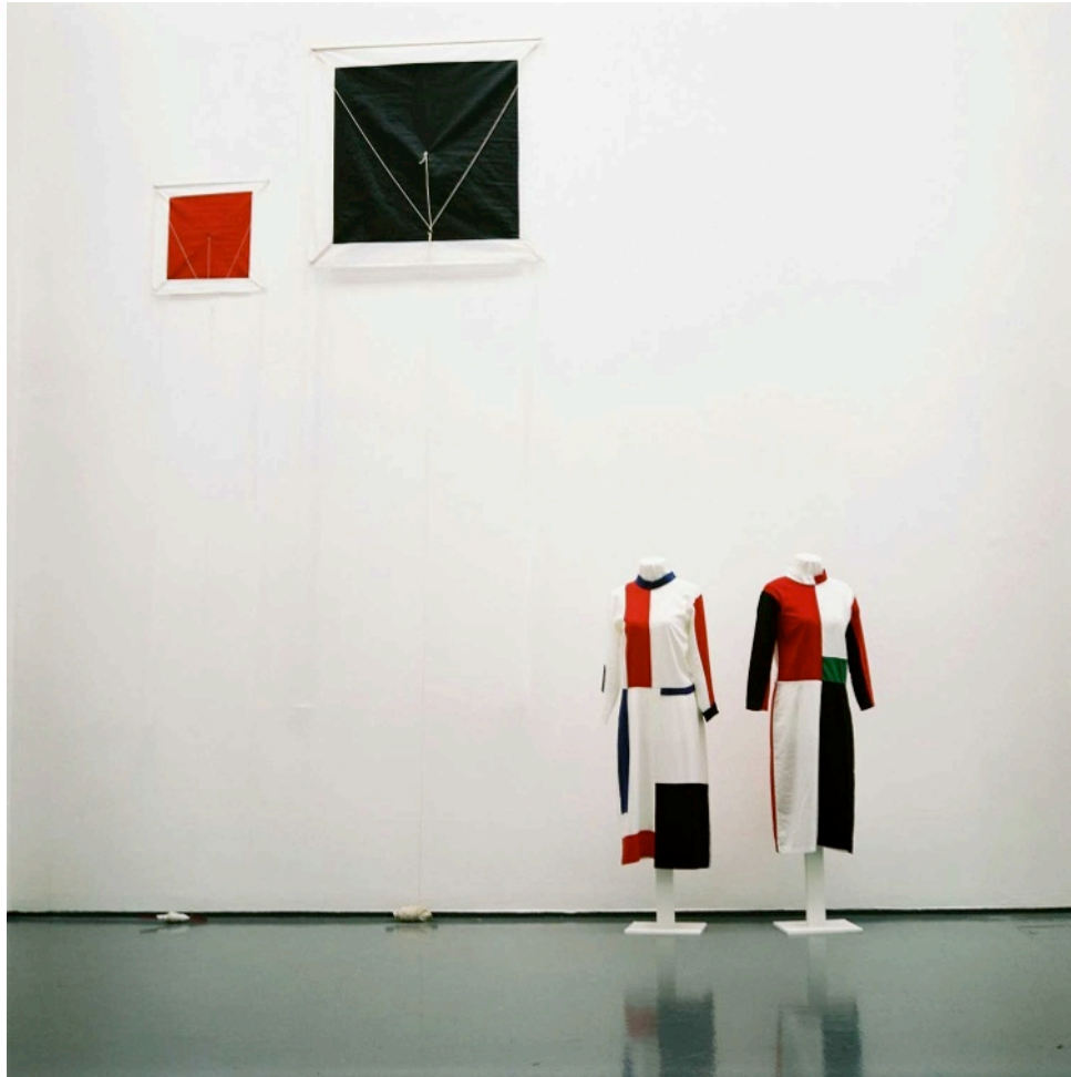
Exhibition view: Kites and Suprematist Dresses after Malevich.

The Suprematist Dresses after Malevich are based on a drawing by Malevich: 'Design for a suprematist `dress' in 1923. According to Christina Lodder those two dresses have not been made before.