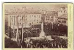
Inauguration of the Monument to Walther von der Vogelweide, Bolzano, 1889. Civic Archives, Bolzano.

What Bourriaud refers to as 'relational art' corresponds broadly to what more recent writers have variously called 'participation' (Claire Bishop), 2 'social aesthetics' (Lars Bang Larsen) 3 or, on a more generic level, and borrowing heavily from the original use of the expression by Joseph Beuys, 'social sculpture'. The only concessions here to traditional notions about the form a work of art is supposed to