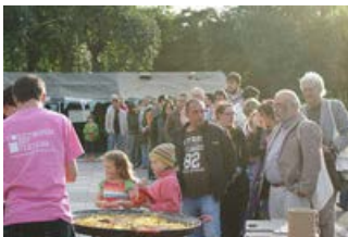
Aleksandra Mir 'The How Not to Cookbook - Lessons learned the hard way', Launch Event, The Ross Band Stand, Princes Street Gardens - 05/08 / 09