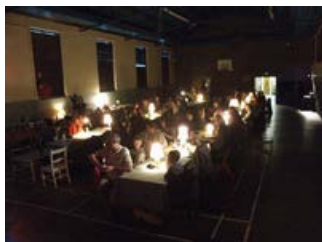
Aleksandra Mir 'The How Not to Cookbook - Lessons learned the hard way', Porty Pot Luck Dinner - 18/04/09; Courtesy of the artist and Collective Gallery.

Cookbook - Lessons learned the hard way', Porty Pot Luck Dinner - 18/04/09; Courtesy of the artist and Collective Gallery.