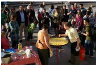
Aleksandra Mir 'The How Not to Cookbook - Lessons learned the hard way', Launch Event, The Ross Band Stand, Princes Street Gardens - 05/08 / 09; Courtesy of the artist and Collective Gallery.

take is the appearance of the words 'aesthetics' and 'sculpture', but the context in which they are now used signals a set of expectations very different from those of conventional art discourse. Here the sculptor is not the maker of a thing but the organiser of a situation. His or her 'raw material' (the relevance of its being uncooked will become clear in a moment) is not any kind of physical stuff, but the actions and responses of the people who have been invited to take part in it, and on whose willingness to engage with it the success of the work will depend. The old binary distinction between the artist as a specialist producer of discrete objects, and the viewer as the one who encounters them in an environment conducive to detached aesthetic contemplation, has now all but dissolved; in fact the viewer, defined as a passive consumer of predetermined 'meaning', has been entirely supplanted by the participant, who is now an active agent in the production of that meaning.