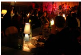
Aleksandra Mir 'The How Not to

by 1000 contributors from around the world 10 . The democratic and egalitarian aspirations that are evident in the inclusion of contributions from anyone prepared to offer one also extends to the theme of the book itself, which celebrates the familiar phenomenon of the 'cooking disaster', and the all-too-human failures that we experience on a more or less regular basis in our efforts to produce something edible in the kitchen. A beautifully produced parody of Alice Waters' classic recipe book The Art of Simple Food , it inverts our normal expectations of such publications by documenting the multitude of ways in which even the simplest culinary operations can go wrong.