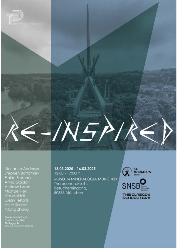
Poster Design , 2025 Digital & Print Media