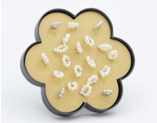
Columnar Ring, 2025 Oxidised silver, recycled aluminium and freshwater pearls 50 x 50 x 30mm