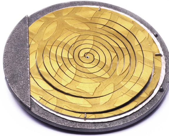
In my End is my Beginning (brooch), 2025 Recycled & sintered aluminium, silver and steel 83mm Diameter x 8 mm