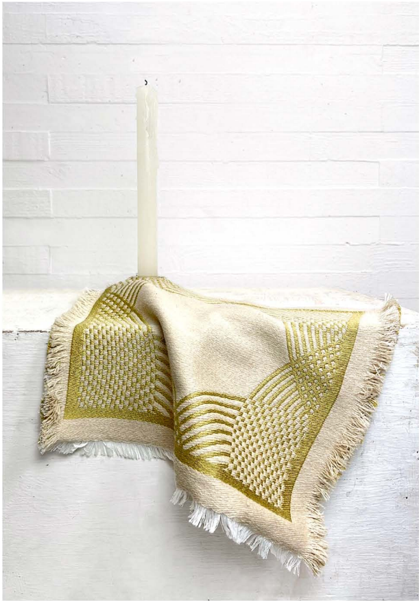
The Cloth-holder No.1, 2025 TECU® gold copper alloy, deadstock silk, cashmere, polyester filament 220 x 300 x 250 mm & 70 x 300x 250mm