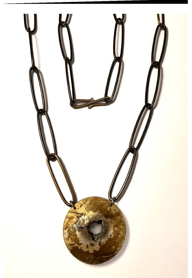
Decladation Neckpiece, 2025 Recycled aluminium, silver, gold 35mm diameter x 765mm