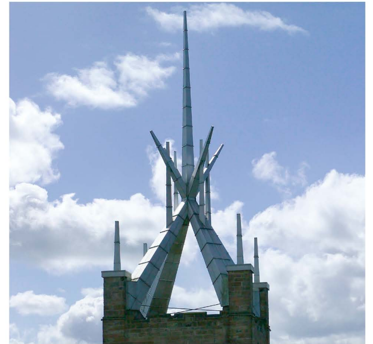
Deteriorated spire before 2024 restoration by Images Above Ltd.

The original aluminium cladding recovered from the 'Cross of Thorns' spent over 60 years exposed to the Scottish elements. The original aluminium, anodised a bright golden yellow, had faded and been weathered, and the change of patina had contributed to a change in colour and shine.