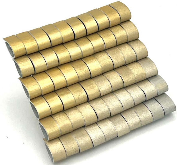
Time (brooch), 2025 Recycled aluminium, silver and stainless steel 80 x 80 x 10mm