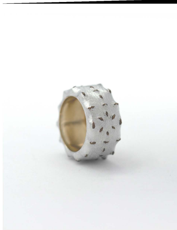
Untitled Ring, 2025 Recycled aluminium and TECU® gold copper alloy 25 x 12mm