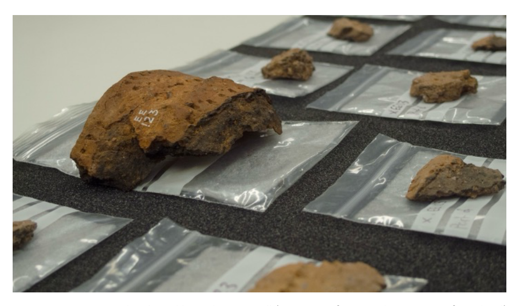
Sherds and bags © Gina Wall (Courtesy of National Museums of Scotland)

These pots were made of clay, the body of the land, decorated and fired and then placed in the cist. It is something of a misnomer to call these food vessels, for there is no evidence that they actually carried food. In many cases, it is unclear exactly what they were filled with, but sometimes they held the partially cremated remains of the occupant of the cist: