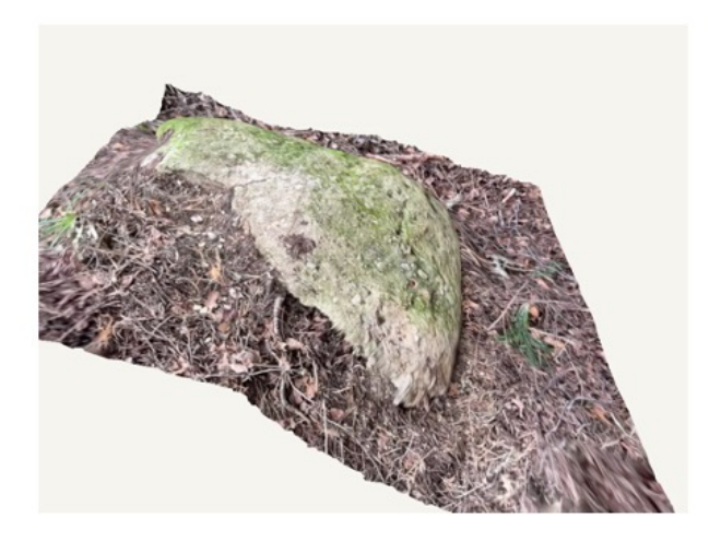
Still from a spinning 3D Scan of the capstone