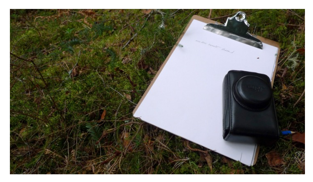
Meadowsweet Shroud

Evidence of organic materials have been discovered with Bronze Age burials, in archaeology these are called biofacts or ecofacts . And they provide a sense of the more-than-human intra-actions at the time of the burial. A lovely example of an ecofact would be the presence of Meadowsweet pollen. It is thought that burial shrouds may have been made from Meadowsweet to protect the deceased. Meadowsweet ( Filupendula ulmaria <sup>3</sup>) is a common botanical widely found in Europe with natural herbal qualities – salicylic acid, from which asprin is synthesized, was first isolated from the plant<sup>4</sup>. And although there has not been any analysis done of the cist remains from Altyre, and therefore no evidence of the presence of meadowsweet, I was speculating on this when I took this photograph in the field in 2021, close to the site of the cist. What interests me about these botanical details is that they connect, what in our human understanding seem like, moments separated by vast time scales. Ecofacts speak of the ongoing cultural relevance of plants, their use in the derivation of synthetic medicine and the importance of knowing the ground around you. They also remind me of what I have often overlooked, you could say I stood on somethings and somebeings that I just did not comprehend.