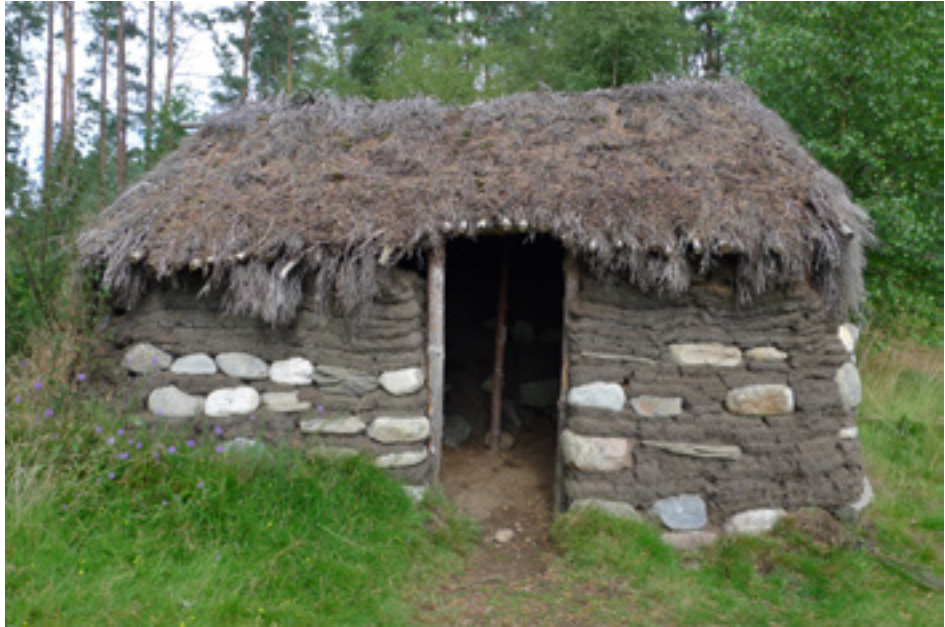
Figure 4. (Above) Reconstruction of a shieling .