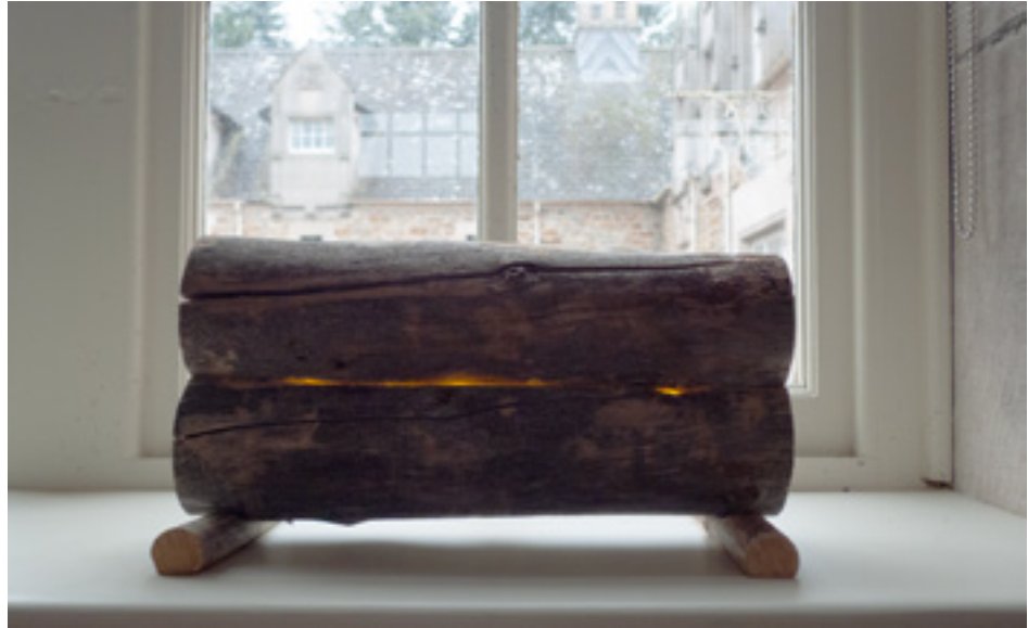
Figure 15. Rakovalkea lamp.

In traditional settings, the Rakovalkea , an overnight campfire (Figure 2), was constructed from dead pine wood selected for its appropriate thickness, ideally as straight as possible (Järvinen, 1956). The space between two logs would be filled with birch bark and spruce boughs (Järvinen, 1956). Due to regulations prohibiting open fires at the build site, the Rakovalkea concept was adapted into a lamp, crafted from similarly sourced Finnish dead pine wood, maintaining the ambience and warmth of the traditional campfire (Figure 15). As dusk fell and the firelight glowed, laavus became venues for storytelling, showcasing the deep ties between Finnish folklore and forests. This storytelling tradition was encapsulated through laser-cut plywood signs that illustrated students' reinterpretations of the laavu . In contemporary laavu culture, visitors engrave personal marks on wood, creating a guestbook embedded within the structures. Participants inscribed their signatures on the plywood board, which represented their home country (Figure 16). This practice embodies the communal essence of the laavu and the symbiosis between material and cultural practices. The laavu was engraved with a compass, orienting it in relation to north, pointing towards its place of inspiration (Figure 17).