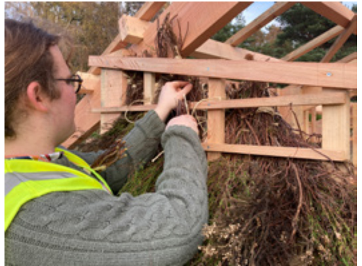
Figure 11-14. Collaborative construction.