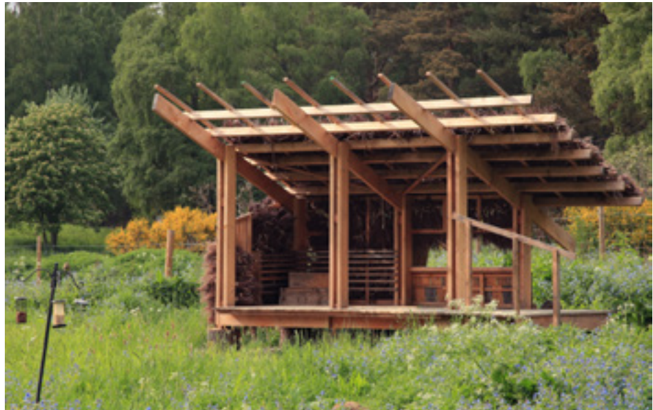
Figure 1. Shielin-laavu .

The interdisciplinary and ecocultural approach to revitalisation and regeneration aims to cultivate education for cultural sustainability amidst the pervasive challenges posed by globalisation, urbanisation, and climate change (see e.g. Auclair & Fairclough, 2015; Dessein et al., 2015). The project which we draw upon to formulate the case study for this chapter is shielin-bough , a multi-stage collaboration between The Glasgow School of Art and the University of Lapland. This collaboration coalesced around the concepts of shelter, food and storytelling. The title plays linguistically with the name of a Scottish vernacular building used for seasonal inhabitation, a shieling , and bough, or branch, denoting our interest in the cultures of wood and wooden shelters. Therefore, shielin-bough comes to represent both