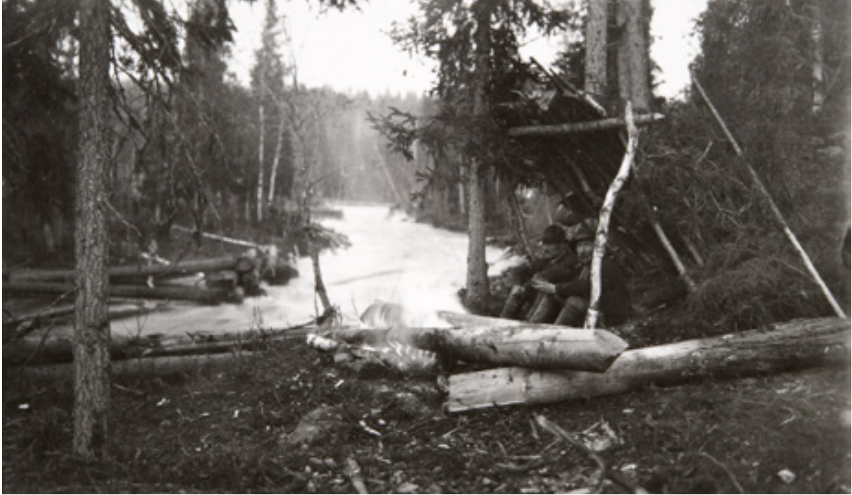
Figure 2. (Above) Log driver's laavu by a rakovalkea . Photograph: Sakari Pälsi, 1923. Courtesy of the Finnish Heritage Agency.