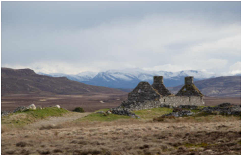
Figure 5. (Below) At the Shieling , Dava Moor.