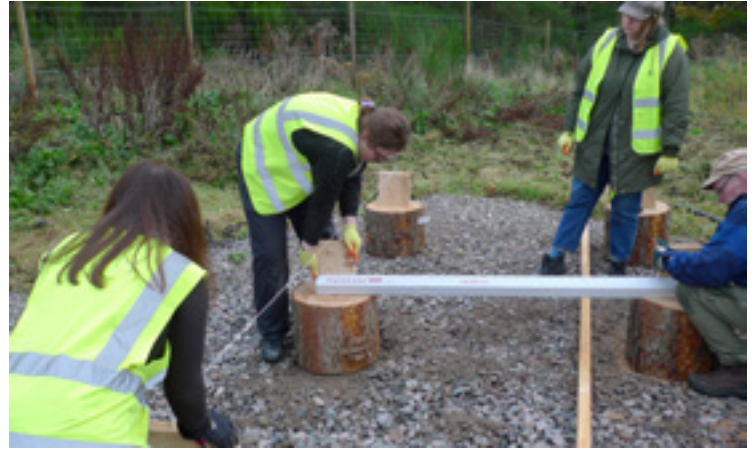
Figures 8-9. Architects at work and levelling the foundations.

bringing students together from architecture, environmental design, and art education, with a common focus on the cultural and practical aspects of materials. The hands-on interaction with materials enriched students' knowledge of their characteristics, limitations, and potential applications. The construction process itself was highly collaborative, with students working alongside experienced architects, technicians, and artistic practitioners/teachers (Figure 9).