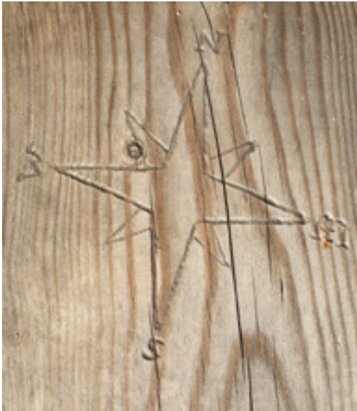
Figure 16. (Above) Engraved wood, maps of home. Photograph: Gina Wall, 2023