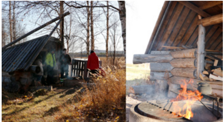
Figure 3. (Below) Community laavu at a historical logging site at Meltosjärvi Village. Photograph: Ella Haavisto, 2022.