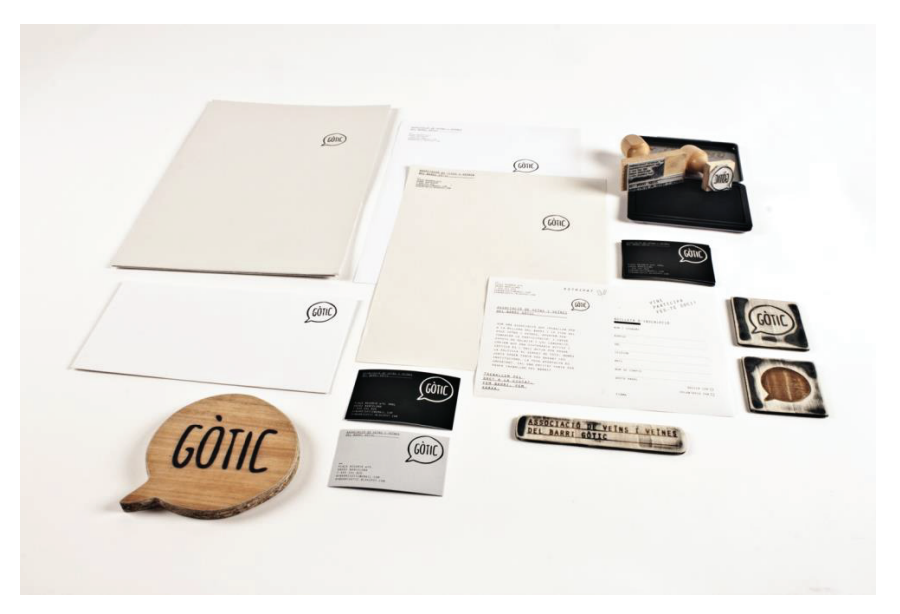
Figure 4. Corporate identity and stationery of students' second proposal, including low-tech applications .