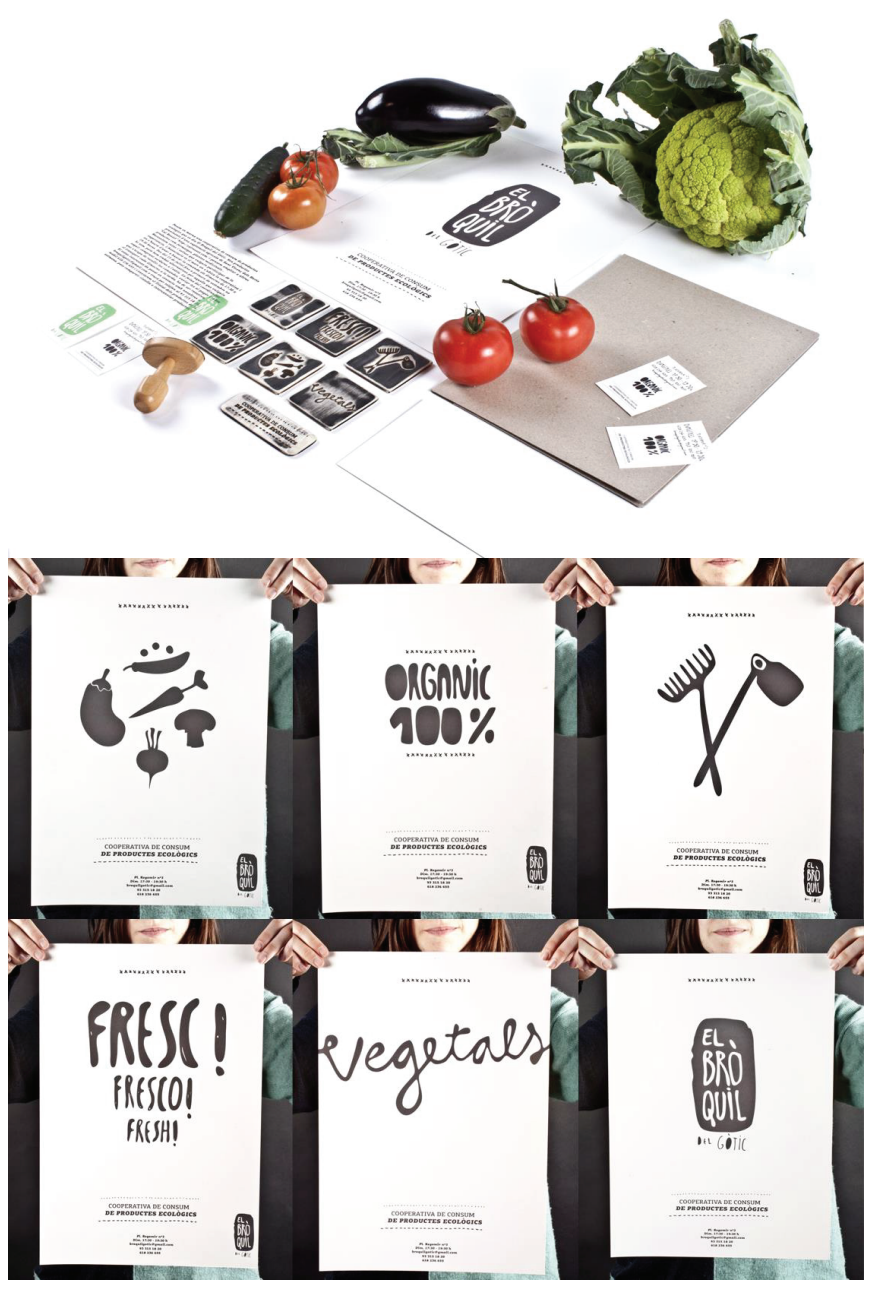
Figure 5. "El bròquil" food cooperative corporate identity.

The students also presented a campaign in which all of the claims and problems of the district were brought forth. The proposal was intended to cause awareness-raising