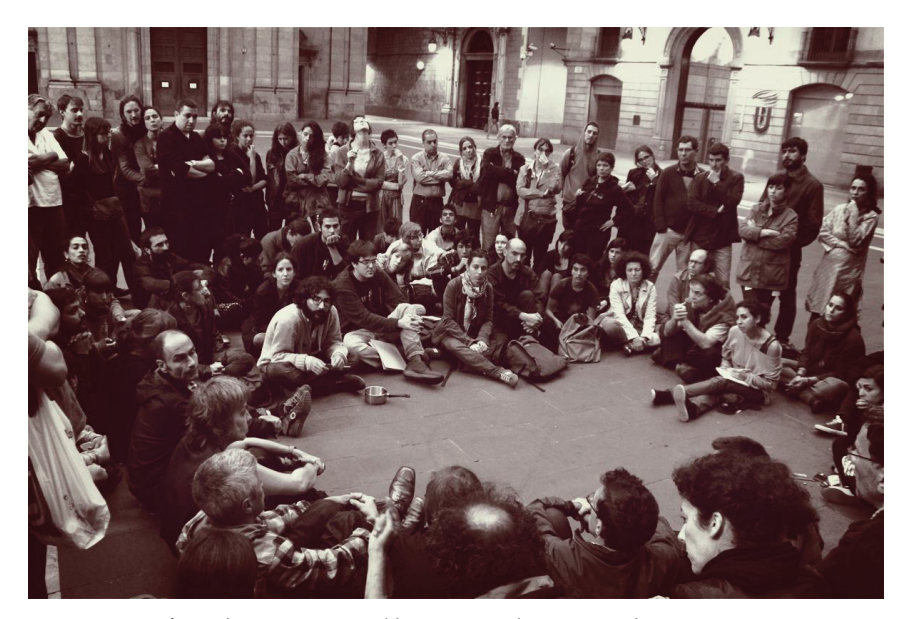
Figure 2. District's residents street assembly.

The field work was carried out using some of the traditional qualitative techniques: documentary sources (literature on the district, magazines, press, documentaries, etc.), distant observation (prospecting), and participant observation, making use of the bonds that had been sown with the residents' association in the work done on the informative leaflet, and in-depth interviews. The fieldwork helped to strengthen the bonds with the already known members of the residents' association and relationships were also started with other associates and residents. The students became involved in some of the activities carried out by the Association: the district assemblies and the organic food co-operative.