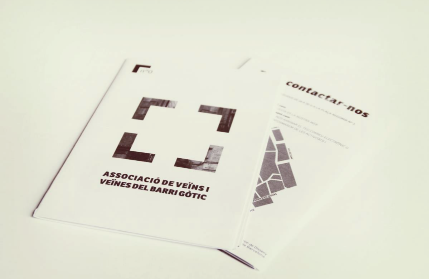
Figure 1. Logo and informative leaflet in student's first proposal.

The representative was very impressed and grateful. Both the informative leaflet and the logo they had designed for the corporate identity upheld and modernised the association's image. However, when the delegate presented the results to the rest of the members of the association, there was strong criticism of the corporate image. It was generally argued that the design would give the association an excessively enterprising identity. They were not a company, but rather an association of residents. However, the representative argued in favour of the project and his opinion finally overrode with the support of one sector of the association.