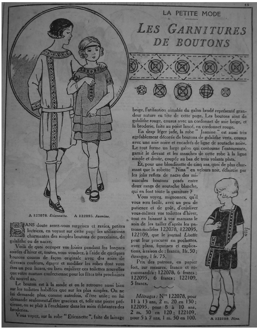
Figure 10. Anonymous, "La petite mode: les garnitures de boutons," Lisette (December 7, 1924), 15, private collection.

[Another dress in an ivory woolen cloth is embellished with black braids in the Romanian style, as well as a third one, a kind of gandourah, made from a fine warm white cloth decorated with a trim of large archaic flowers embroidered in vivid colors with woolen thread.]