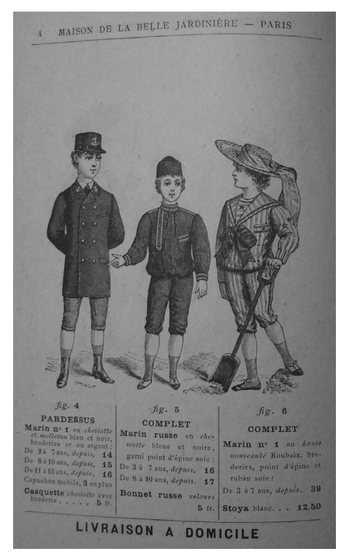
Figure 5. La Belle Jardinière. Catalogue spécial de vêtements pour jeunes gens et enfants (1890), 4, private collection.

of cross-stitched embroidery or a braid of astrakhan fur is applied along the fastening