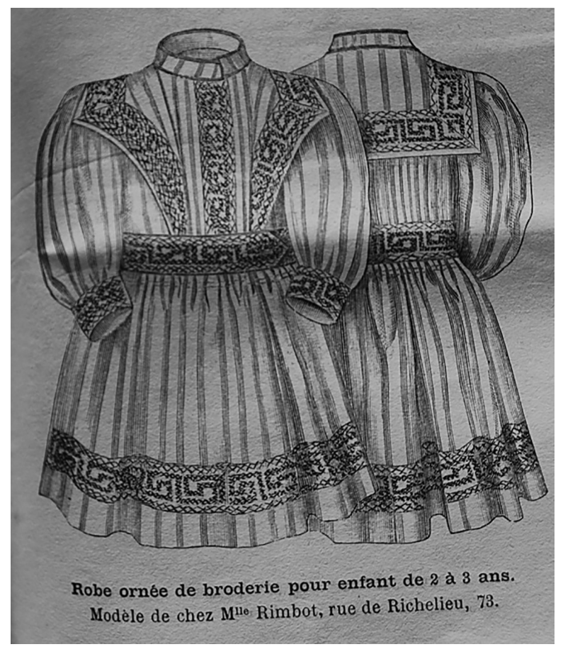
Figure 8. Anonymous. "Robe ornée de broderies pour enfant de 2 à 3 ans," La Mode illustrée (1895), private collection.

to find friezes of braids in Greek patterns running alongside the fastening line or the collars of tunics "à la russe."