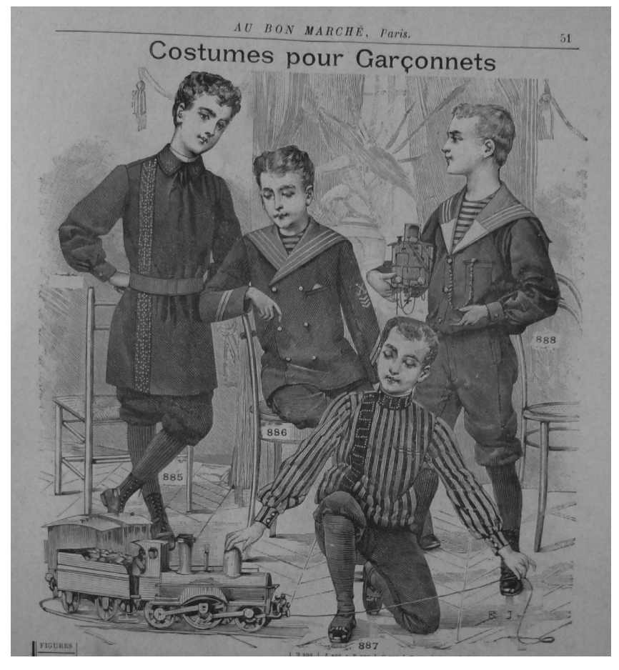
Figure 4. Au Bon Marché. "Costumes pour garçonnets," Catalogue général (1893–1894): 51, private collection.

an indigenous outfit inspired children's fashion and accompanied the visionary simplification of children's clothing as well as the acknowledgment of a new fashion aesthetic.