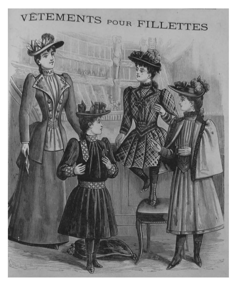
Figure 6. Au Bon Marché. "Vêtements pour fillettes," Album des toilettes d'hiver pour dames et enfants (1891–1892), 15, private collection.

If the specificity of the sailor suit remains in the association of breeches and a tucked-in tunic, the Russian aspect of this outfit stands in the style of fastening, similarly positioned at the side of the front of the tunic. The name of the outfit refers clearly to the pattern and the styling. The mention of "Russian dress" qualifies similarly constructed girls' gowns. From the overalls to the girl's dresses from the nineteenth century onward, the qualificative "Russian" was linked to a particular outfit construction and was definitely included in children's dress repertoir