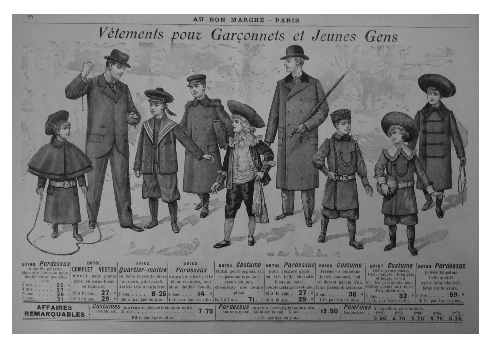
Figure 1. Au Bon Marché. "Vêtements pour garçonnets et jeunes gens," Exposition des toilettes d'hiver pour hommes, dames et enfants (1898), 20, private collection.

Reflecting on the definition of the child, this paper will first question the role of fashion and dress codes not only in the representation but also in the construction of individuals to be socialized. Then, based on Balut's original interpretation of fashion and dress codes,<sup>4</sup> I will analyze the features of this Eastern inspiration, which seems to last beyond World War I, and the diversity of its expressions.<sup>5</sup> Finally, after contextualizing this analysis of a specific style in childrenswear against children's role in society, I will propose an original approach to children's fashion as an educational and socializing medium.