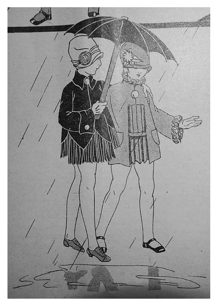
Figure 9. Griseline. "Les manteaux de fillettes," La Femme chez elle (January 15, 1927), 18, private collection.

Les broderies russes au point de croix, en coton de couleur, se disposent fort gentiment autour des encolures rondes et sur les poignets étroits. Quand on les utilise, il faut autant que possible conserver la forme classique en honneur en Russie. [The colorful Russian embroideries are placed around the neckline and wrists. When utilized, one needs to keep the traditional Russian shape as much as possible.]<sup>33</sup>