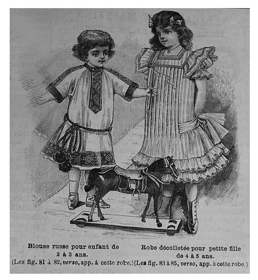
Figure 7. Anonymous. La Mode Illustrée (1902), private collection.

Naming of garments and outfits is particularly meaningful to reinforce this reference to Eastern styles. For example, in the fashion magazine La Mode Illustrée , a tunic for children ages two to three is entitled "Russian" and embellished with bands of cross-stitched geometric patterns and tied with a cord edged with tassel