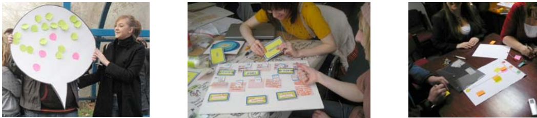
Figure 1 - User engagement tools

We have all travelled to attend this conference so, using our recent experiences of the transport systems, we will explore the design and use of tools to extract and gather service-user and service-provider information. These methods and tools help service designers engage more usefully with user groups and enable them to extract the key data and insights that will later inform their design proposals. We will discuss the importance of tailoring tools to the project and to the people we are engaging.