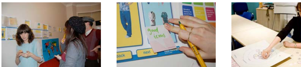
Figure 5 – Developing proposals with user group assessment and feedback of service prototypes

Making sense of the research gathered is one thing, but it has to be used to generate proposals for a new service provision. Turning the analysis from what we know about the current situation, to what should be done to improve it. The design tools developed in the early stages can be used to help create ‘what ifs’ – what if this or that relationship was changed; what if we rephrased the problems and opportunities as user desires and expectations, etc. From the insights gained from our research and critique of the current service we will attempt to create new service propositions. To test our proposals, we will explore how elements of the service propositions might be prototyped to assess and refine the design.