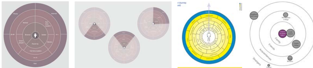
Figure 4 – Visualising pathways, interactions & relationships

Different users are likely to access a service in their own way, exhibiting alternative journeys through the service. We will look at the design of tools that investigate and communicate these different pathways, interactions and relationships. These tools can also be used to explore concept ideas and refine our understanding of elements of the service.