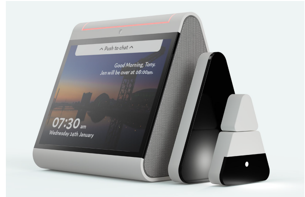
Figure 4: The Snooze Safe bedside hub (left), and property exit sensors (right)

irrespective of age or ability. In particular, the use of telecare for overnight support (sleepovers) was explored. Sleepovers are designed to meet a range of needs including support where a person: has a significant mental health problem or learning disability that means it is difficult for them to be alone overnight; needs a call/conversation to reassure or check-in; or might wander or leave the house. In the UK, the cost to employ a social care worker for sleepover hours has increased markedly due to a change in legislation around how staff are paid, representing a ripe opportunity area to potentially introduce telecare.