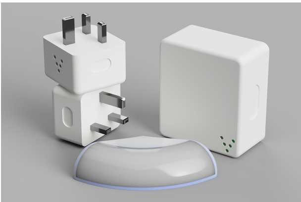
Figure 3: The Evolve vHUB (right), vSENSE (bottom), vSPEAK (top left) and vSMARTPLUG (bottom left)

this and other research has indicated that many end users choose not to wear their pendant and/or other wearable device (e.g. a fall detector) or they forget to put it on. In response, several of the design teams explored two directions: ambient and voice sensing technologies—removing the need for end users to be wearing a device and/or to be capable of pressing a button when help is needed; and interoperability with mainstream home technology products connected to the Internet such as smart speakers e.g. Amazon Alexa and Google Home—to help remove the noticeability of telecare equipment, and encourage people to consider purchasing consumer technologies rather than a telecare equipment package from their local authority.