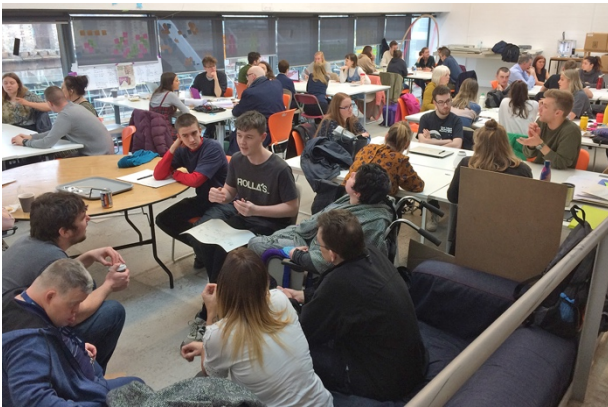
Figure 1: User engagement activity

The Develop phase is about opening up—iteratively developing and testing the concept designs. The design teams revisited the retirement housing community and two of the three carer centres to gather feedback on their chosen concept designs. It was not possible to revisit the third carer centre due to scheduling difficulties. The sessions followed the format of the previous engagements (Discover Phase). The designers also engaged with telecare H&SC professionals. The format of the session was a design critique within the design studios at the HEI. Participants were divided into small groups, then on a rotating basis, each design team met with each group of participants to present their concept designs for constructive feedback (Figure 1). Participants comprised staff from the H&SCP, the carer centres, the learning disabilities service who were accompanied by three of their clients, the ARC, and the technology demonstrator flat.