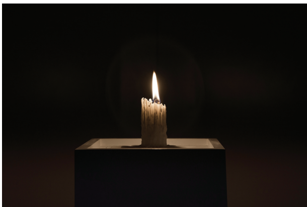
Figure 2. Katie Paterson, Candle (from Earth into a Black Hole) , 2015 Exhibition view OCAT, Shanghai, 2016

The displacement of the artist in Paterson's work is operationalized through her recourse to the methods and procedures of science. This, however, is entirely collaborative and Paterson's work with those such as biologists, scientists, and geologists forms the backbone of her practice. In this respect, her work typifies