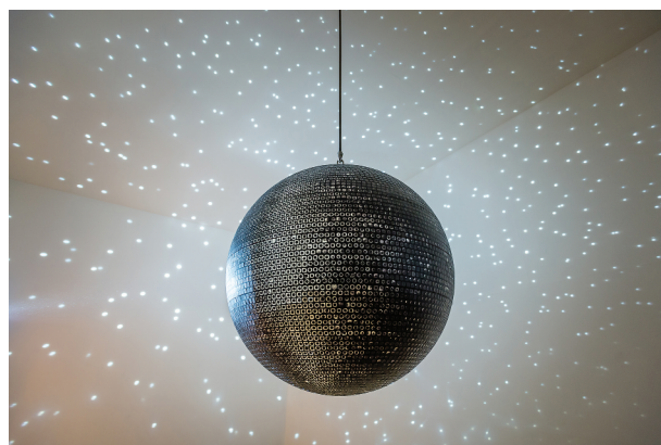
Figure 3. Katie Paterson, Totality , 2016

Science's communicative efficacy is not assured in her work and Paterson presents the fault lines of our relationship to science. Her work becomes a serigraph to wider societal, including its technological developments and, importantly the issues our advancing progress raises. The role of observation is crucial for Paterson in teasing apart these ideas. She mirrors scientific procedures through adopting their strategies of observation and processes of looking, but in the presentation and display of her work she undermines the very methods used to produce them through failing to contextualize her findings. That is, her work does not reinforce science's authority. As Mary Jane Jacob (2016) notes, Paterson's work shares with science a commitment to observation. This can be seen in her 2016 piece "Totality" (see Figure 3 ). Decorating the outside of a mirror ball, which when exhibited is hung from the gallery ceiling, the artist has covered the surface of the ball with 10,000 images of all known solar eclipses. Ranging from early