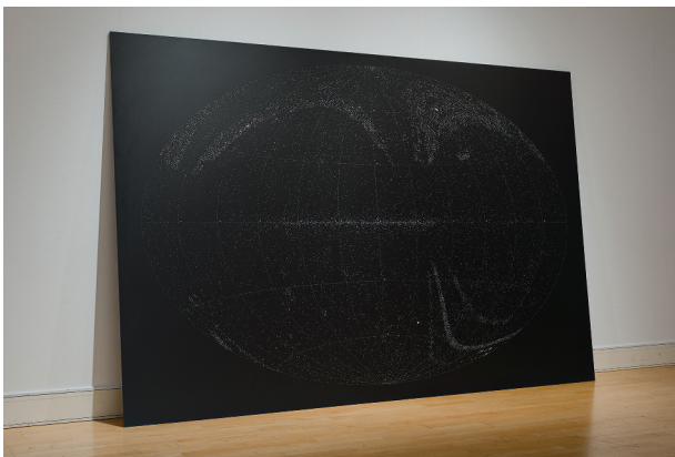
Figure 1. Katie Paterson, All the Dead Stars , 2009 Installation view, Mead Gallery, Warwick Arts Centre, 2013

As a visual artist, this transformation is orchestrated through a visual presentation of her subject and whilst highly conceptual in content, her work provides the viewer with a way of witnessing something more normatively out of reach; a means of representing it and in so doing transforms our relationship not only with the phenomena explored but the instruments used to articulate it. Correspondingly, the register of cosmological time and space coalesces with the human. But the potential