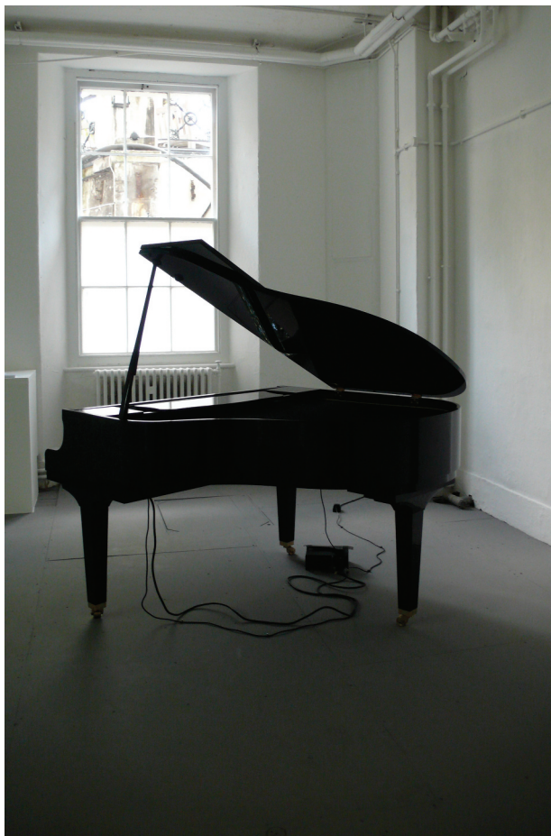
Figure 4. Katie Paterson, Earth-Moon-Earth (Moonlight Sonata Reflected from the Surface of the Moon) , 2007 Installation view, the Slade School of Fine Art, 2007

of contemporary technology does not rupture this lineage but in fact supports it. In this, we can see a confluence of Ottinger's second and third category of approaches to cosmology. We can see this played out in her 2007 piece, "Earth-Moon-Earth (Moonlight Sonata Reflected from the Surface of the Moon)" (see Figure 4 ). For this piece, Paterson took Beethoven's Moonlight Sonata and converted into Morse code before sending it as a radio signal to the moon, from where it bounced back to Earth. In the process of transmission, the surface of the moon interfered with the score and only sent back a partial recording. In the subsequent exhibition, a self-playing, pre-programmed Disklavier Grand piano plays the new score, translating the indentations and crafters of the moon as breaks and gaps in the music. In his analysis of this piece, art historian Nicolas Alfrey reflects on Paterson's choice of music. As the epitome of romantic music, the Moonlight Sonata is an icon to this particular sensibility that has arguably lost its ability to invoke "authentic feeling" (2009, 8), and in making this choice, Paterson is not only engaging with the music but the wider narrative in which it is embodied. For Alfrey, sending Beethoven's piece