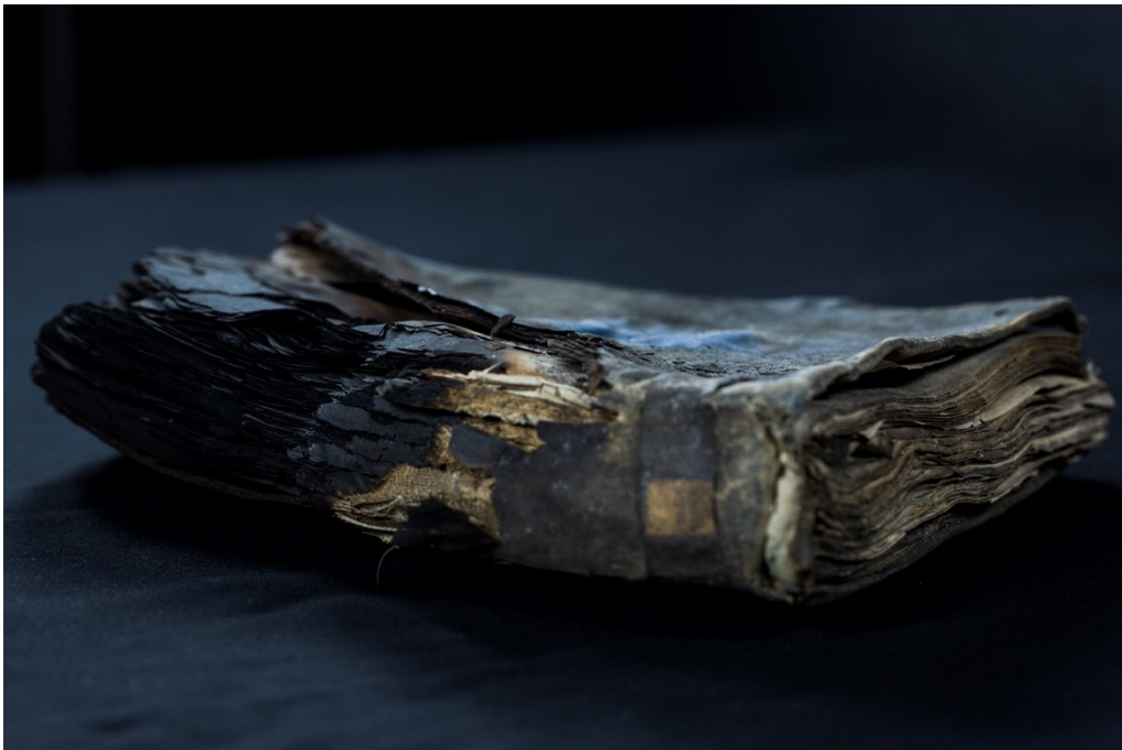
Plate 3.7 Side view of the Burnt Book spine