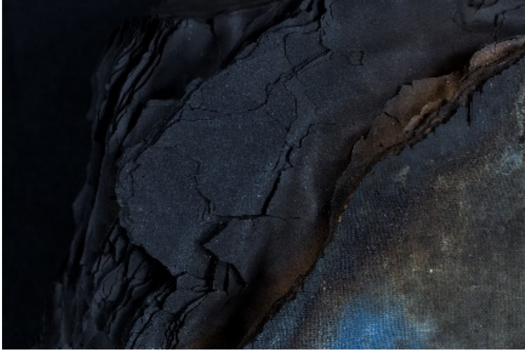
Plate 3.4 Detail of the burnt text block