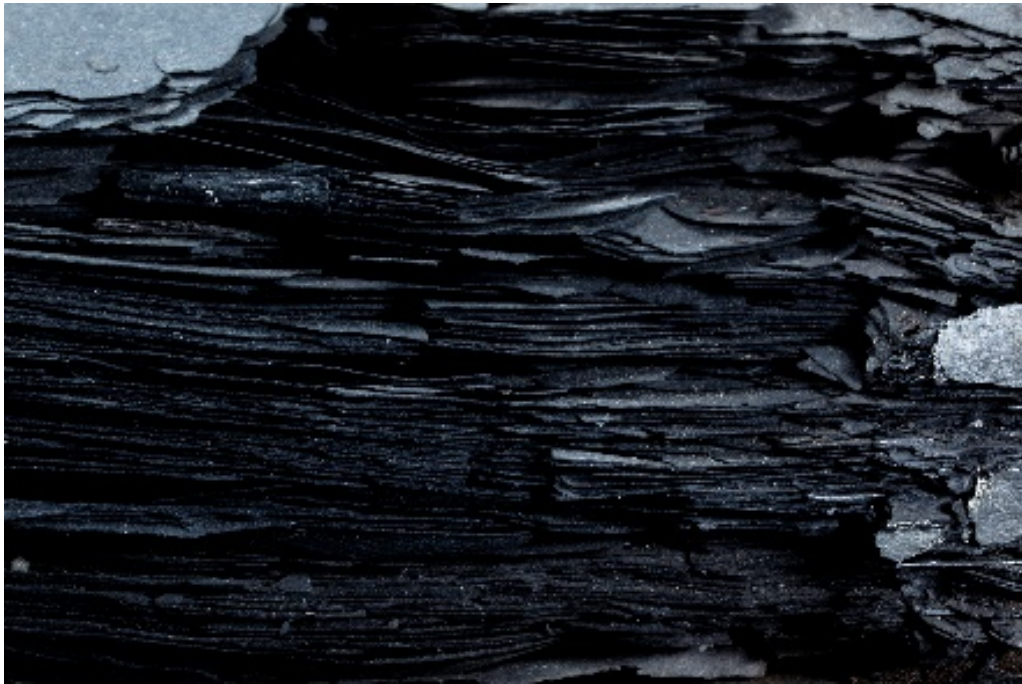
Plate 3.5 Detail of the burnt text block