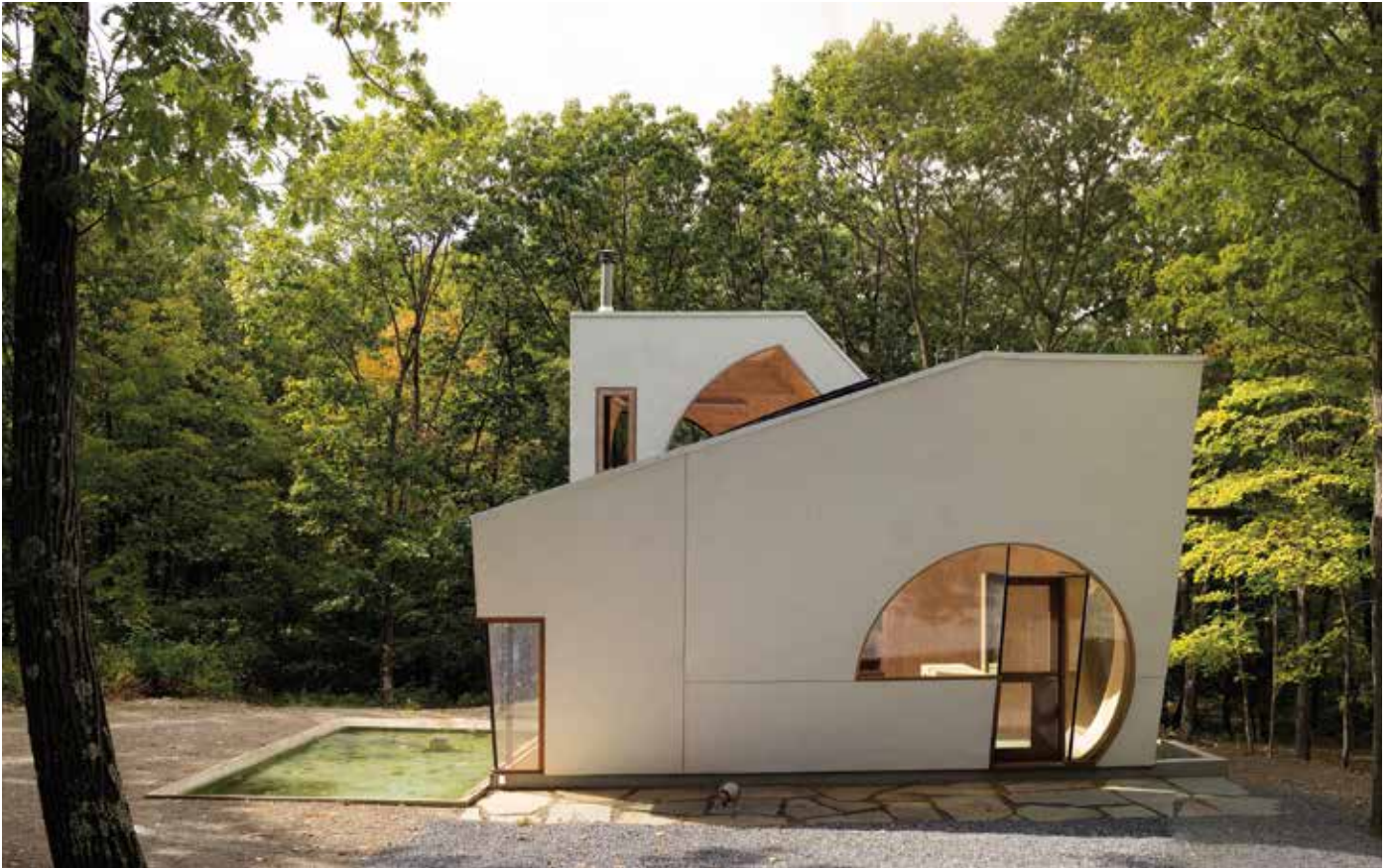
Figure 1. The Ex of IN House completed by Steven Holl in 2016. The 918 sq. ft. property [85 m 2 ] sits on 28 acres [11,3 ha] of forested land in Rhinebeck, NY.

again...” 4 This statement alone is an important enough revelation to build an entire conversation around and a topic which has not yet been explored in other publications to my knowledge. How does an architect like Holl return to a project after the first promising idea has proved unfruitful? When is it clear to him that an idea has not got what it takes? When does he know when he needs to initiate a new beginning, rather than simply invest more work in what had previously shown promise and potential? Such a conversation might have shed new light on the further complexities of his design process; possibly also dispelling a myth that his morning sessions concern themselves solely with lighting the blue touch paper, rather than accommodating the later stages of a design’s gestation as well.