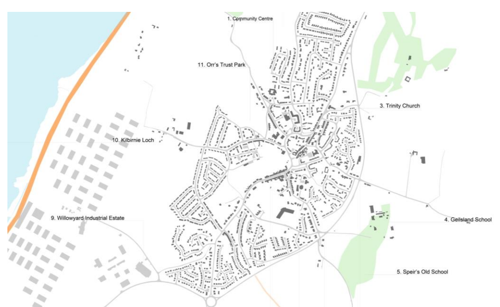
Figure 7: Mapping the key areas which flagged up in the engagement exercise.

AMPS, Architecture_MPS; Liverpool John Moores University 08-09 September, 2016