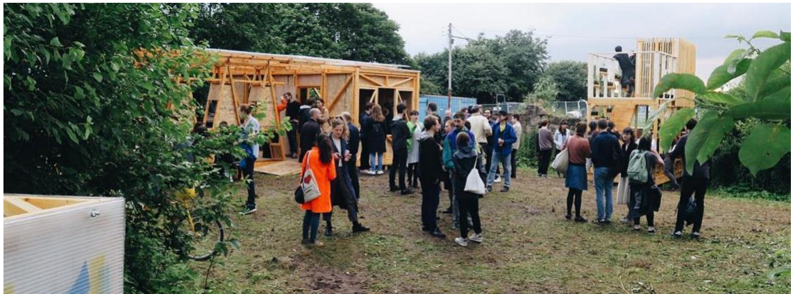
Figure 3: Test Unit, complete and with an event in full swing.

social experience, promotion, site development and occupation and ideas generation, as well as visibility and community engagement - through a process of spatial prototyping and by demonstrating capacity - in a week on a very marginal site interventions were developed which not only improved the public realm in a very direct way, but also produced public space through the development of new social activities, consolidated in built fabric.