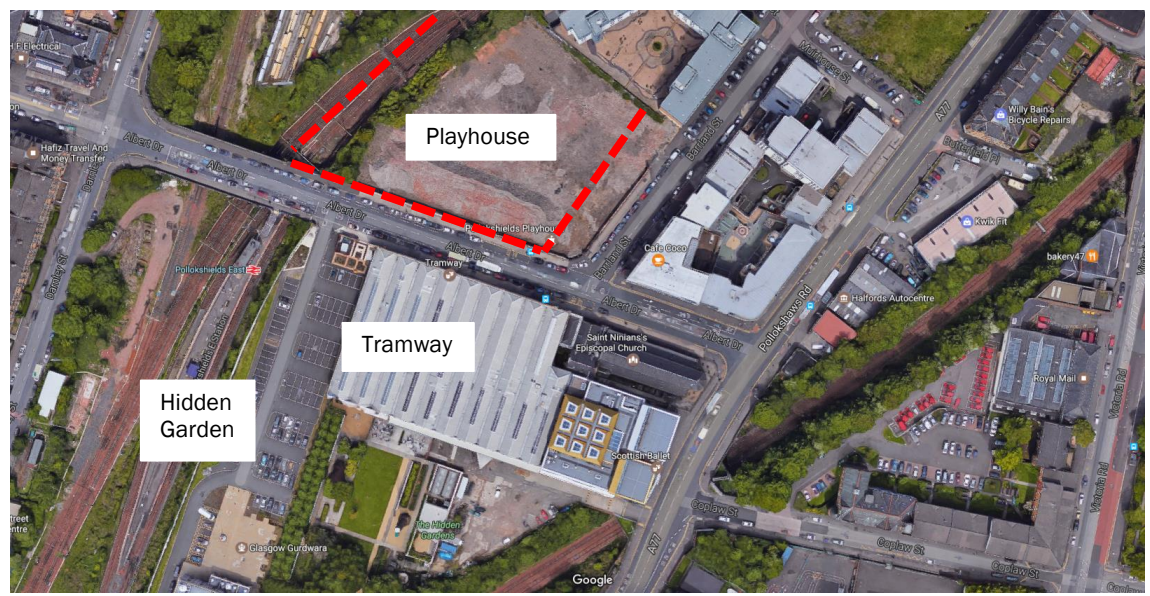
Figure 4: Playhouse in context (Image from Google Maps. Accessed 26.

The area of Pollockshields has a significant low-income, ethnic minority community living alongside an increasingly middle-class population attracted by traditional housing, proximity to the urban core and an attractive cultural context. This gentrification was stimulated (if not entirely started) by the development in 1988 of a disused tram depot into Tramway, an arts centre, extended to its rear in 2003 by the development of The Hidden Gardens as a space for intercultural community building.