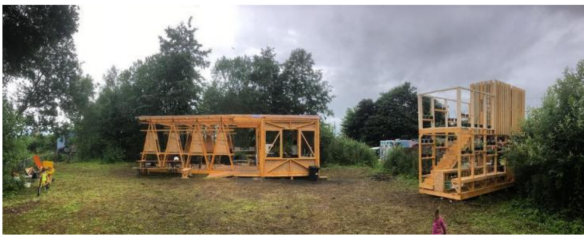
Figure 1: Test Unit, showing main pavilion (left) and 'The Nettle Inn' (right) under construction.

The Test Unit summer school had a discrete agenda: it wanted to supply an antidote to the customary participatory processes of talking, charrettes and oral consultations which had been applied to the site, but which had resulted in little actual improvement and a weariness and wariness amongst participating groups. Test Unit instead instigated the prototyping of physical things, small pavilions and installations designed and made by the participants with direction by Baxendale and other experts, as mechanisms for exploring the potential of the site as a discrete physical and social space, as a potential locus for urban creativity and as a setting for broader discussions about the nature and potential of urban renewal.