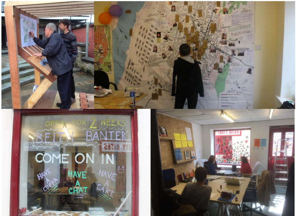
Figure 8: (Top left, clockwise) Public kiosk - 'One thing that would make Beith better?...' / 'Things to do in Beith?'; Beith Past and Present interactive map; Beith Banter - drop-in centre on Main Street; Project Main Street pop-up shop.

AMPS, Architecture_MPS; Liverpool John Moores University 08-09 September, 2016