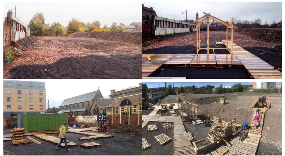
Figure 5: The site developing (clockwise from top left)

Pollockshields Playhouse was located on a brownfield site opposite the Tramway and could be read spatially as deriving much of its identity from Tramway's agenda of creativity and co-operation. However, it differed insofar as the Playhouse was public space which was wide open to interpretation - it was just a big, walled space with a quite small gate and lots of rubble. But insofar as it was practicable, Playhouse was unbounded which allowed programmes of social activities to emerge in space according to the identity of Pollckshields as a singular place. In this way, the Playhouse acted as a framework onto which socio-culturally relevant programmes could be applied and tested.