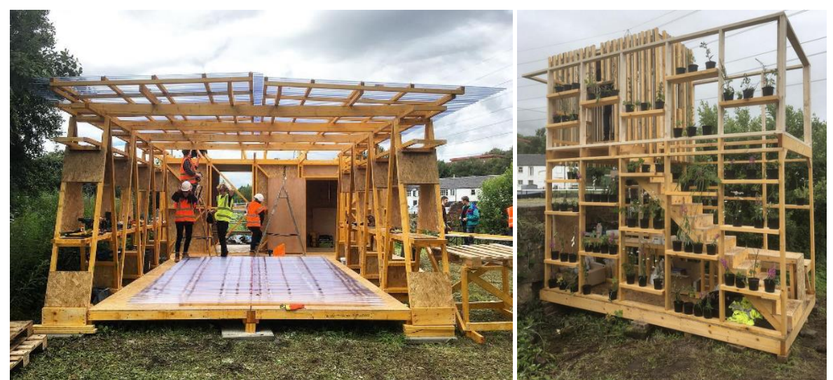
Figure 2: Test Unit, showing main pavilion under construction (left) and 'The Nettle Inn' (right).

By developing the site in a single week, Test Unit also demonstrated the potential of a shorter development process to parties invested in the site, both in terms of how quality occupation can be achieved quickly - it doesn't have to be slow and arduous - but also how knowledge about urban space can be more effectively revealed through the act of design-making rather than talking. In addition, as a live process Test Unit avoided the tendency towards abstraction that can declaw participatory practice - the work remained vital.