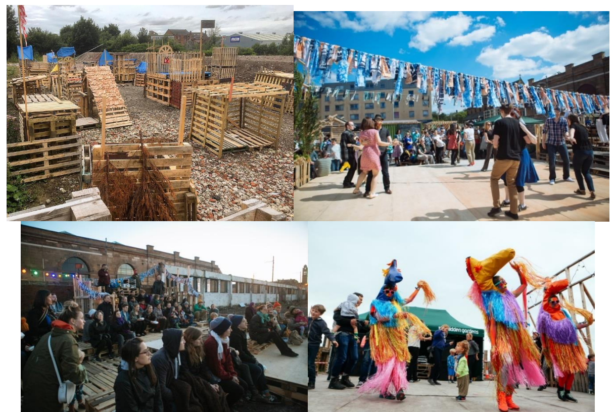
Figure 6: Activities on-site (clockwise, top-left) - Tinker Town; dance; theatre; carnival.

AMPS, Architecture_MPS; Liverpool John Moores University 08-09 September, 2016