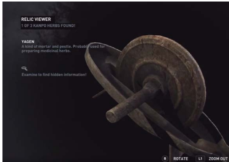
Figure 1: A relic in Tomb Raider . The information gained has no bearing on the overall game narrative, serving as a bonus and optional reward rather than integral element of the game.

As with Linde and Robra (2016), in these games it is possible to explore and examine the artifacts and to attempt to use these to understand the past of the game world, however this is a fixed ‘known’ story that does not require archaeological reasoning for its discovery.