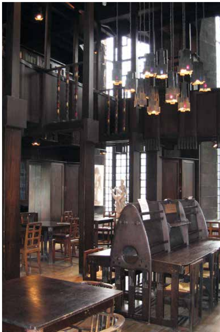
Interior of the library before the devastation.