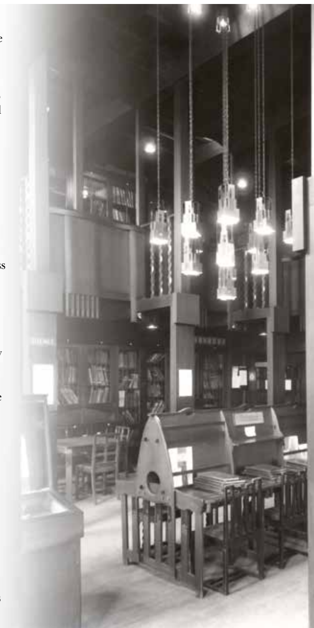
From the archives: an early image of the library Picture © GSA.

The School's librarians have now completed the sobering task of identifying the volumes that were lost in the fire, and of updating the online catalogue and some external union catalogues such as ESTC. The data in other catalogues such as Suncat and Salser may take slightly longer to update, but this too is being worked on. The Main Library, which holds the majority of lending collections, is unaffected and operates as normal. The School's archives and collections are also, for the most part, safe, though they have suffered some water and smoke damage and