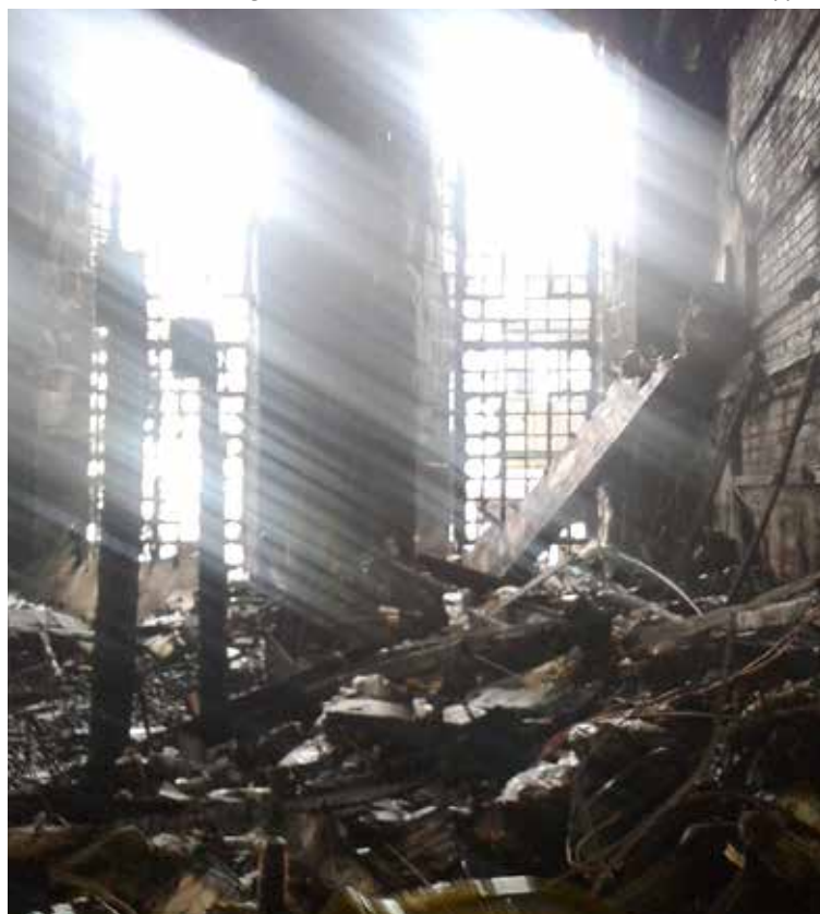
The gutted remains after the fire.