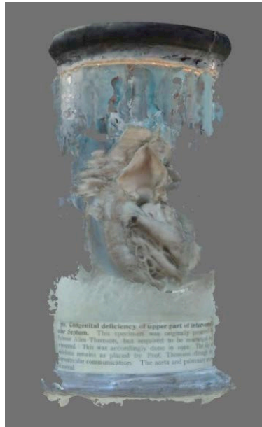
Figure 3: Wet specimen visualised by photogrammetry, displaying artefacts from preservation fluid and problems caused by glass reflection.