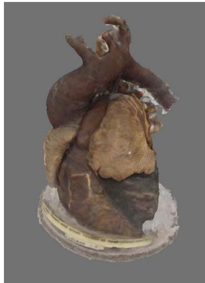
Figure 2: Dry specimen visualised by photogrammetry, showing parts of container and label interpreted by software as part of specimen.

Similarly good results were obtained for dry specimen, although problems were caused by the glass jar which prevented visualisation of the bottom of the specimen (Fig. 2). For aesthetic reasons, it was decided to recreate the glass bottom rather than keep the specimen with a hole; as such, the same 'hole closing' functionality as above was applied, with similar future potential for utilising more accurate modelling software. Further limitations included the labels on the glass, which were interpreted by the software as part of the specimen and thus resulted in an inaccurate virtual model; similarly, distinction of closely adjacent structures, such as the branches of the aortic arch, was not ideal and white cloudy artefacts remained in between the structures. Nevertheless, the texture and quality were excellent, and no particular problems were encountered on account of light reflection through the glass. As such, this method would lend itself to other dry specimens, such as varnished organs or resin casts which are frequently mounted rather than resting on a base, and to bone specimens, which could be suspended to allow for capture from all angles. This would prevent problems such as the failed attempt to acquire usable photographs from underneath the specimen, although this problem might similarly be addressed with a more elaborate camera set-up and a glass table, as successfully done in the context of photogrammetrical gait measurement [36].