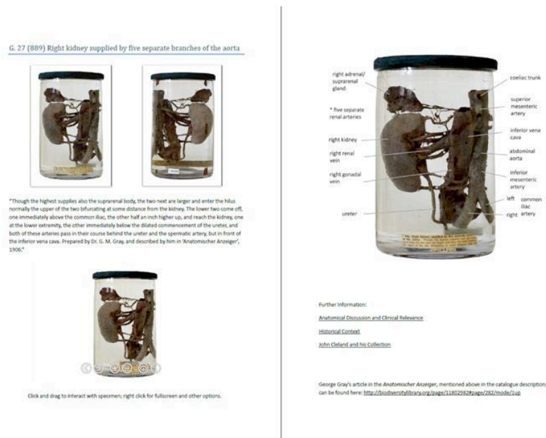
Figure 5: Screenshot of typical PDF layout including labelled photographs, catalogue text, interactive object VR specimen, and navigation menu.

The resulting U3D and Flash files could be embedded into a PDF file using Adobe Pro XI without any issues. The software is easy to use without previous experience and thus allows for reasonably quick and straightforward assembly of the multidisciplinary output files once the relevant content has been created. It furthermore allows for the use of links and creation of buttons which make navigation easier and more accessible on account of their resemblance to websites which the user may already be familiar with, and additionally permits the creation of simple quiz facilities (Fig. 5). As PDF furthermore includes a screen reader functionality, allows for the inclusion of audio content, and provides options to increase font size, this may indicate the suitability of this output format for increased inclusiveness in the context of disability as well as complementary learning styles. Similarly to Flash, Adobe Reader finds frequent use already, but if it is not available on a computer it can be downloaded for free from the producer's website [40]. As such it allows for the presentation of the interactive content without need for specialist software.