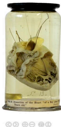
Figure 4: Front view of wet specimen object VR, including interface controls at the bottom.

Object VR results for all material types were of excellent quality, highlighting the particular usefulness of this method for anatomical specimens (Fig. 4). Interactive virtual objects were obtained for all specimens, and there were no limitations as a result of glass containers or preservation fluid. Once the methodology had been established and the best camera settings and post-processing criteria determined, models could be created reasonably quickly, with image acquisition and object VR times of under half an hour per specimen; the most time-consuming aspects were the image post-processing in Photoshop CS6 and, if applied, the hotspot labelling, bringing the time per specimen to between four and eight hours, although this time is likely to decrease with expertise and optimisation. The addition of hotspot labels, while time-consuming, was considered to be an approach which increases understanding of the anatomical structures of the specimens in a way which was more interactive and conducive to spatial learning than more traditional labelled photographs of front- and side- or back- views (which were nevertheless also provided with the output PDF file to provide complementary educational approaches). The results could be viewed either in a standalone Flash viewer, opened in a web browser, or (as intended) as part of a PDF; for the latter two options, an up-to-date Flash plugin is required which is available for free download [39].