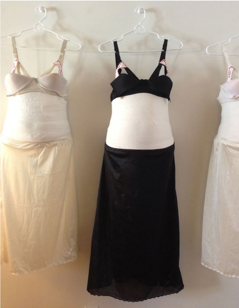
Jeca Rodríguez-Colón Because..... 2013

Plaster, slip, hand-embroidered maternity bra, cloth diaper Dimensions variable.