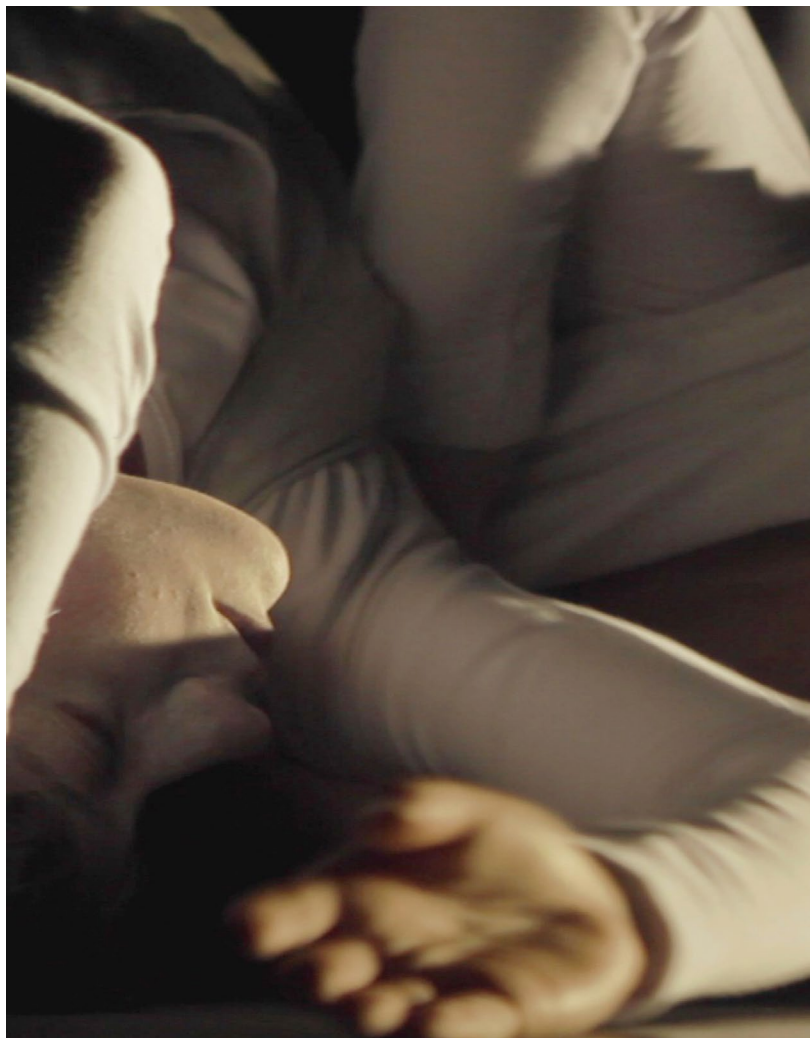
Valerie Walkerdine The Maternal Line , 2014

Video installation with performance (detail)