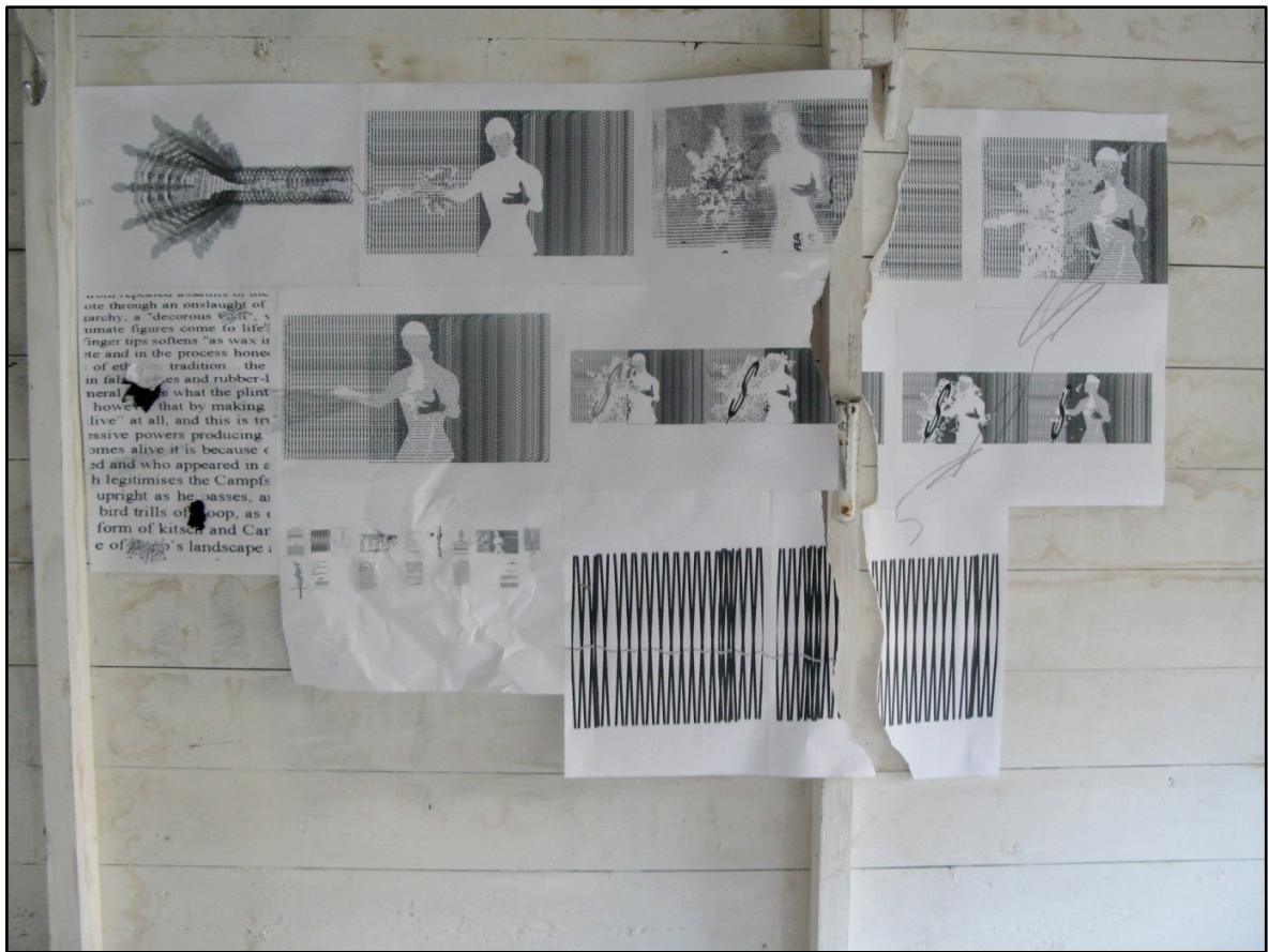
6. Laurence Figgis, Iconographies of death and cheese , 2008, digital print, paper-collage, graphite, crayon, ink and ball-point pen on paper, 70/120 cm.