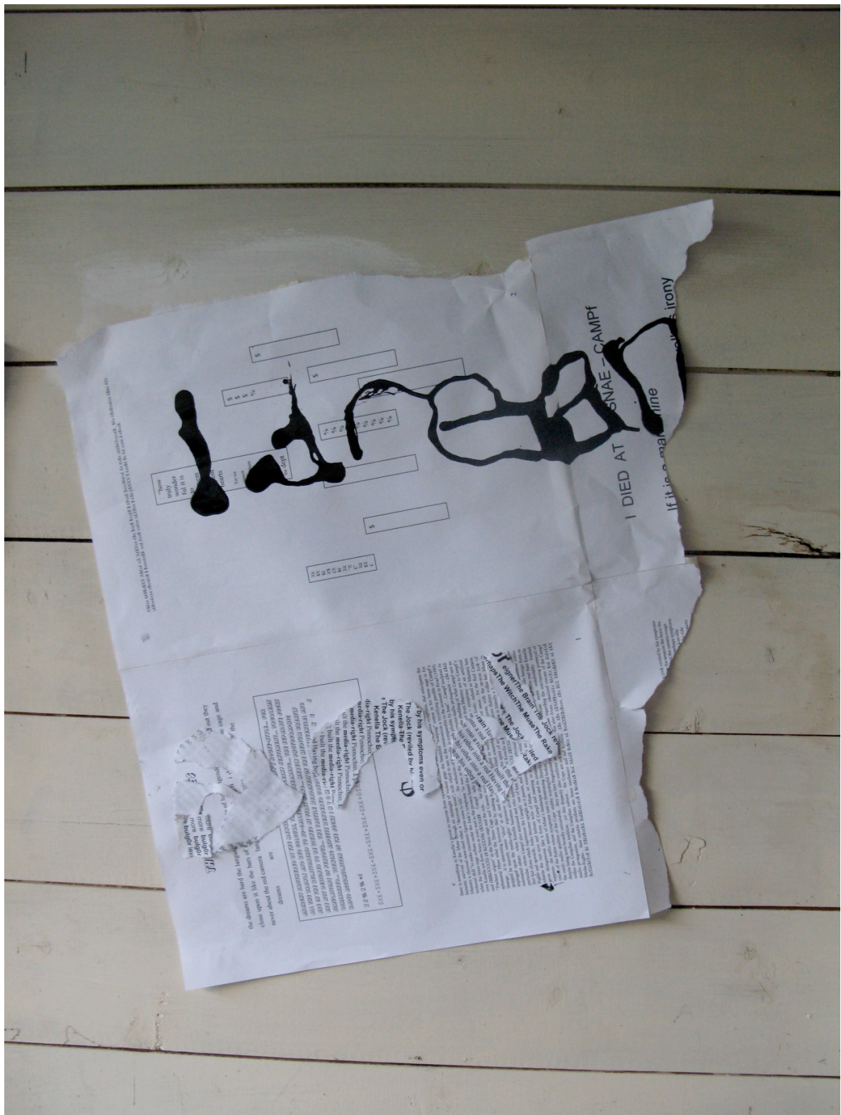
5. Laurence Figgis, I dream... , 2008, digital print, paper-collage, ink on paper 42/31 cm.