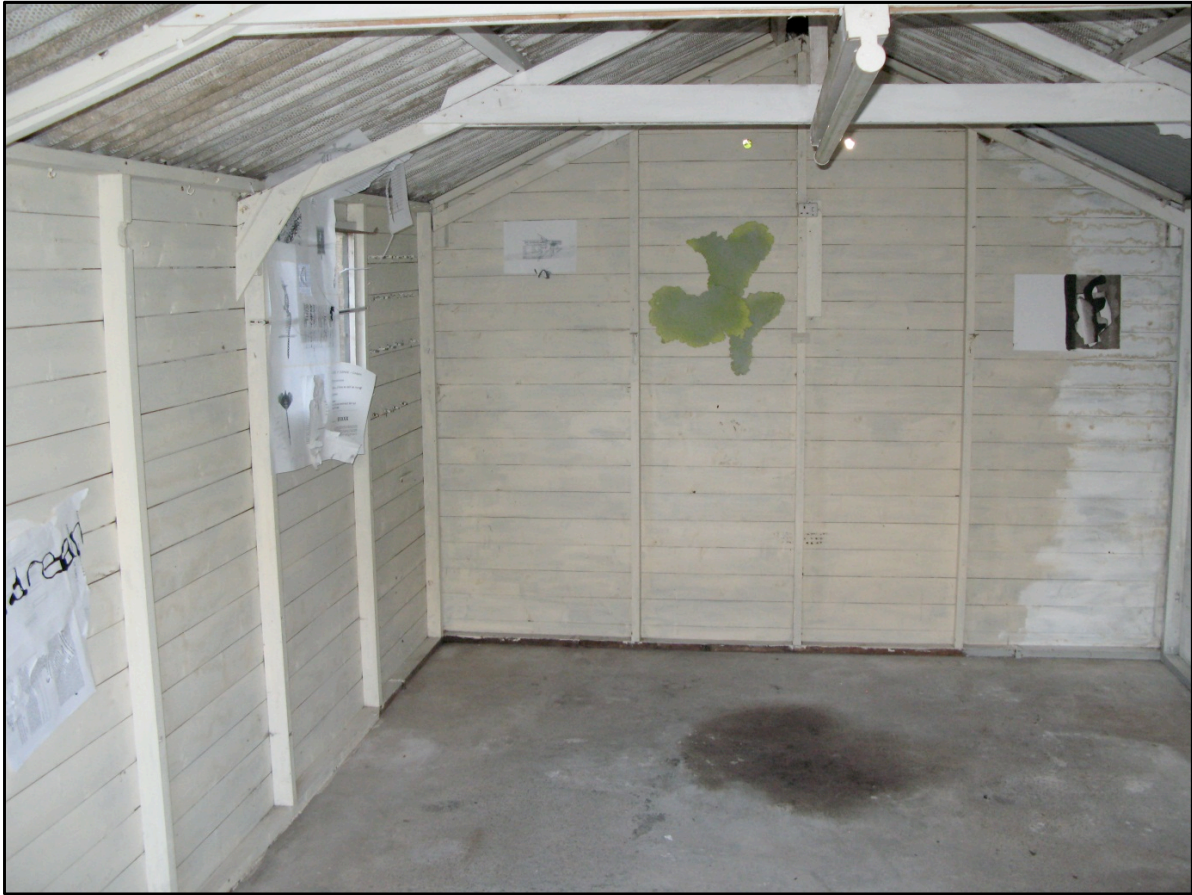
1. 'Men and Bits of Paper Whirled by the Cold Wind,' the Shed, Glasgow, 00/09/2008-00/09/2008, installation view (showing works by Laurence Figgis and Lynn Hynd).