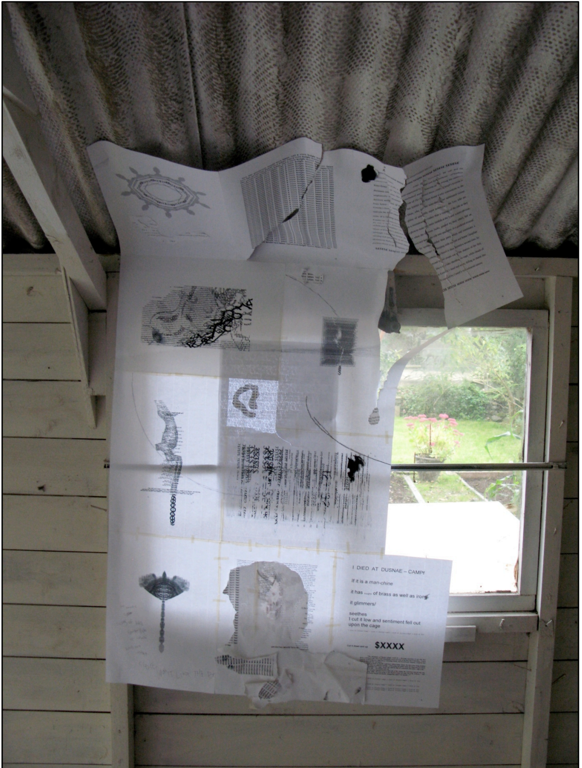
4. Laurence Figgis, I died at Dusnae-Campf , 2008, digital print, paper-collage, graphite, crayon, ink and watercolour on paper, 111/63 cm.